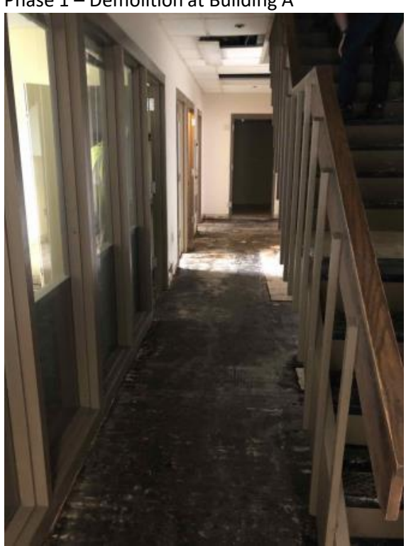
Phase 1 – Demolition at Building A