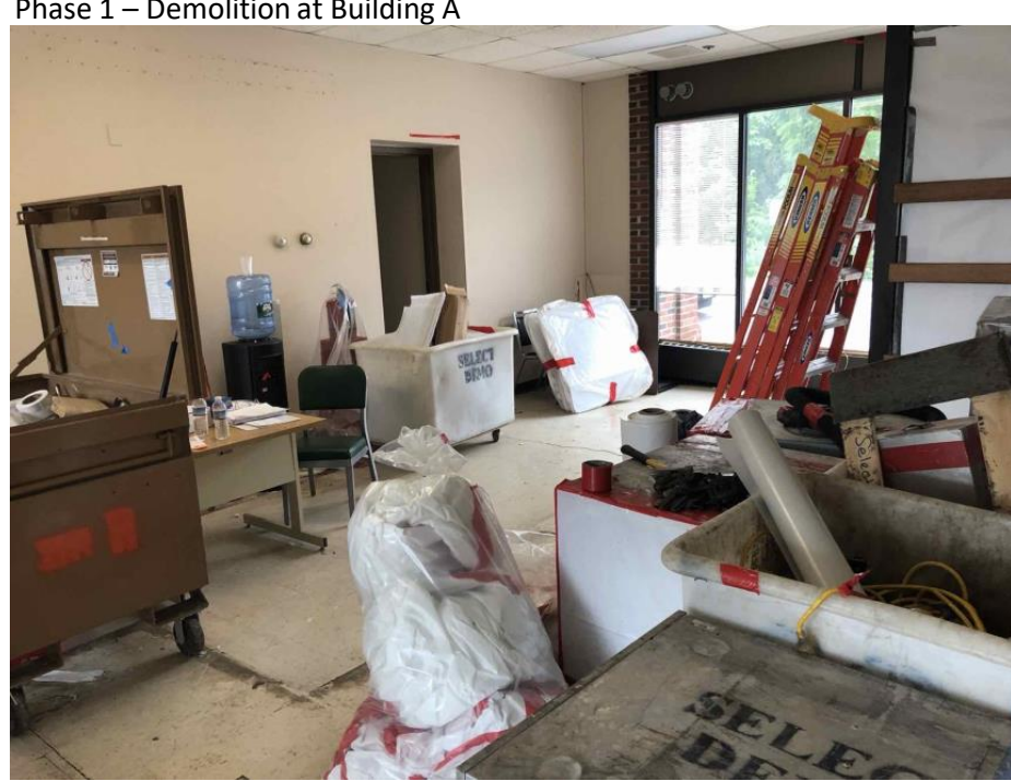
Phase 1 – Demolition at Building A