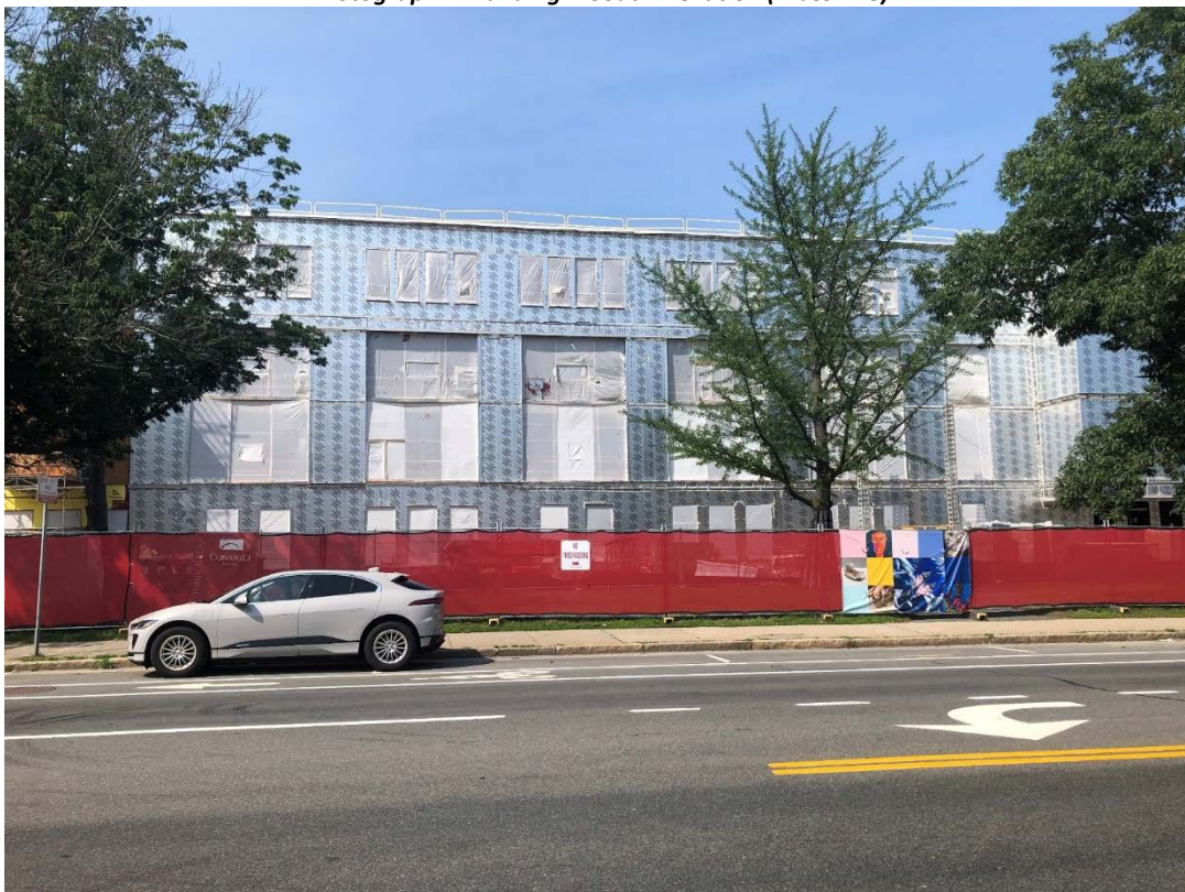
Photograph 8: Building D South Elevation (Mass Ave)