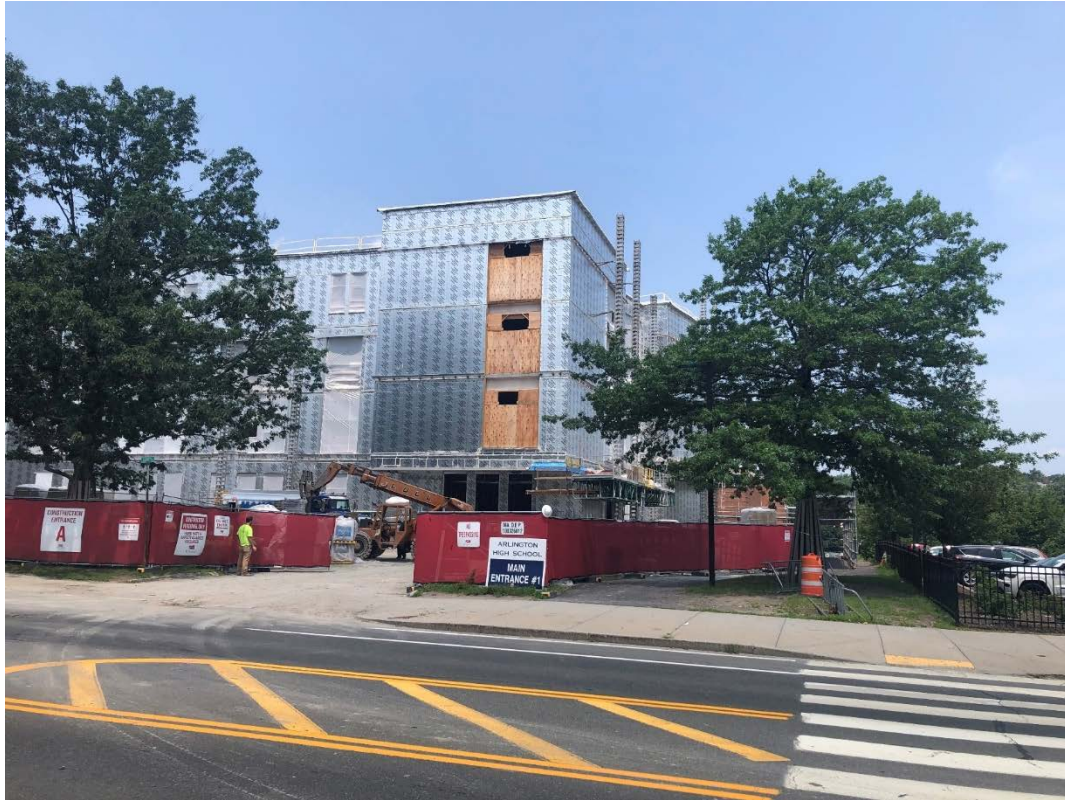
Photograph 7: Building D South Elevation (Mass Ave)