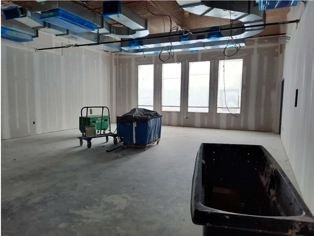
Photograph 3: Typical STEAM Wing Classroom Progress