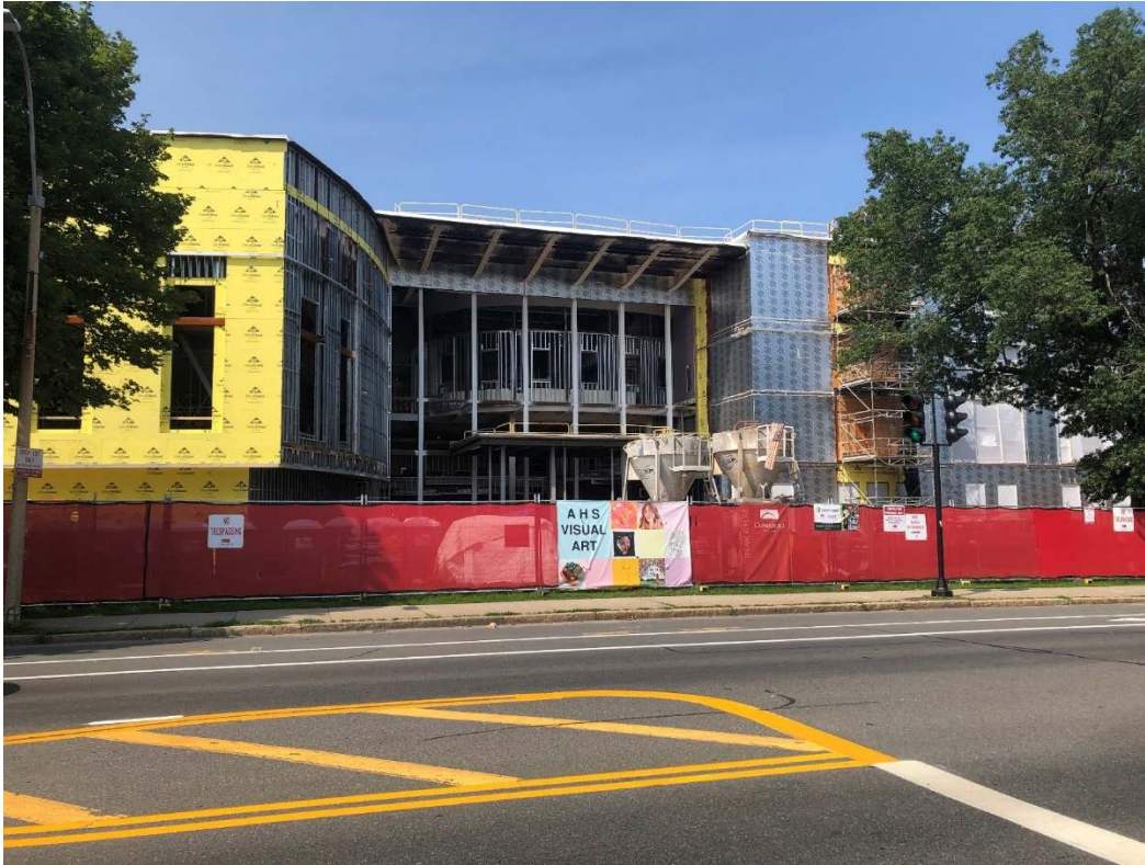
Photograph 5: Phase 1 South Elevation (Mass Ave)