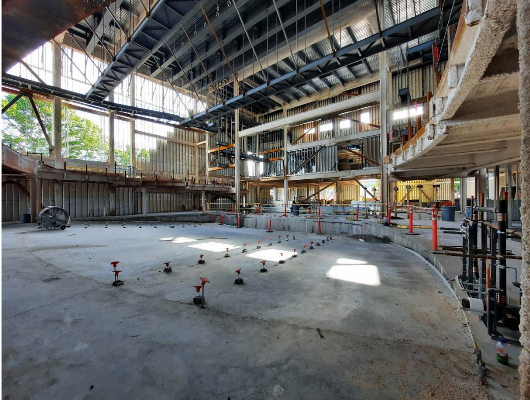
Photograph 1: Auditorium Progress (Southwest Elevation)