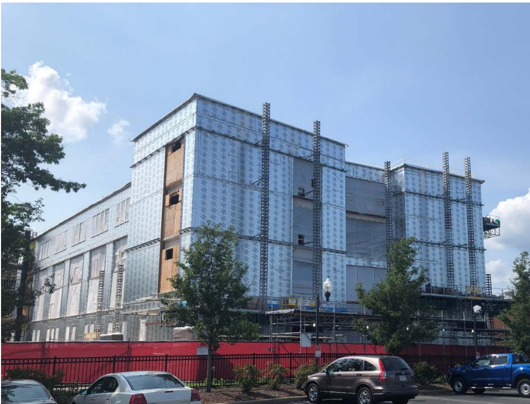
Photograph 6: Building D East Elevation