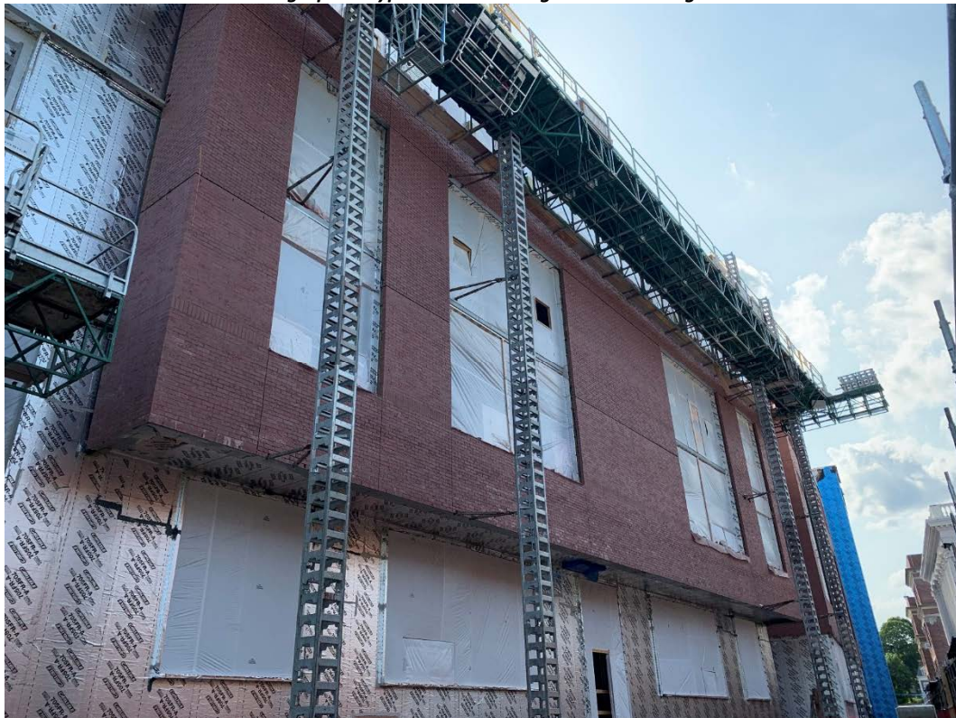
Photograph 4: Building D North Elevation