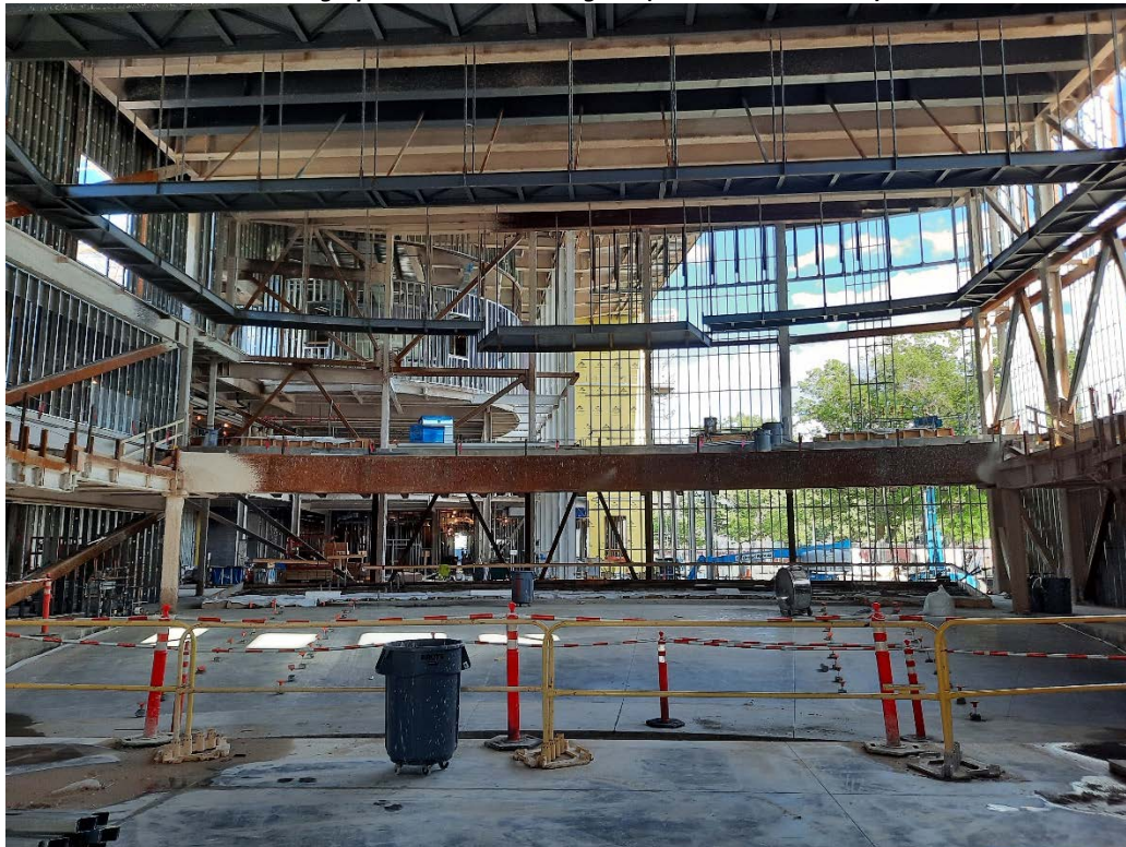
Photograph 2: Auditorium Progress (East Elevation)