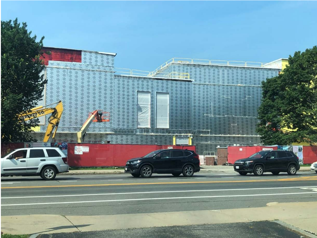
Photograph 9: Building E South Elevation (Mass Ave)