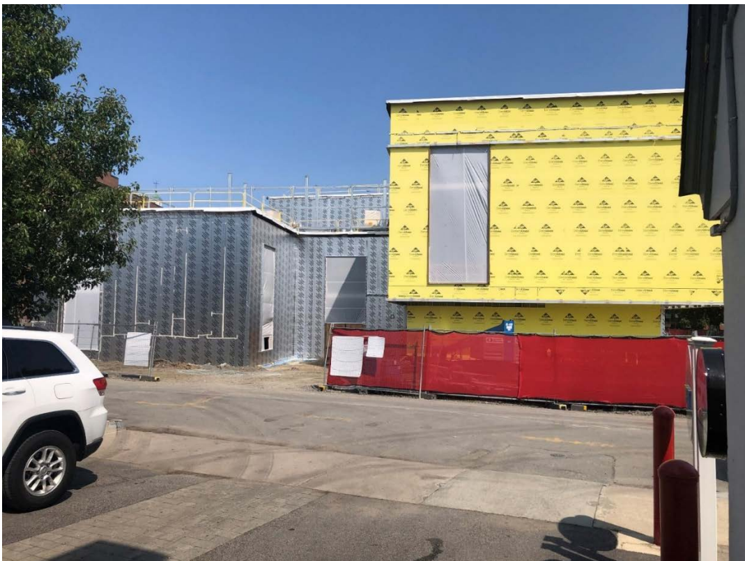
Photograph 10: Building E West Elevation (Schouler Court)