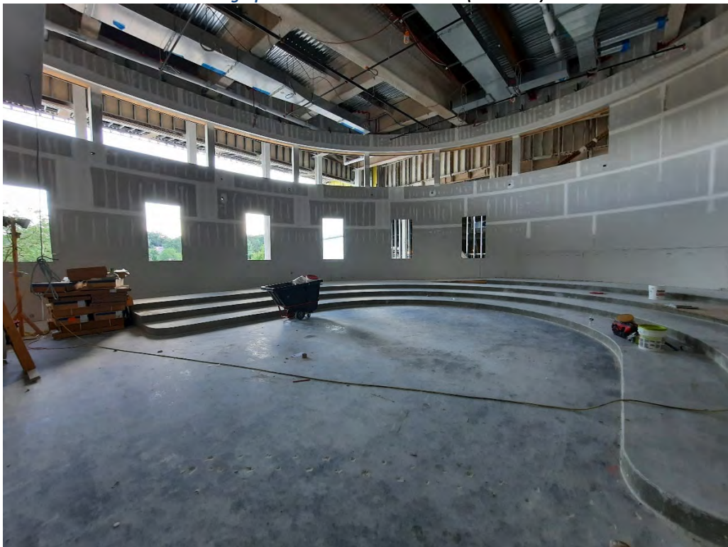
Photograph 2: Phase 1 Debate & Discourse Lab Progress