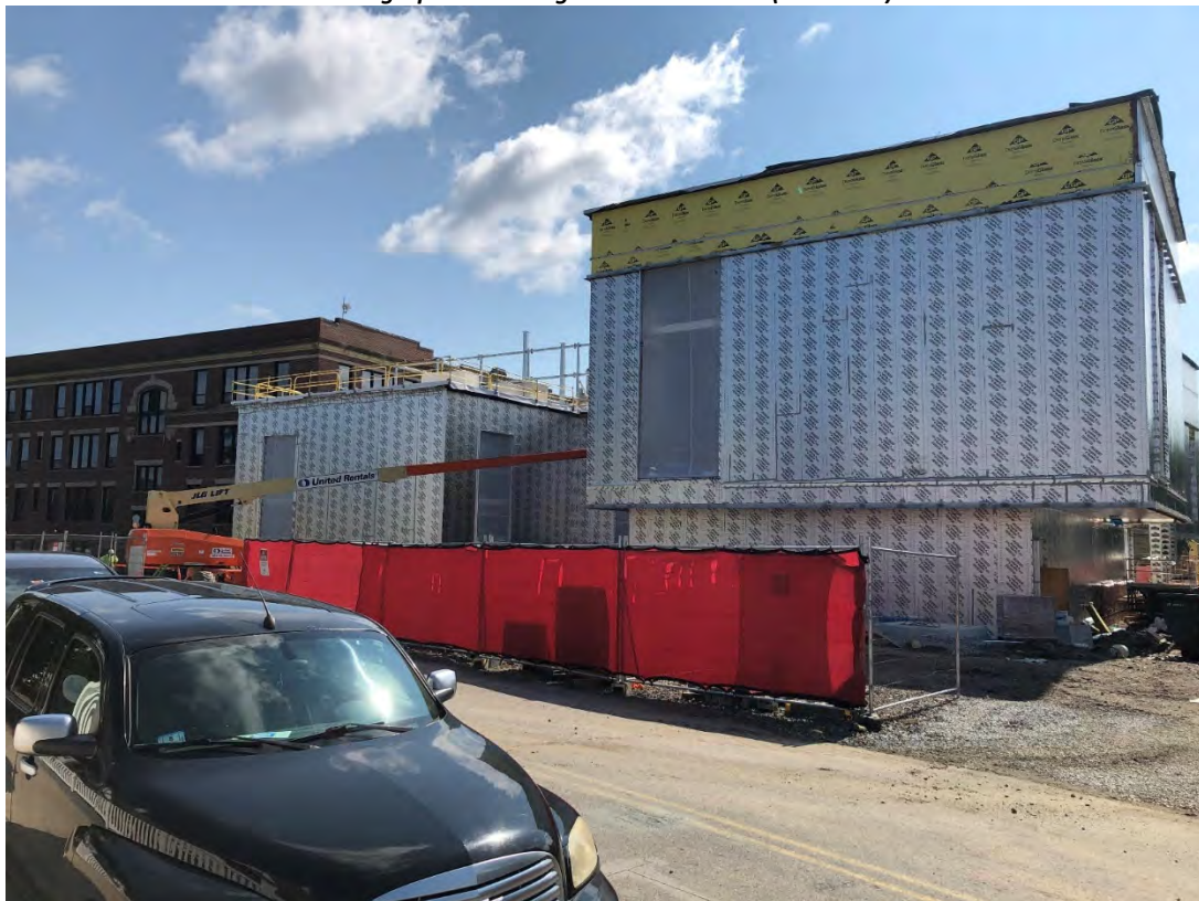
Photograph 10: Building E West Elevation (Mass Ave)