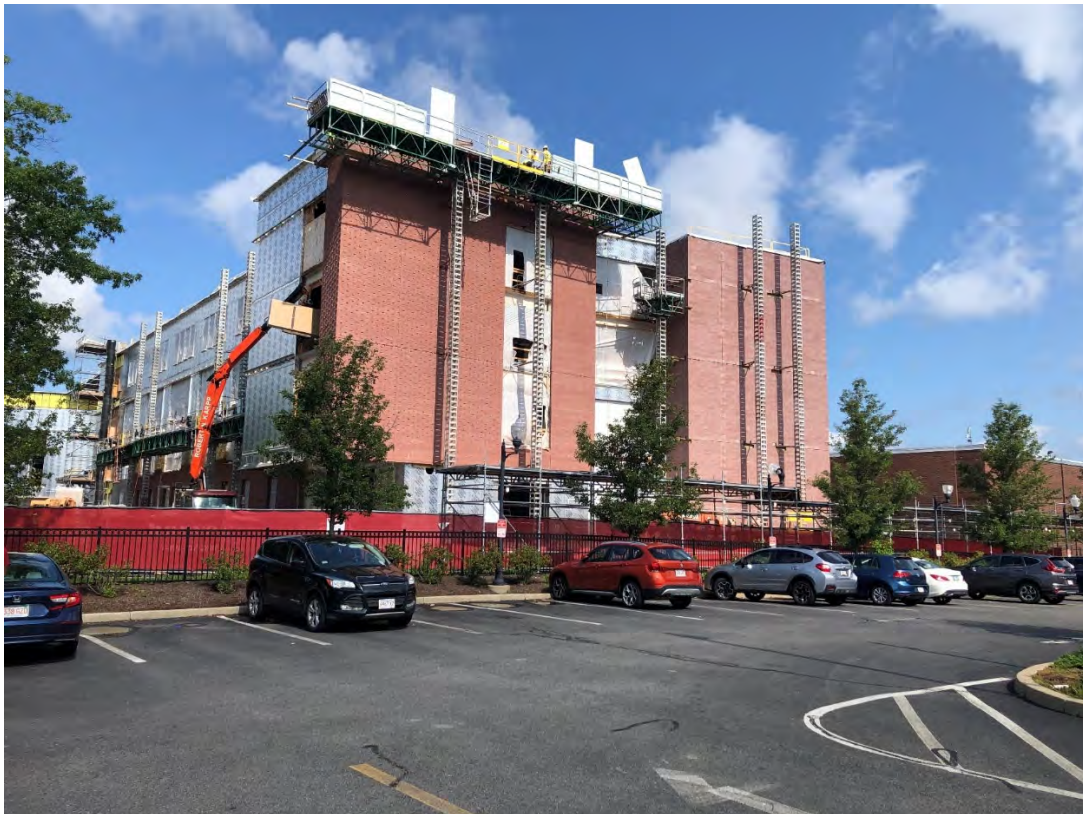
Photograph 6: Building D East Elevation