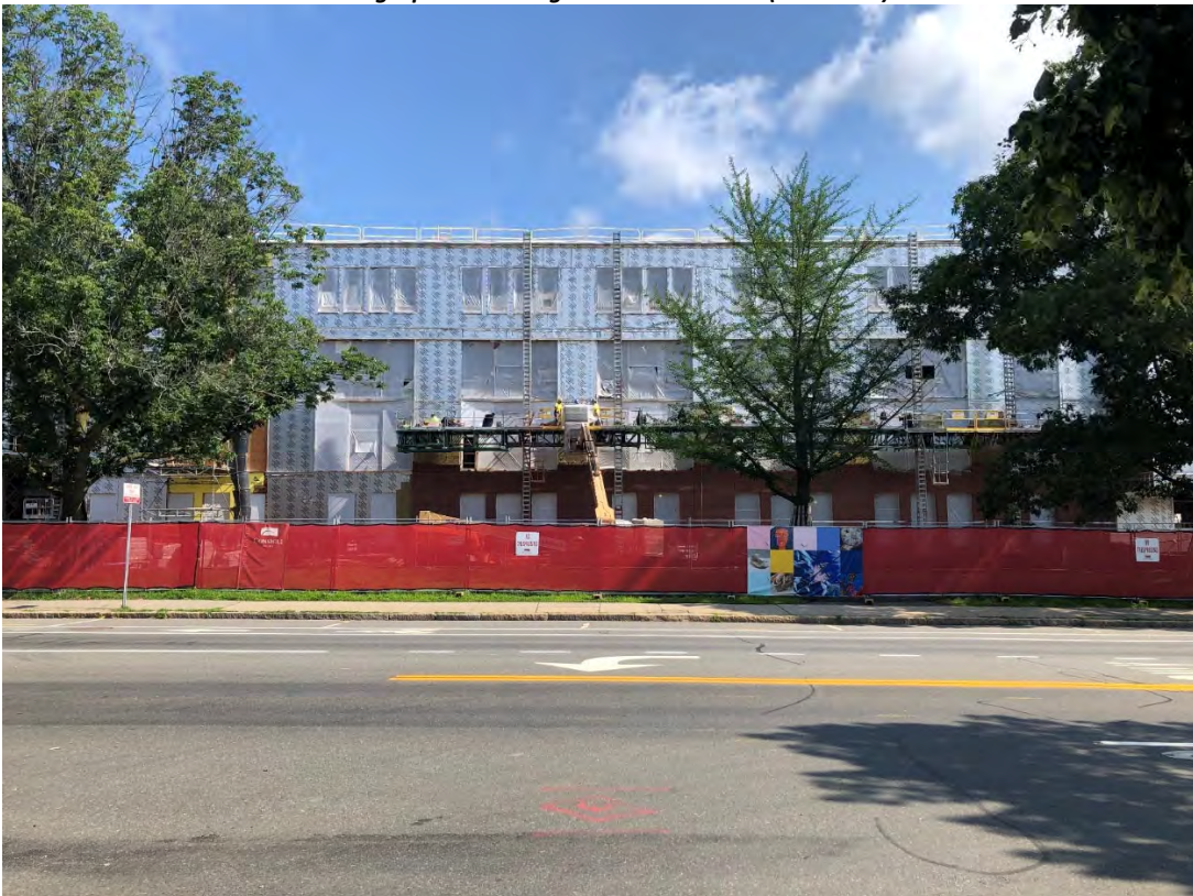
Photograph 8: Building D South Elevation (Mass Ave)