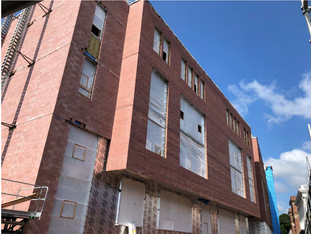
Photograph 5: Building D North Elevation