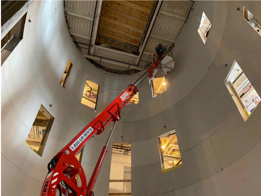
Photograph 3: Phase 1 Light Well Progress