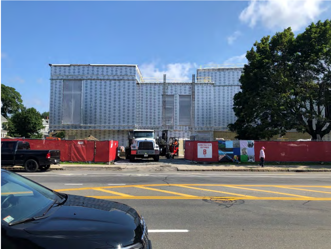
Photograph 9: Building E South Elevation (Mass Ave)