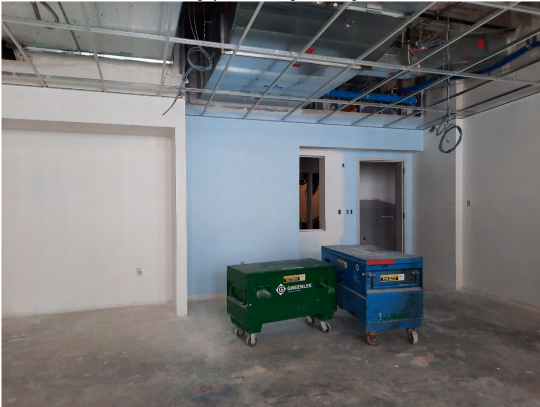
Photograph 4: Phase 1 Typical Classroom Progress