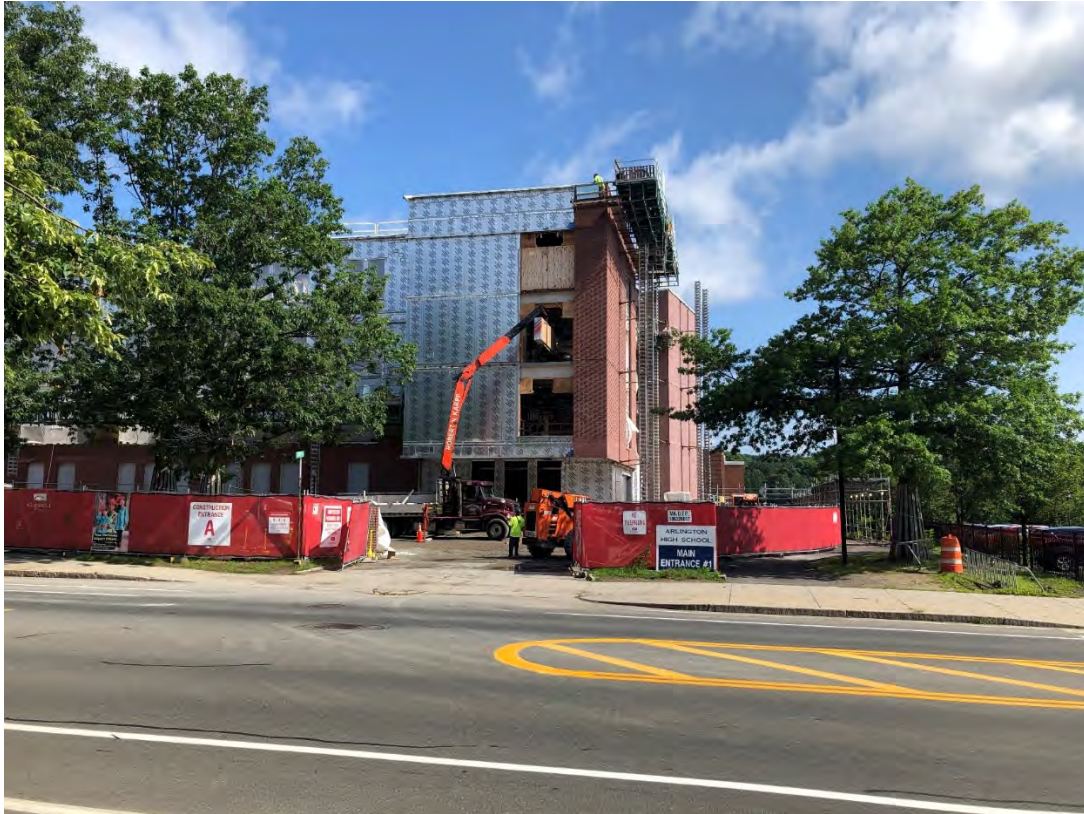
Photograph 7: Building D South Elevation (Mass Ave)