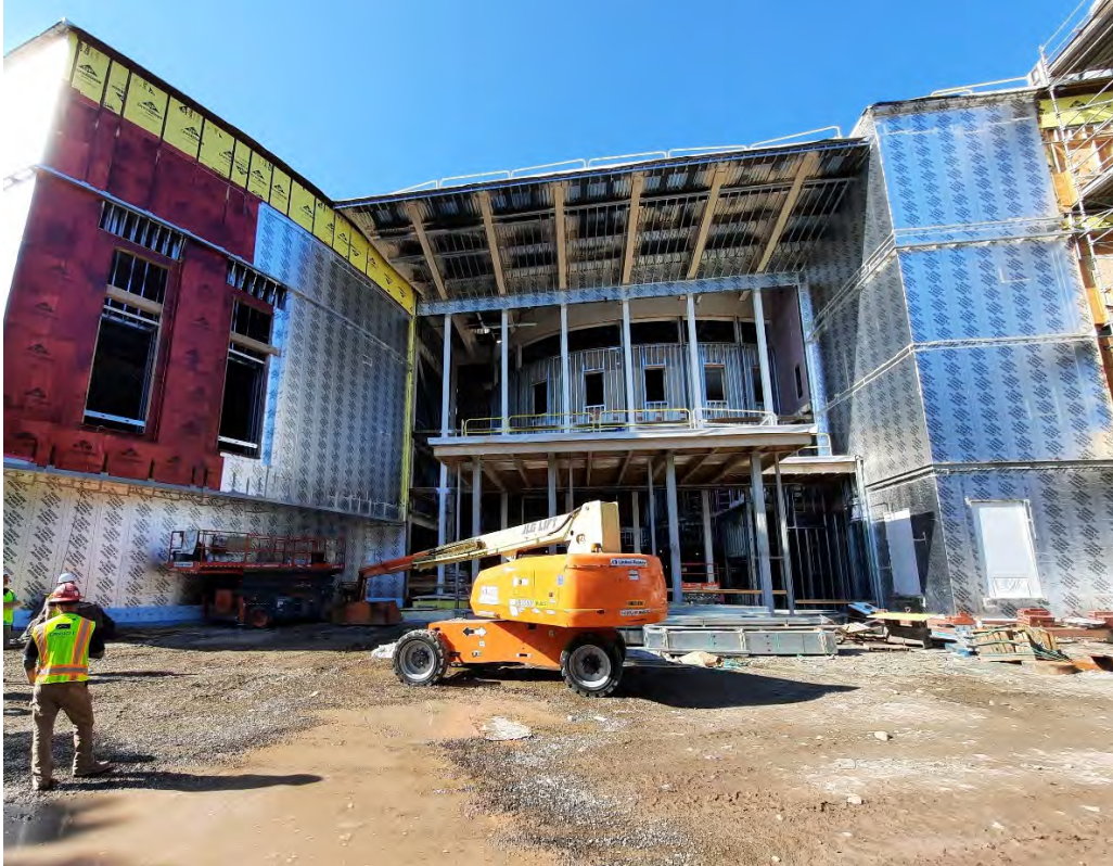
Photograph 1: Phase 1 South Elevation (Mass Ave)