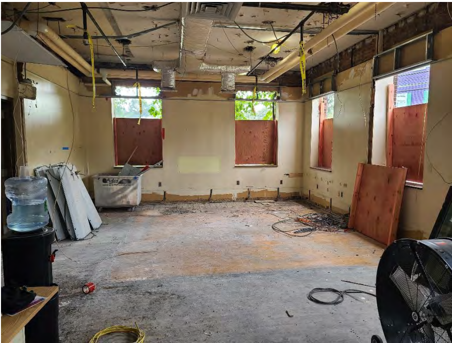
Building A Window & Interior Demo in Progress (Taken 7/20/21)