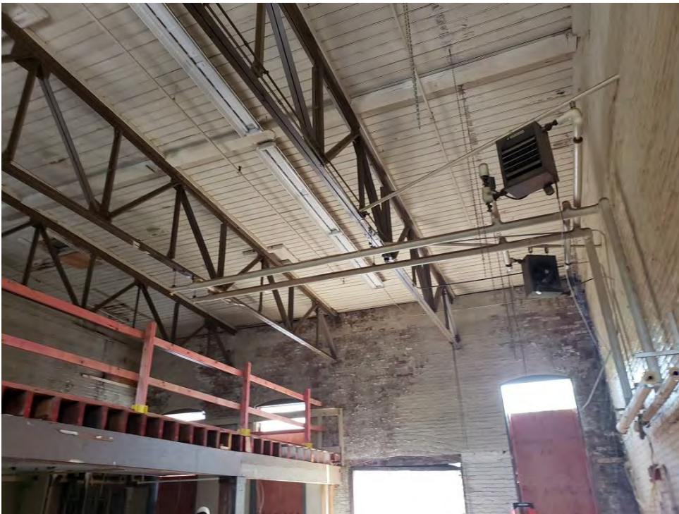
Building A Interior Demo (Taken 7/28/21)