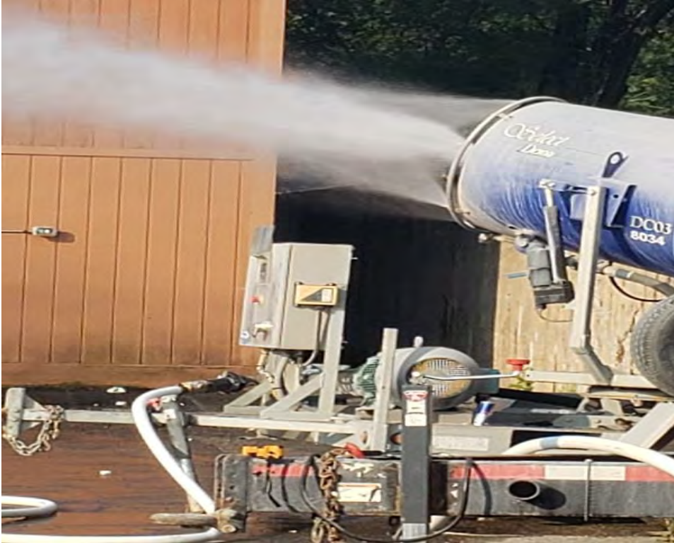
Dust Control for Salt Shed Demo (Taken 7/28/21)