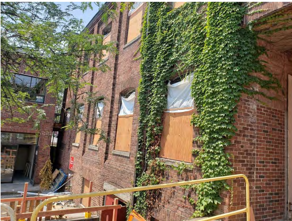
Building A Temporary Window Protection (Taken 7/28/21)