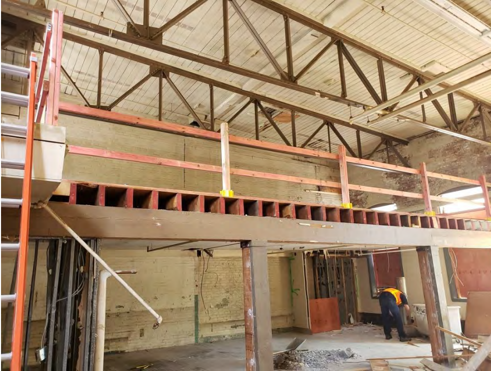
Building A Interior Demo (Taken 7/28/21)