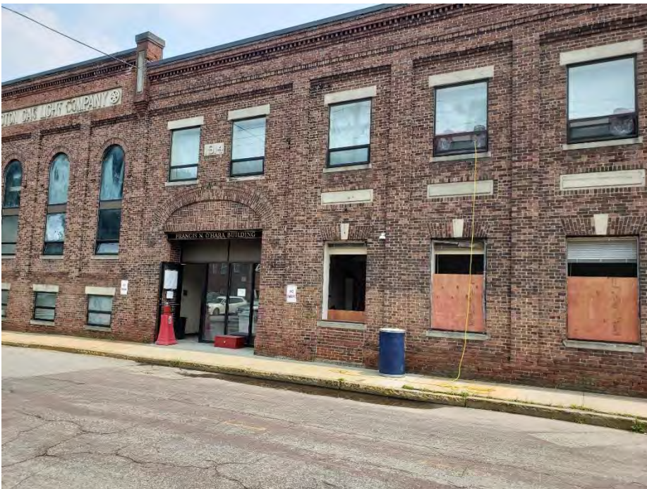
Building A Window Demo in Progress (Taken 7/20/21)