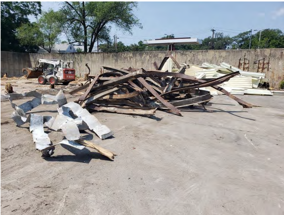
Salt Shed Demo Material Separation (Taken 7/28/21)