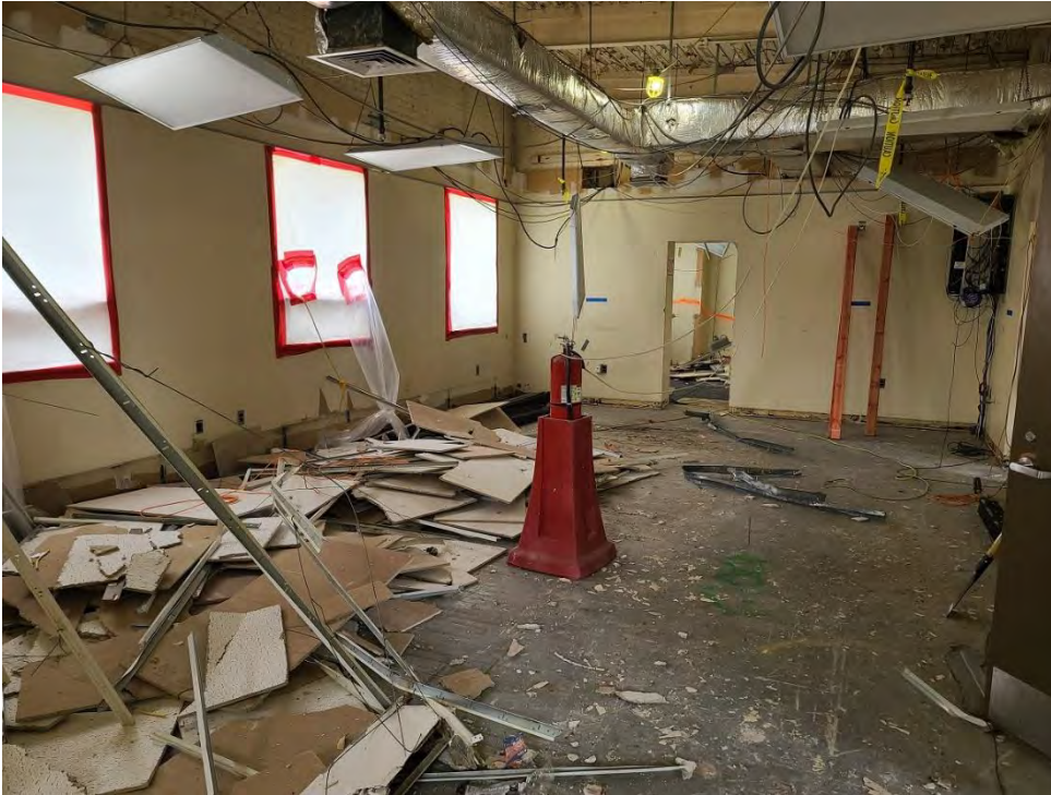
Building A Interior Demo (Taken 7/28/21)