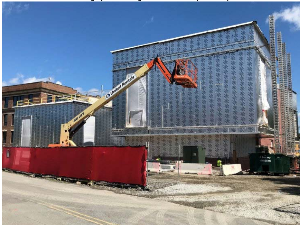
Photograph 6: Building E West Elevation (Schouler Court)