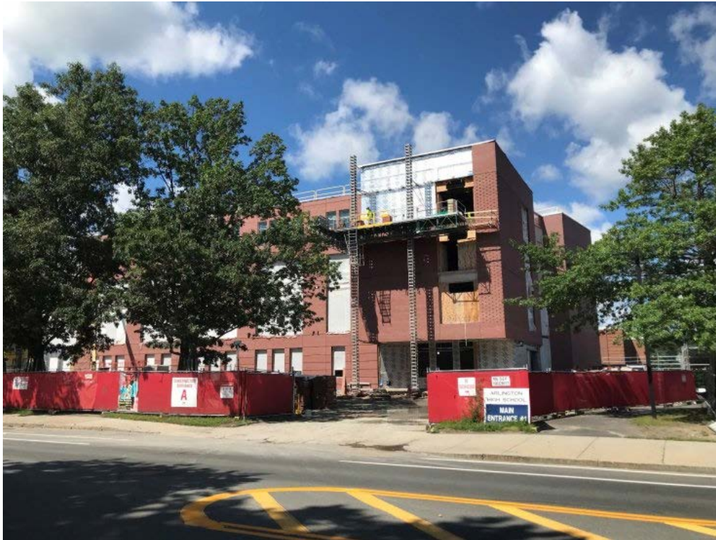
Photograph 3: Building D South Elevation (Mass Ave)