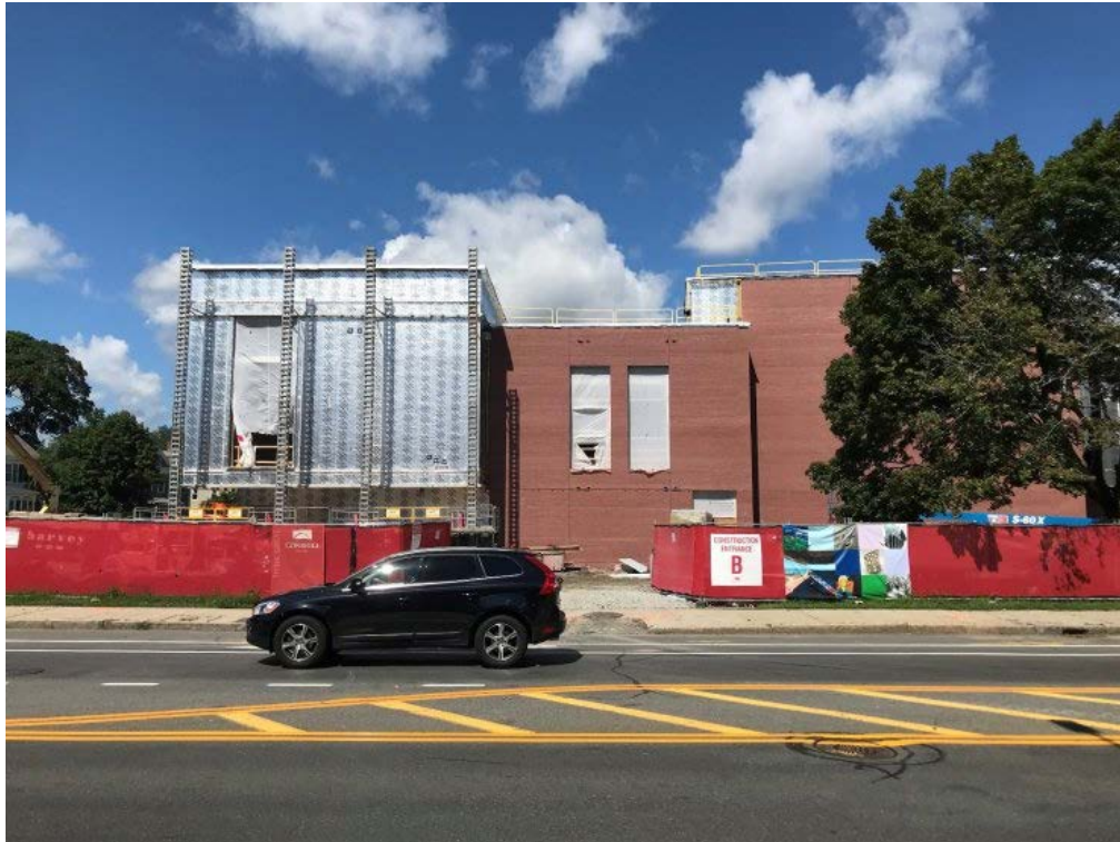
Photograph 5: Building E South Elevation (Mass Ave)