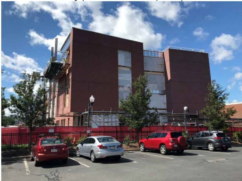
Photograph 2: Building D East Elevation