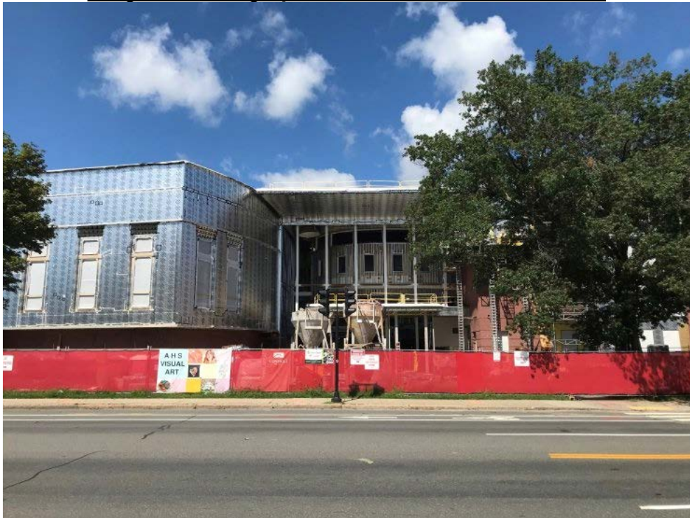
Photograph 1: Phase 1 South Elevation (Mass Ave)