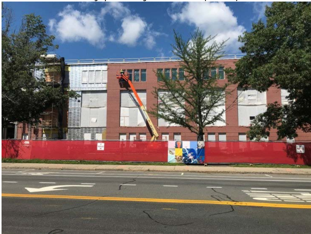
Photograph 4: Building D South Elevation (Mass Ave)