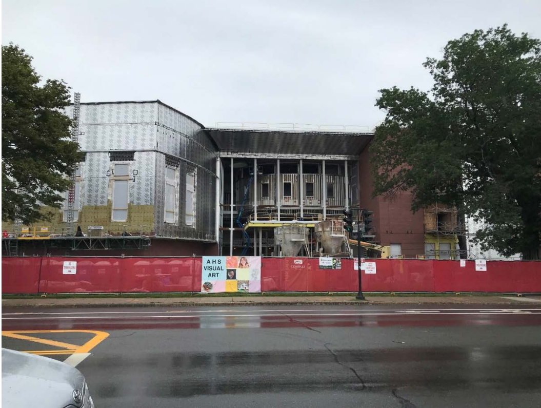
Photograph 1: Building D/E South Elevation (Main Entrance)