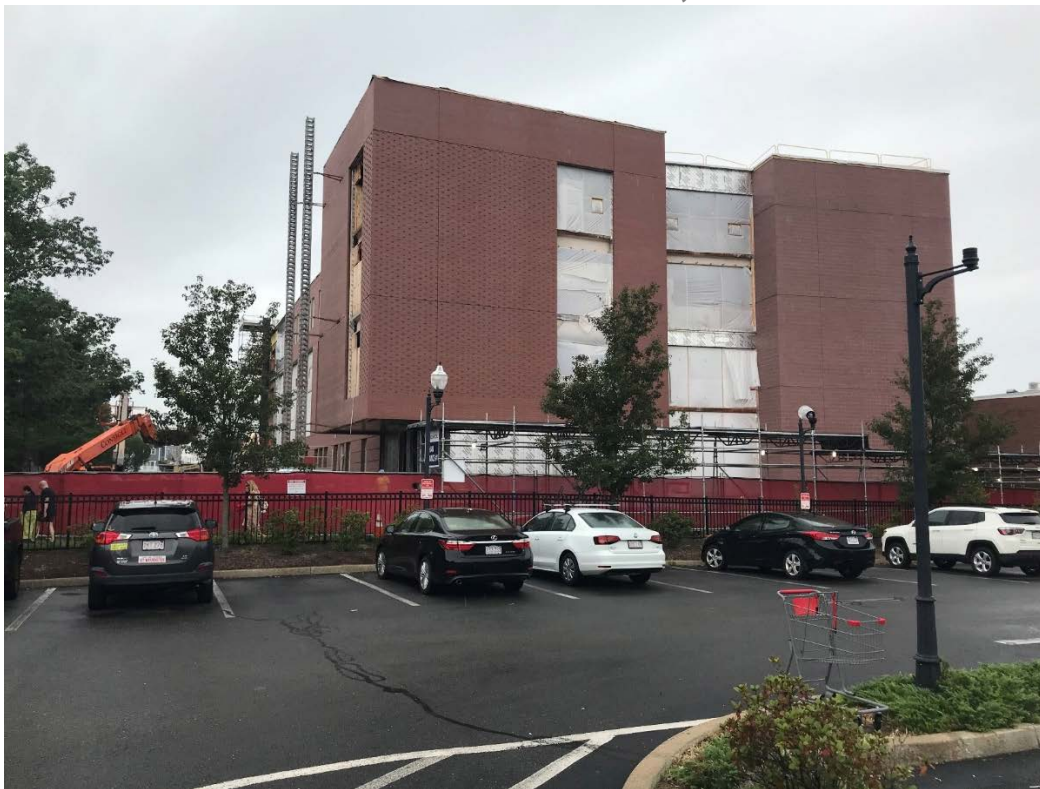
Photograph 3: Building D East Elevation