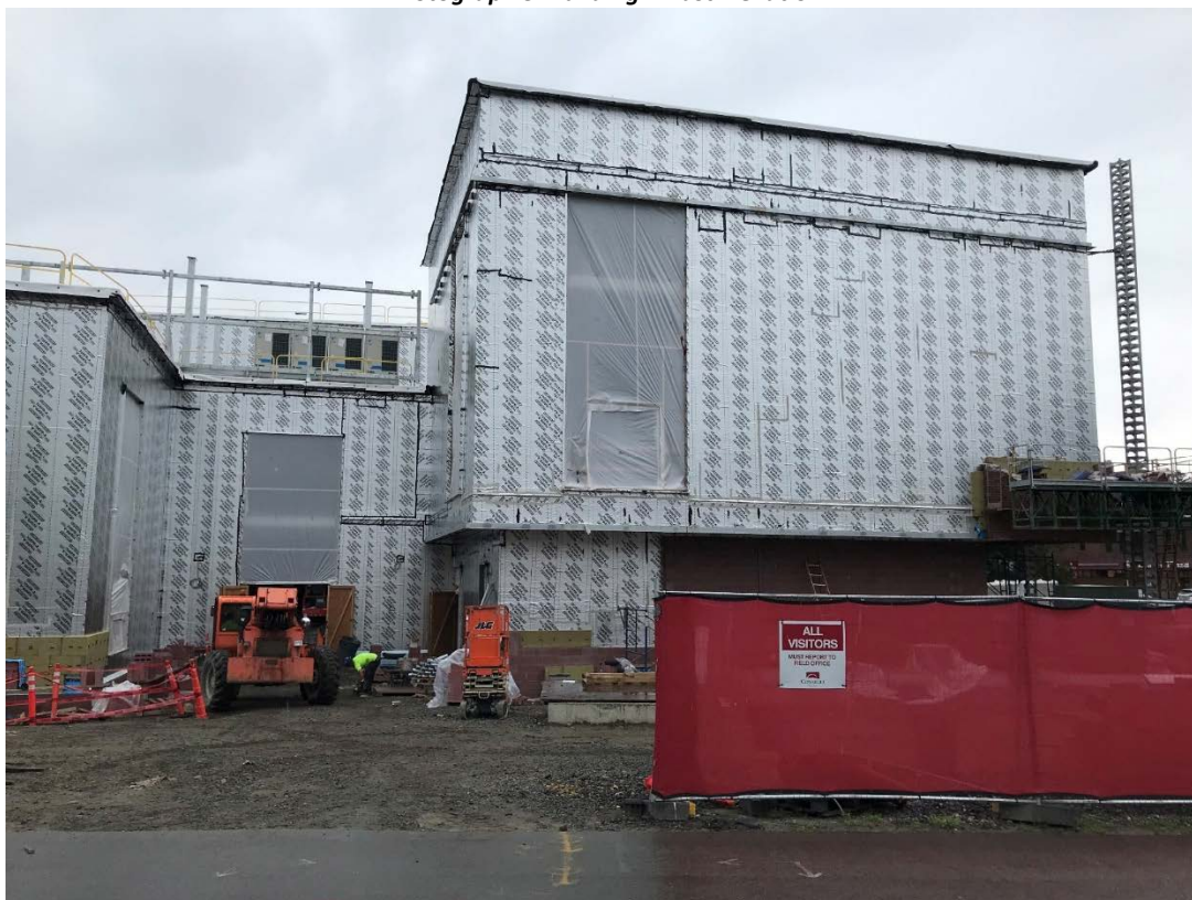
Photograph 4: Building E West Elevation (Schouler Ct)