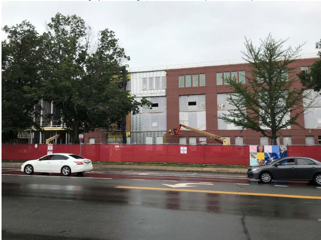
Photograph 2: Building D South Elevation