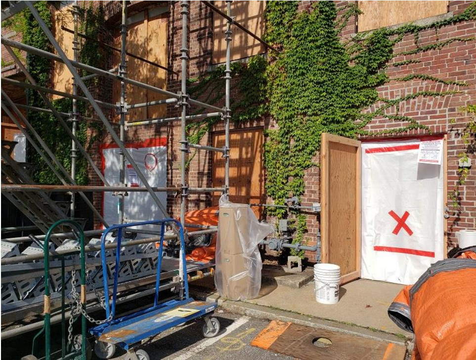
Building A Lead Containment (Taken 8/31/21)