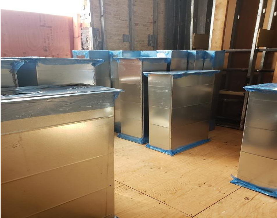
Ductwork on Site (Taken 8/31/21)