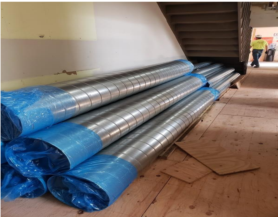
Ductwork on Site (Taken 8/31/21)