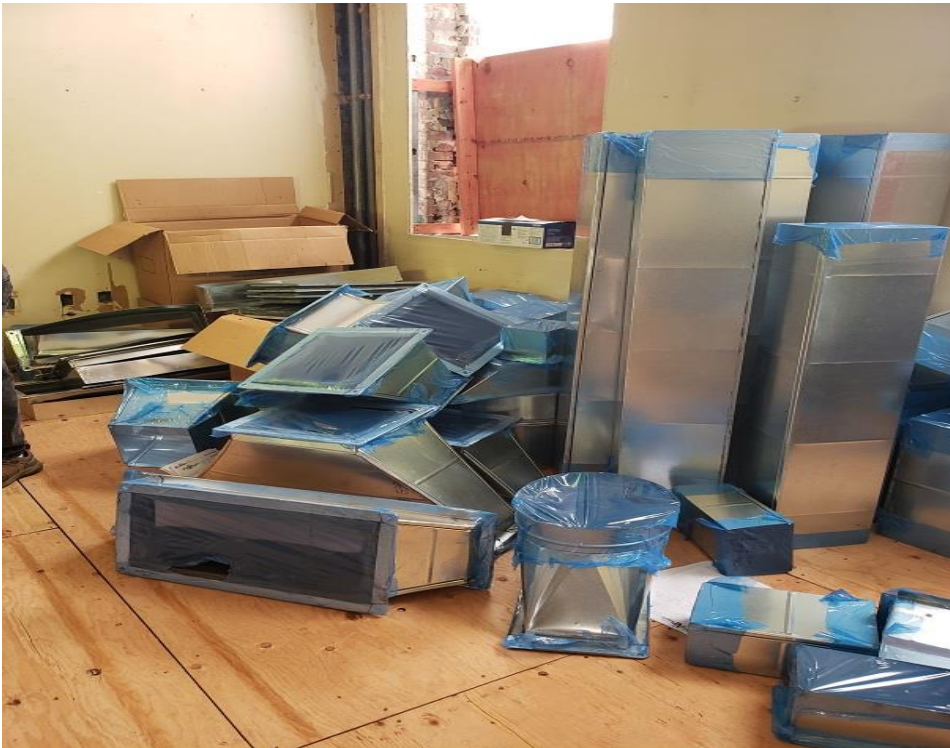
Ductwork on Site (Taken 8/31/21)