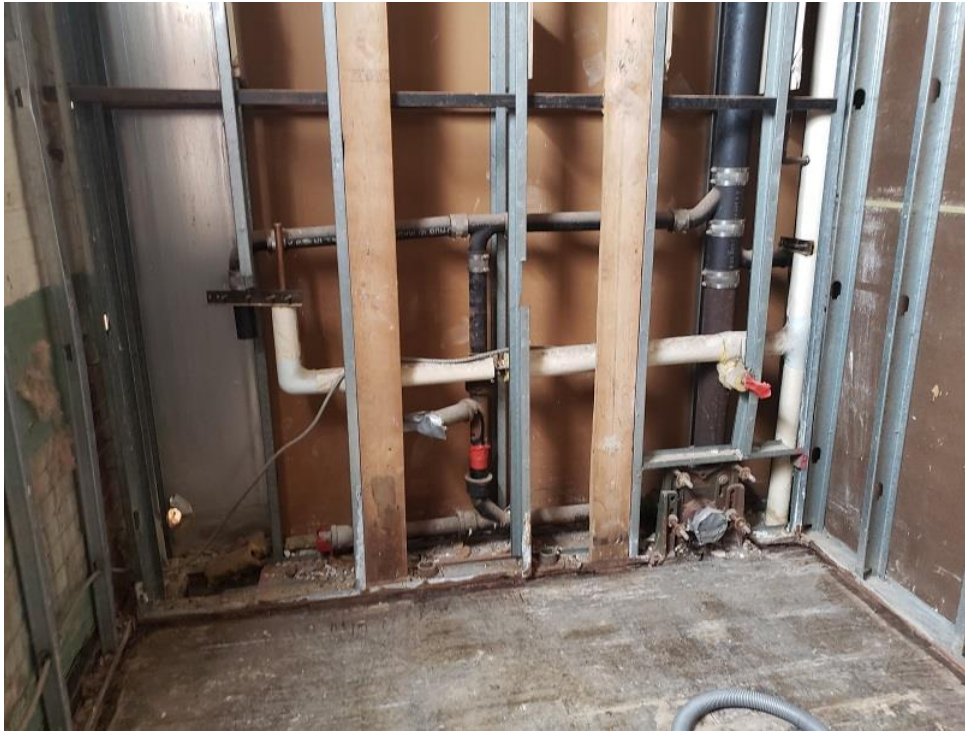
Building A Bathroom After Demo (Taken 8/17/21)