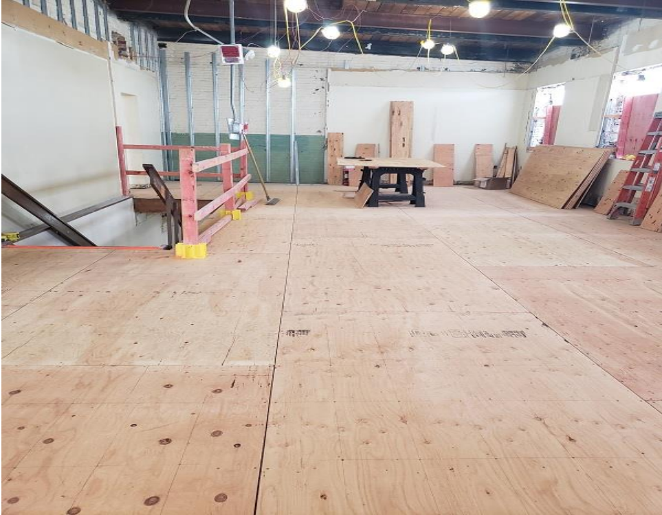
Building A Plywood Subfloor (Taken 8/17/21)