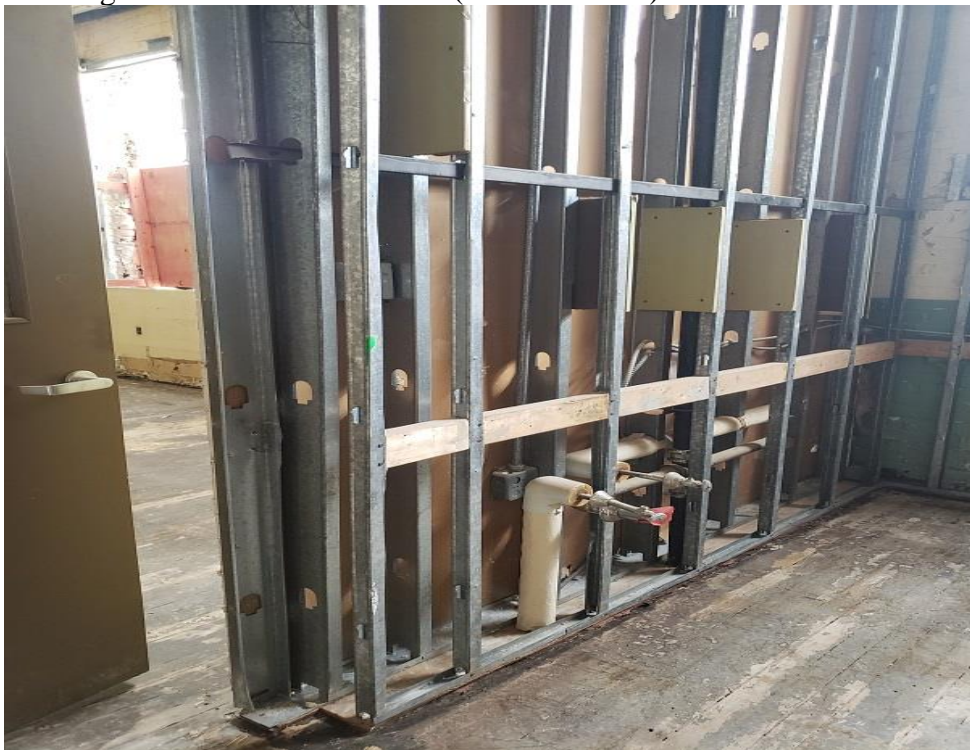
Building A Bathroom After Demo (Taken 8/17/21)