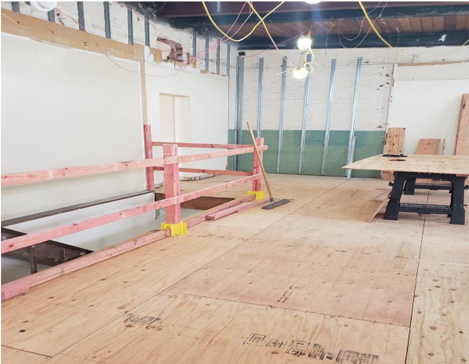
Building A Plywood Subfloor (Taken 8/17/21)