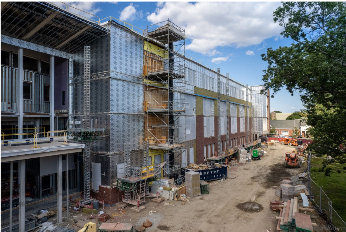
Photograph 2: Mass Ave Drone Progress Photo