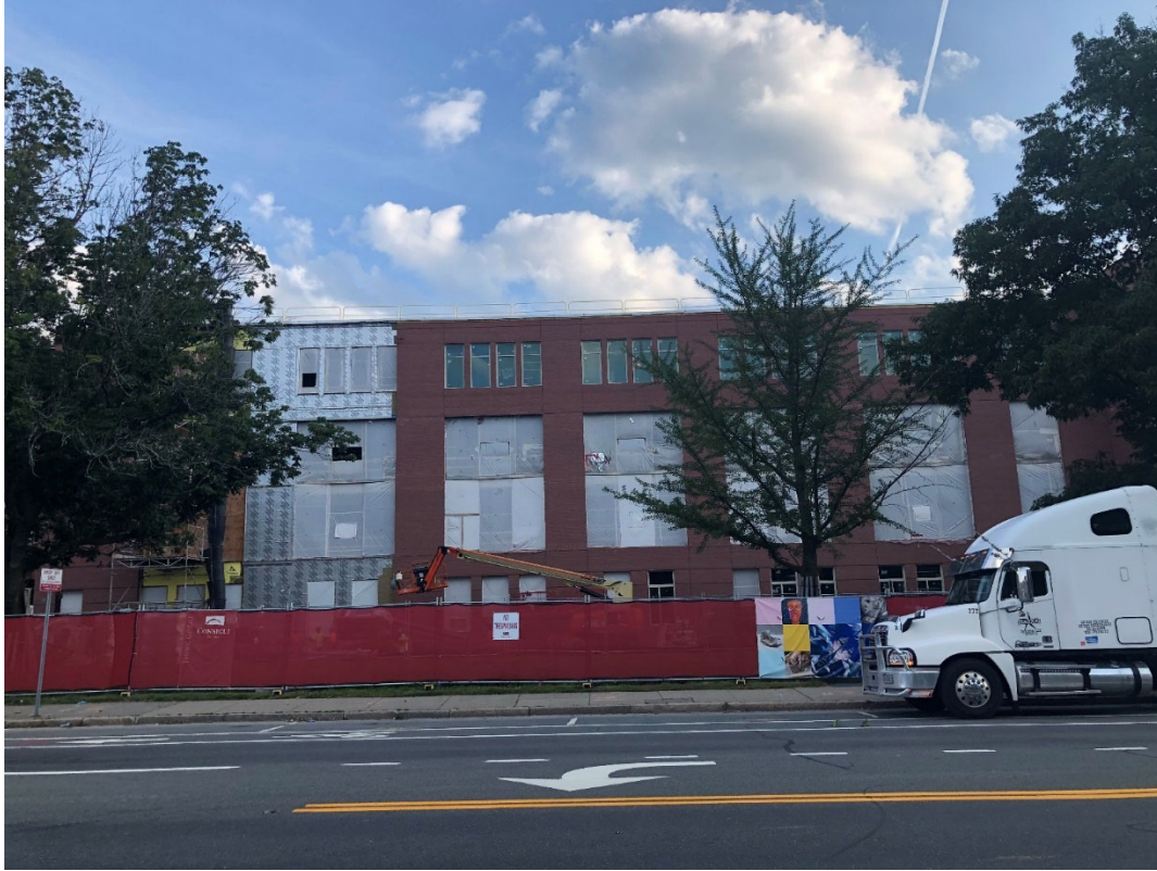
Photograph 5: Building D South Elevation (Mass Ave)