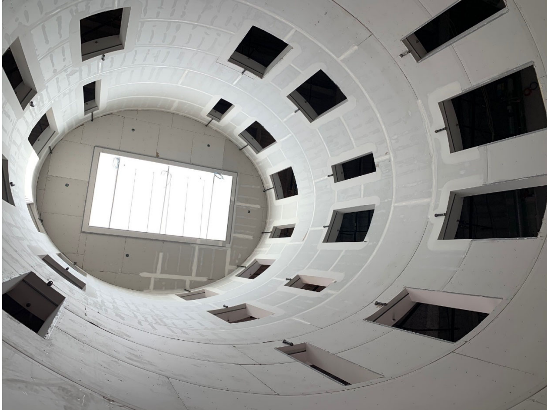
Photograph 5: Phase 1 STEAM wing light-well progress