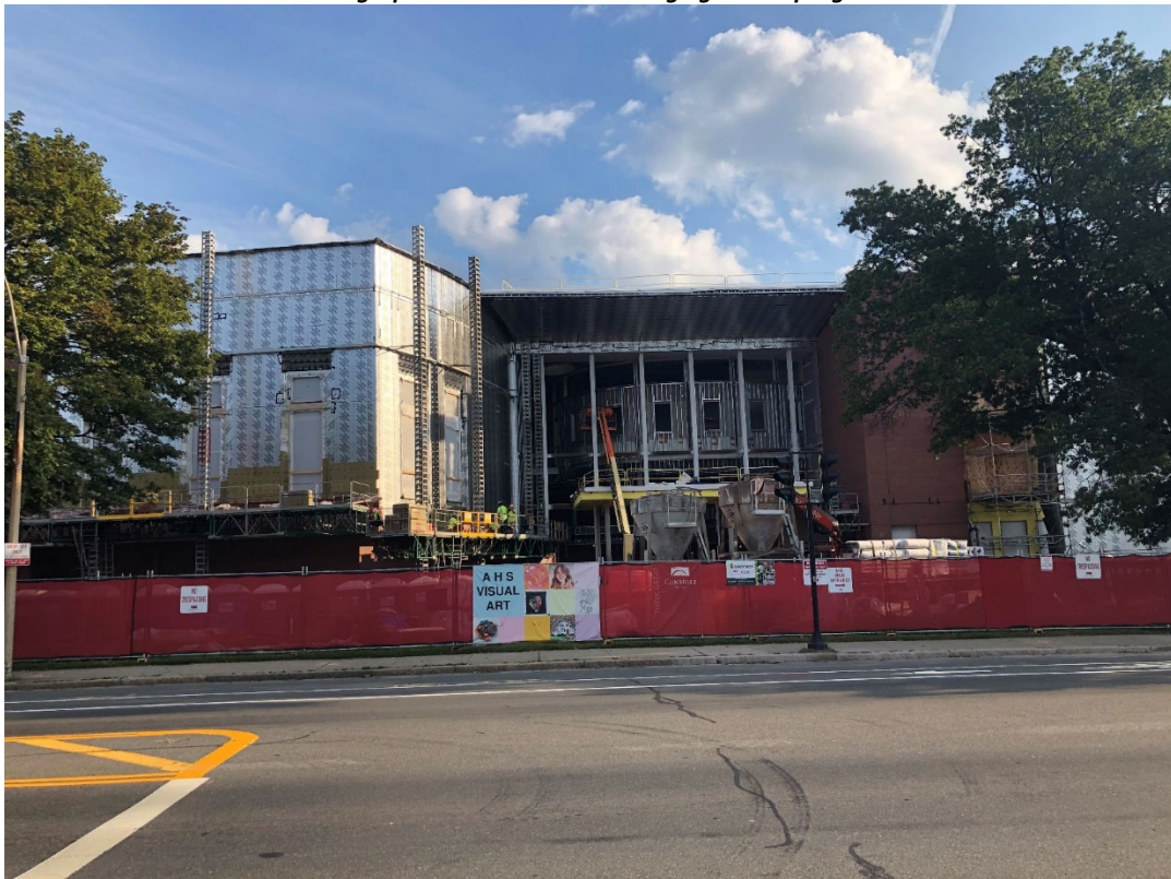
Photograph 4: Building D/E South Elevation (Mass Ave)