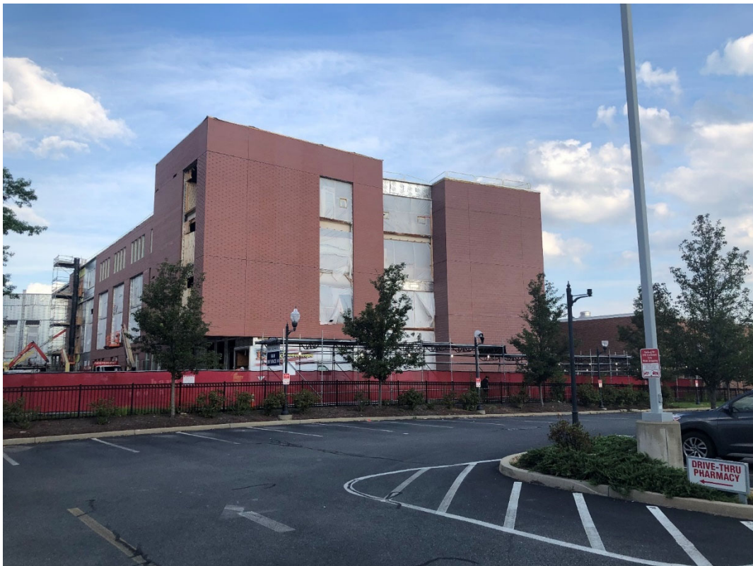
Photograph 6: Building D East Elevation