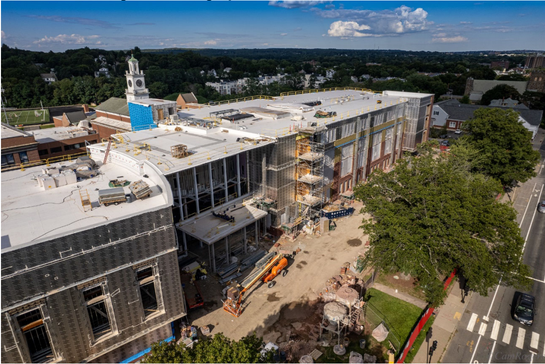
Photograph 1: Mass Ave Drone Progress Photo

Progress Photographs – Taken Week of 09/06/2021