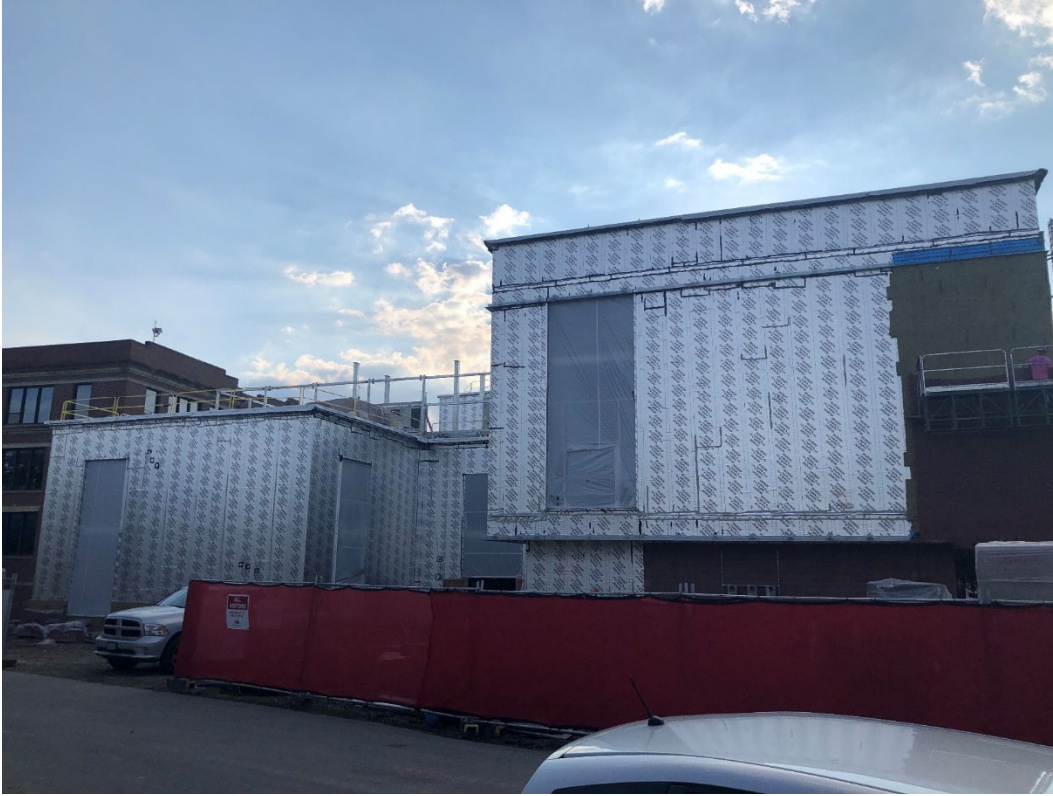
Photograph 7: Building E West Elevation (Schouler Court)