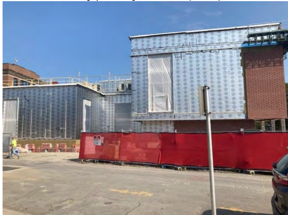
Photograph 4: Building E West Elevation (Schouler Court)