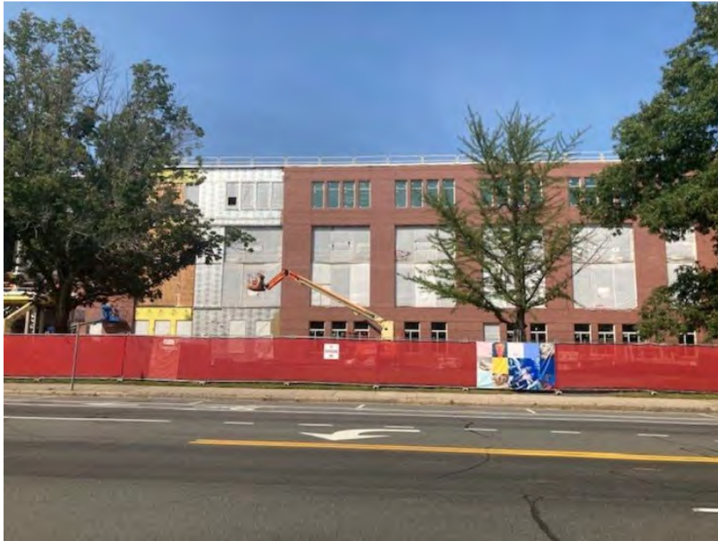
Photograph 3: Building D South Elevation (Mass Ave)