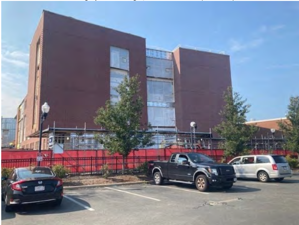
Photograph 2: Building D East Elevation