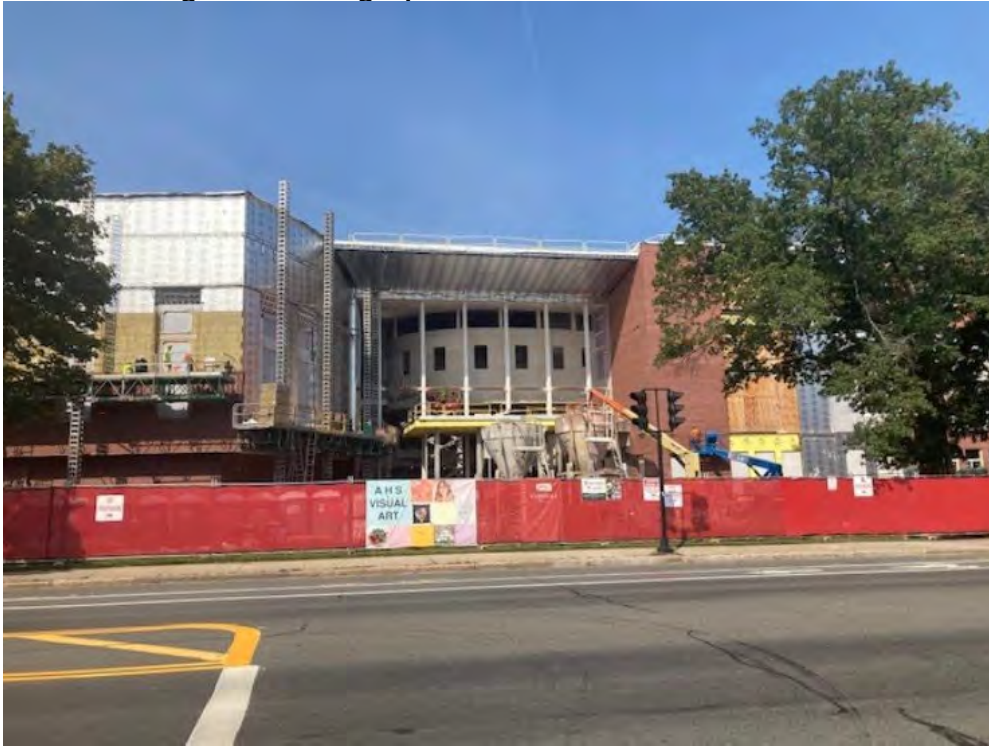
Photograph 1: Building D/E South Elevation (Mass Ave)