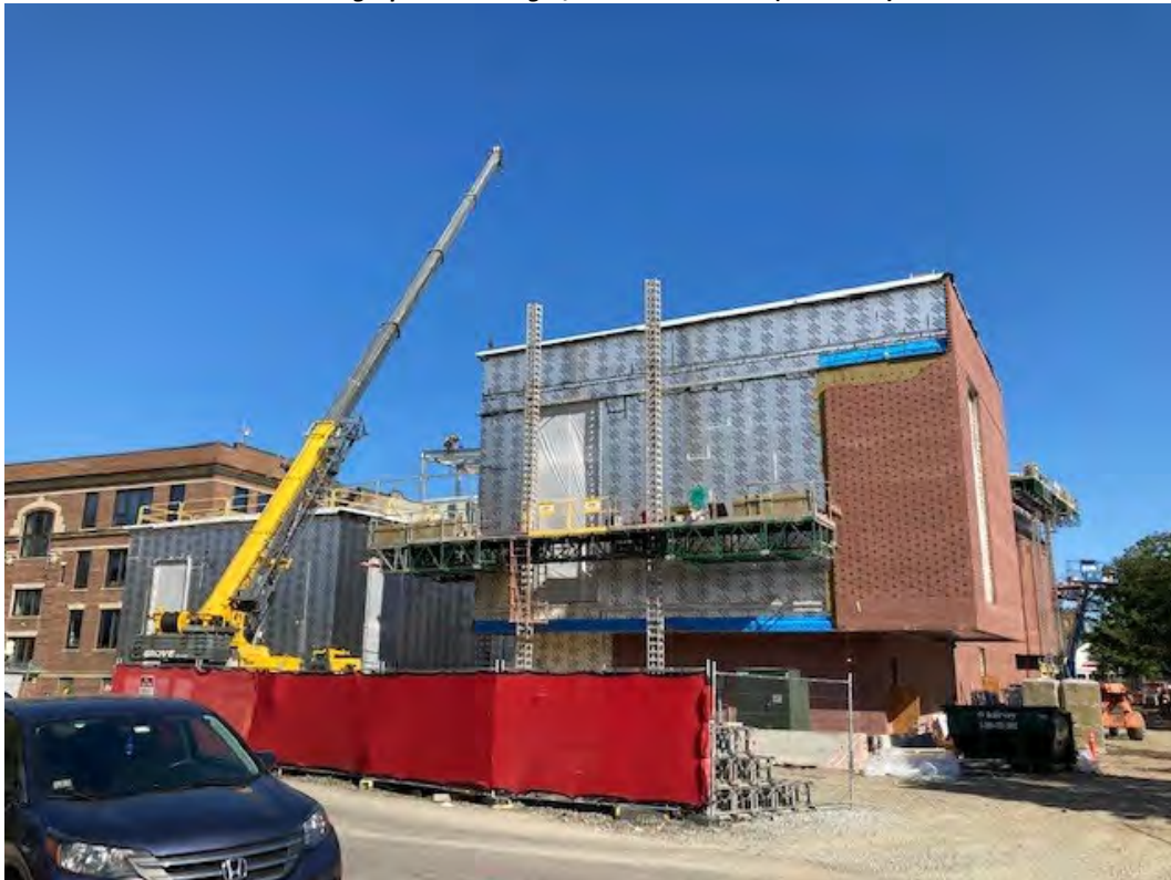
Photograph 3: Building E West Elevation (Schouler Court)