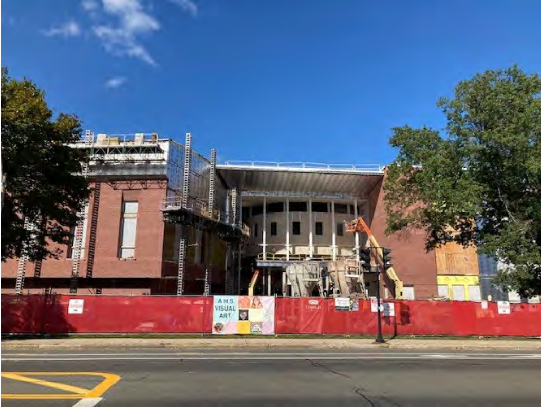
Photograph 1: Building D/E South Elevation (Mass Ave)