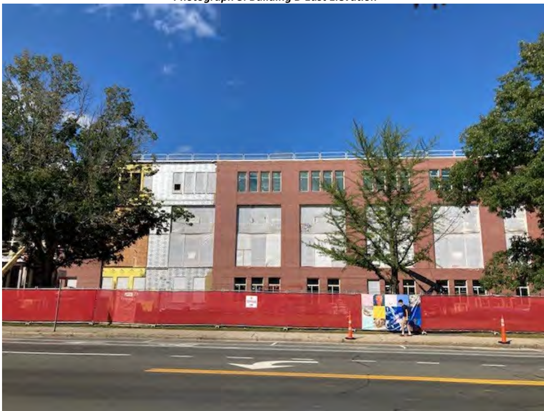
Photograph 4: Building D South Elevation (Mass Ave)