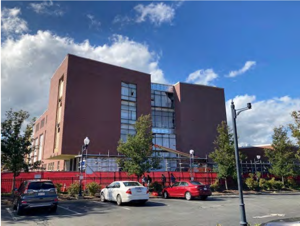
Photograph 3: Building D East Elevation