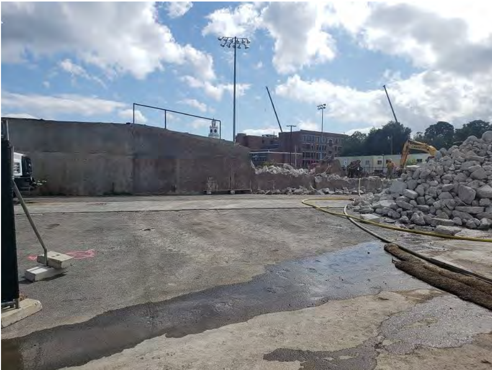
Wall Partially Removed (Taken 9/21/21)