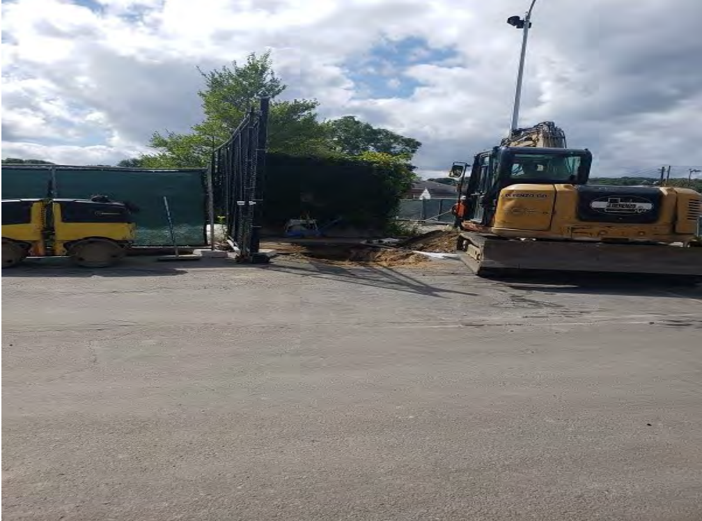
Test Pit in Progress (Taken 9/21/21)