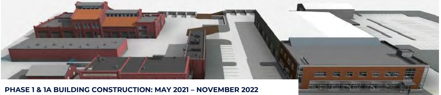
PHASE 1 & 1A BUILDING CONSTRUCTION: MAY 2021 – NOVEMBER 2022