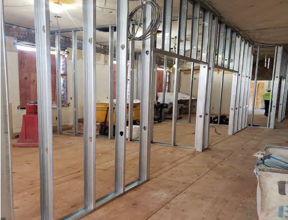
Building A Framing (Taken 9/14/21)