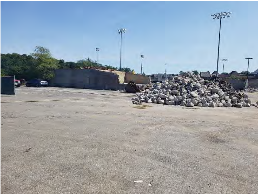
Site Crushed Concrete (Taken 9/14/21)