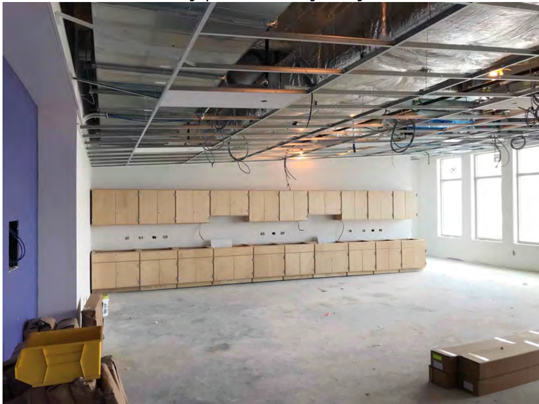
Photograph 2: Typical Science Classroom Progress