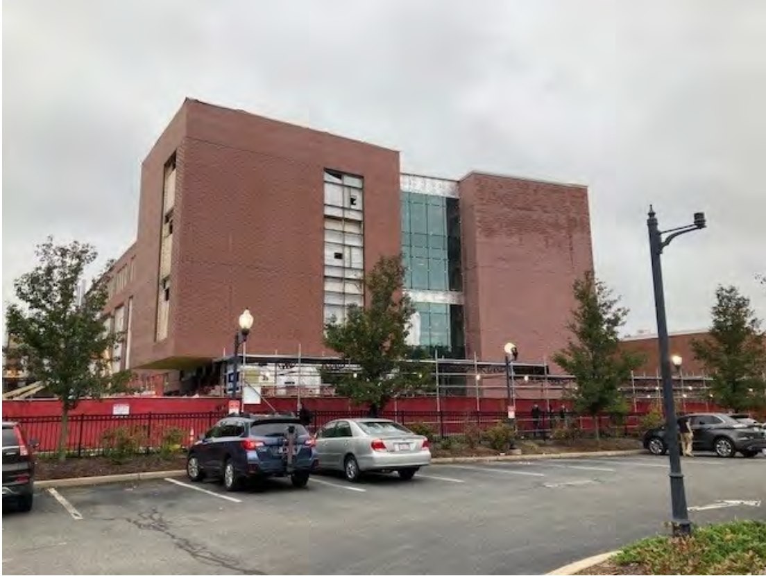
Photograph 5: Building D East Elevation