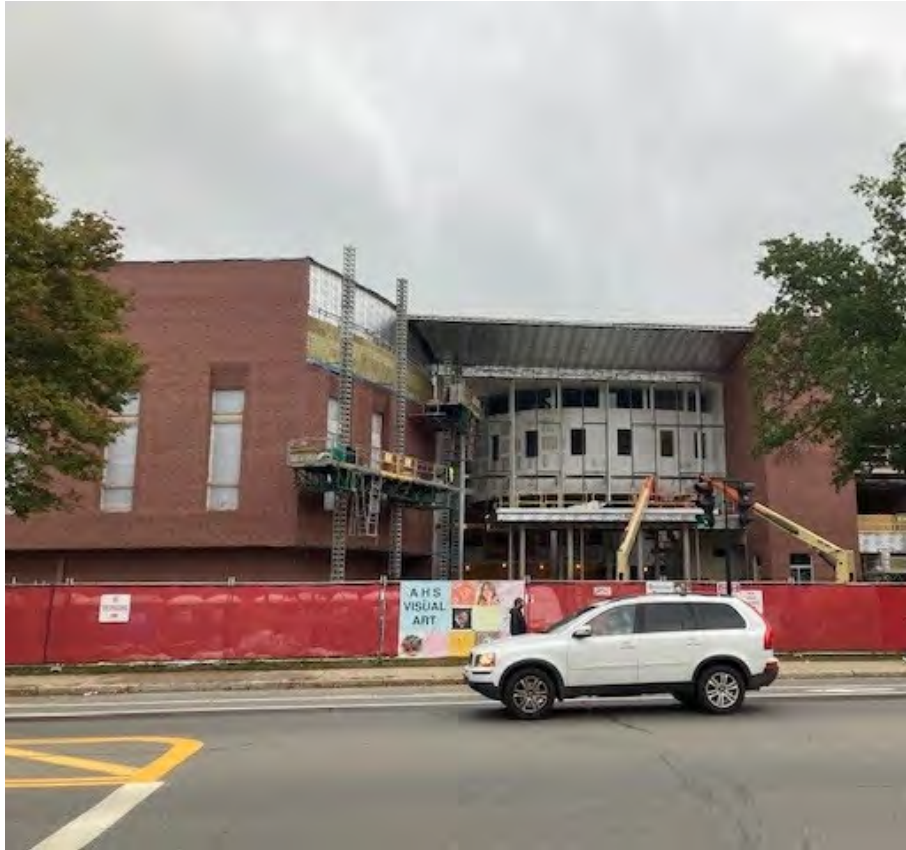
Photograph 3: Building D/E South Elevation (Mass Ave)