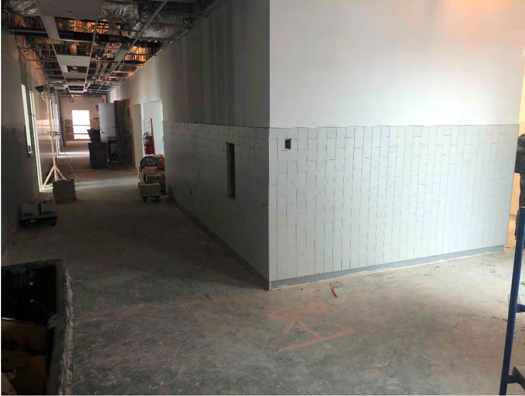
Photograph 1: Classroom Wing Tile Progress