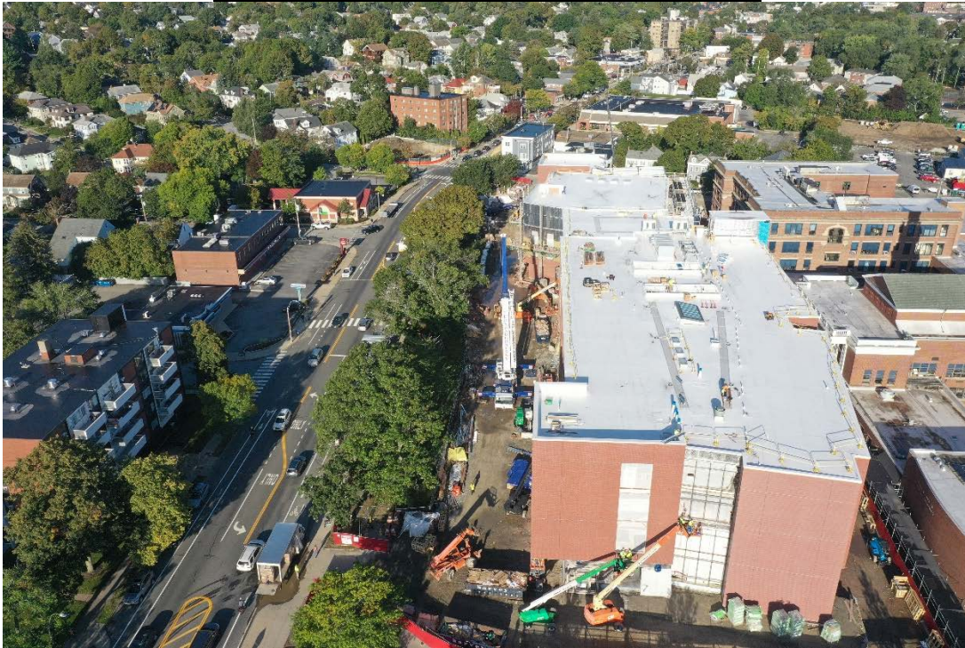
Photograph 1: Drone Photo (East Elevation)