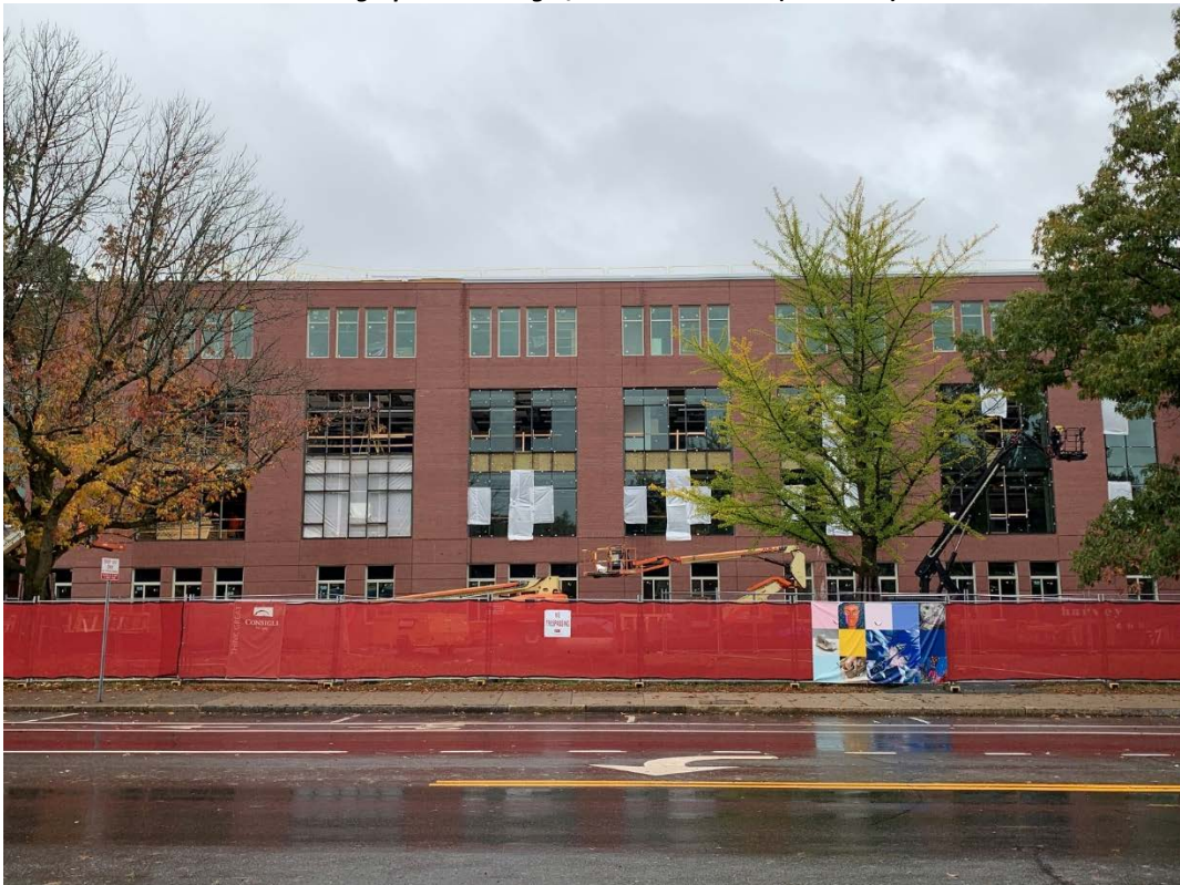
Photograph 4: Building D South Elevation (Mass Ave)