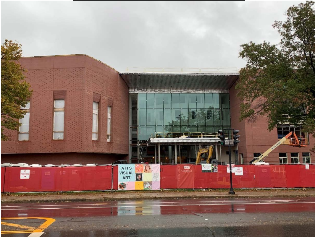
Photograph 3: Building D/E South Elevation (Mass Ave)