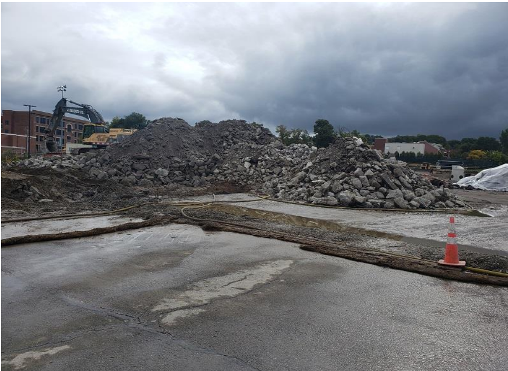
Site Concrete Crushing (Taken 10/15/21)