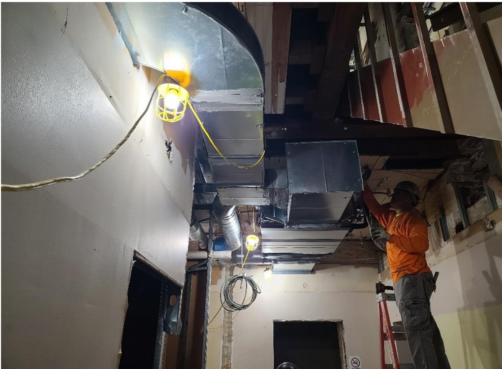
Building A MEP/FP Rough in Progress (Taken 10/5/21)