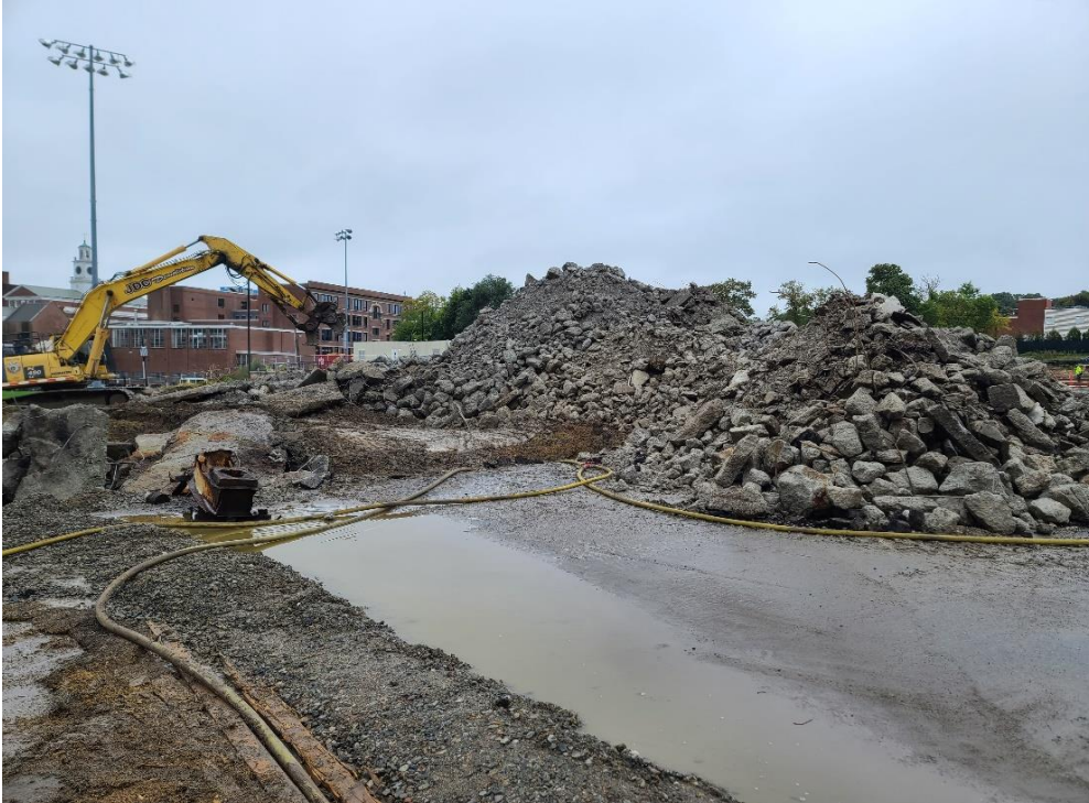
Concrete Site Processing in Progress (Taken 10/5/21)