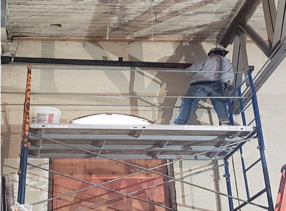
Building A Rain Leader Install (Taken 10/28/21)