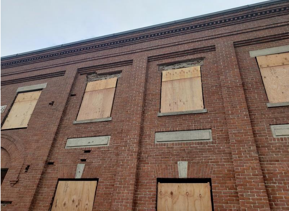
Building A Brick Repair (Taken 10/15/21)