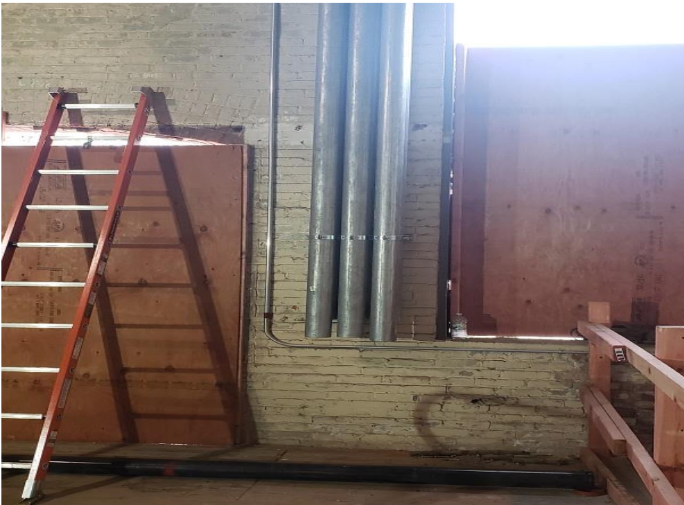
Building A Electrical Going to Lower Level (Taken 10/28/21)