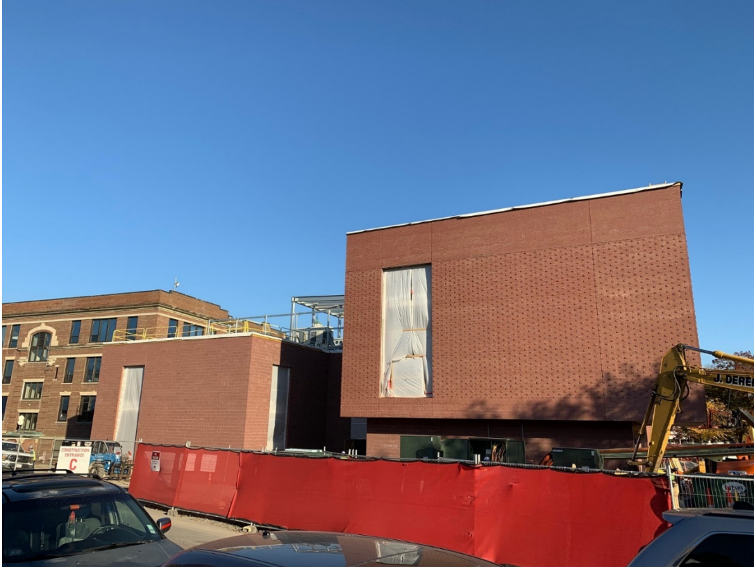
Photograph 5: Building E West Elevation (Schouler Court)