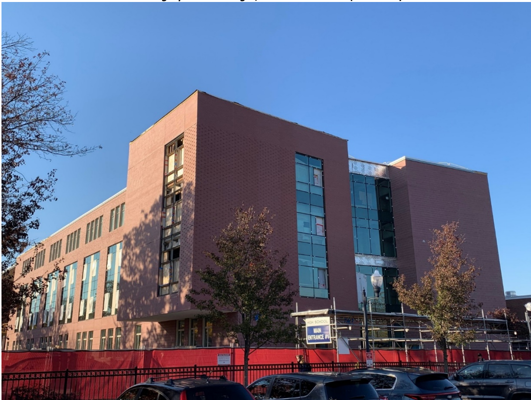
Photograph 4: Building D East Elevation