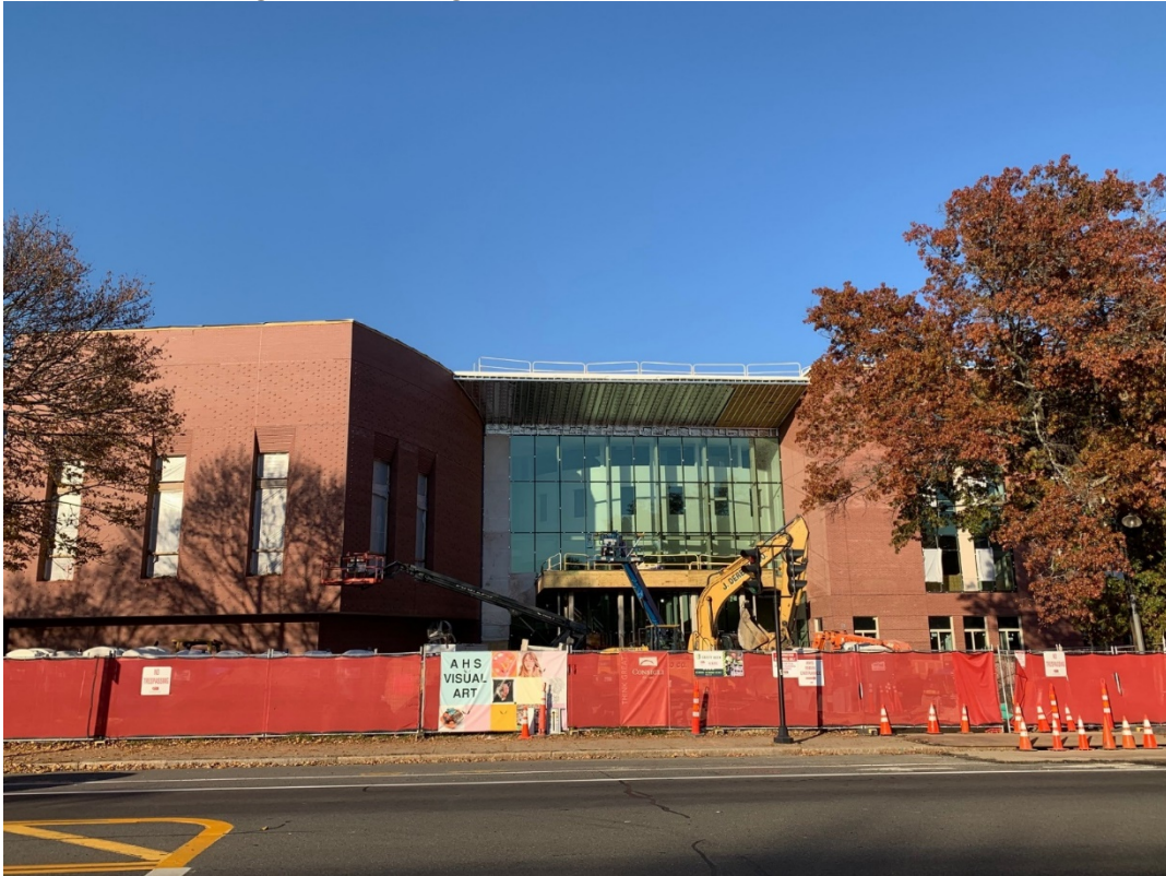
Photograph 3: Building D/E South Elevation (Mass Ave)