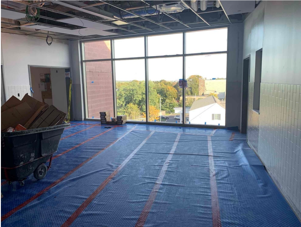
Photograph 1: Corridor breakout space progress