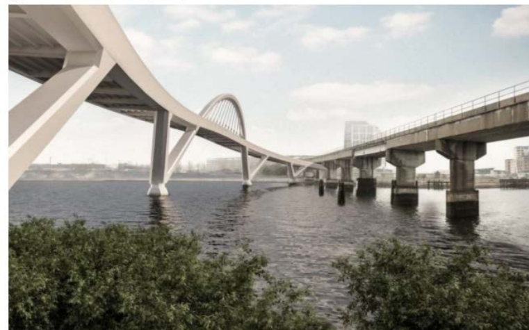
A rendering of a proposed Mystic River bike and pedestrian bridge, which could connect the Northern Strand multi-use path in the City of Everett to the Assembly Orange Line Station in Somerville. Rendering by AECOM, courtesy of the Massachusetts Department of Conservation and Recreation.