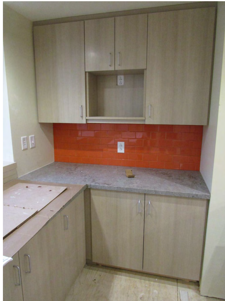
Café casework at kitchenette with tile backsplash