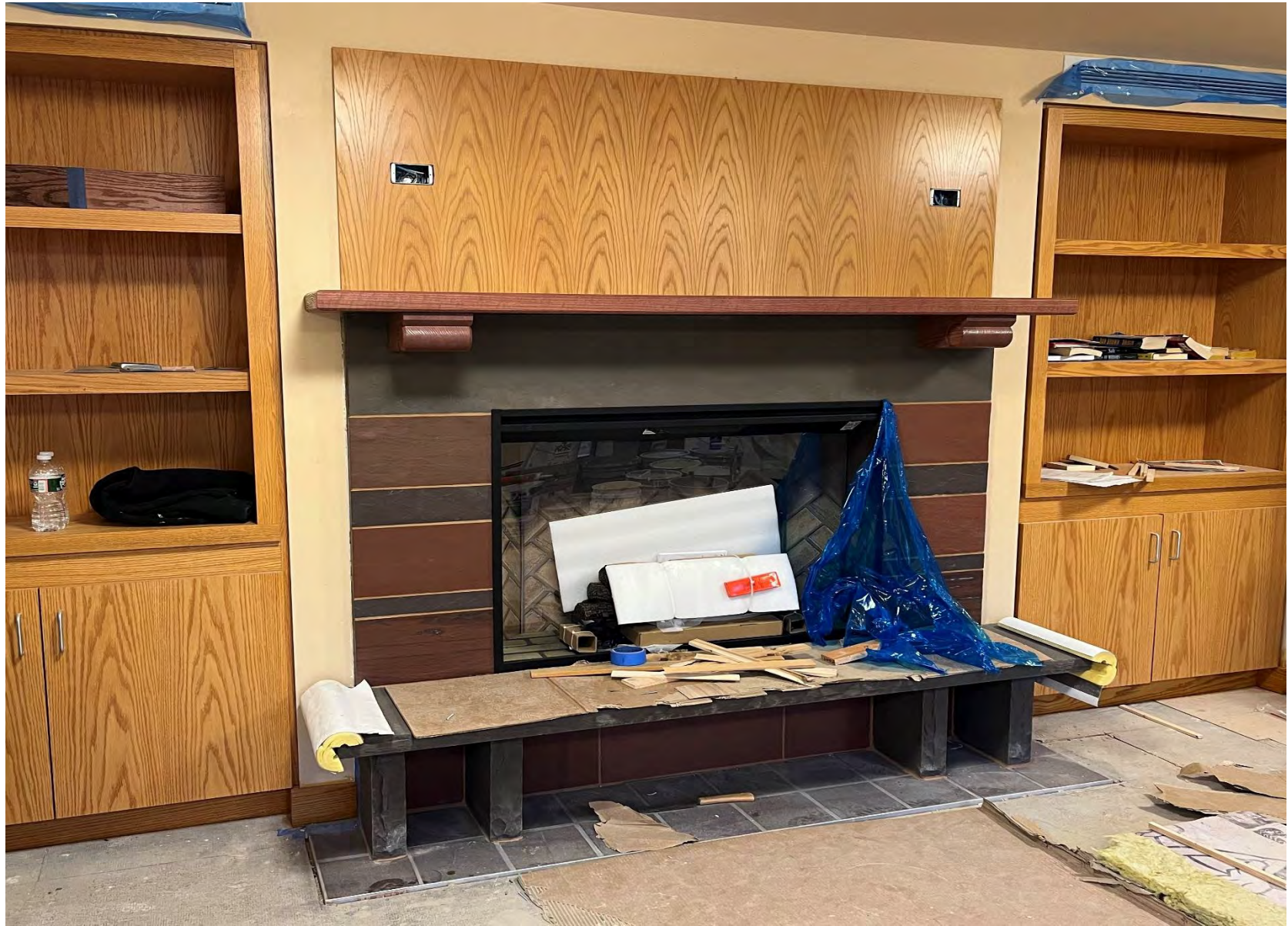
Electric fireplace in Library