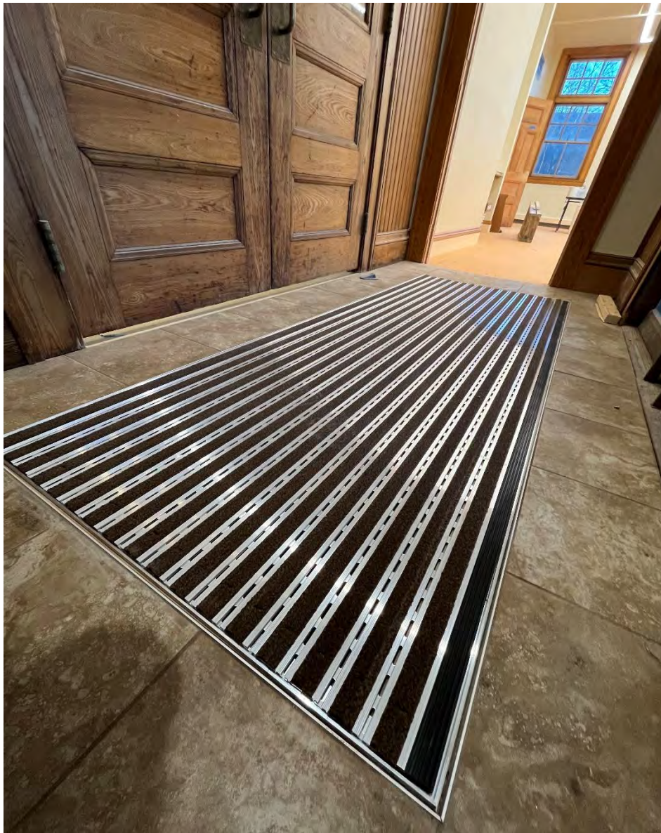
Walk off mat in west entry vestibule