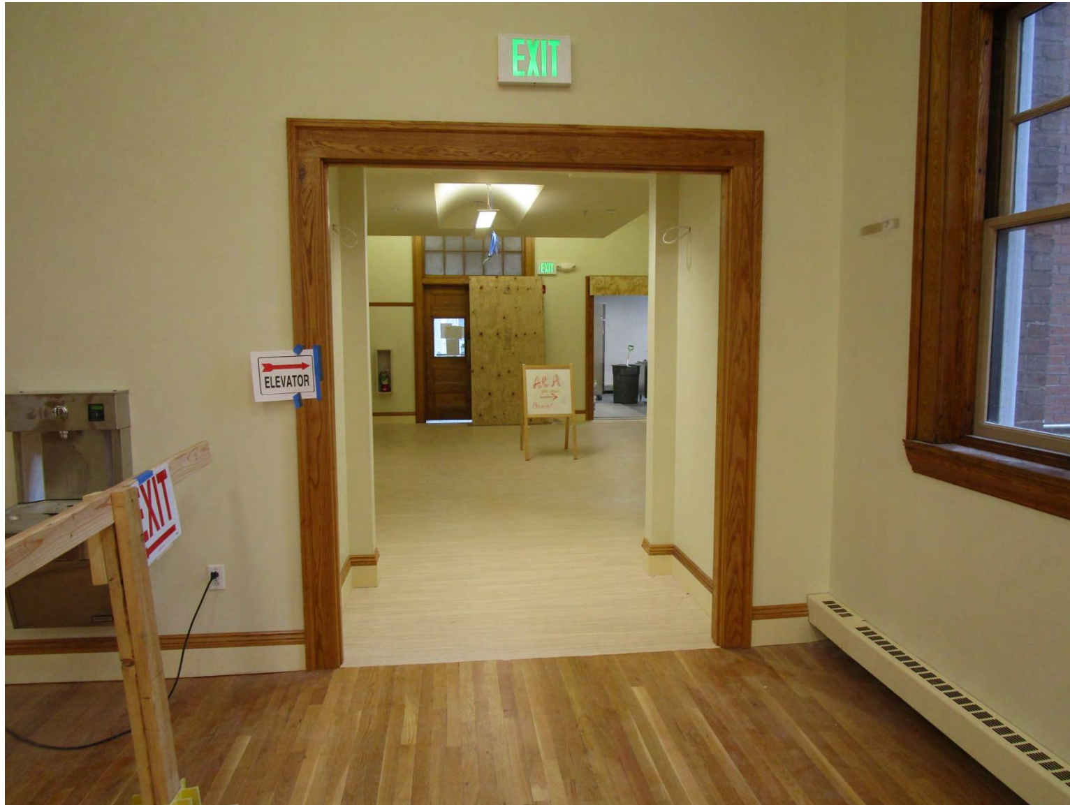
Entry between west lobby and gallery