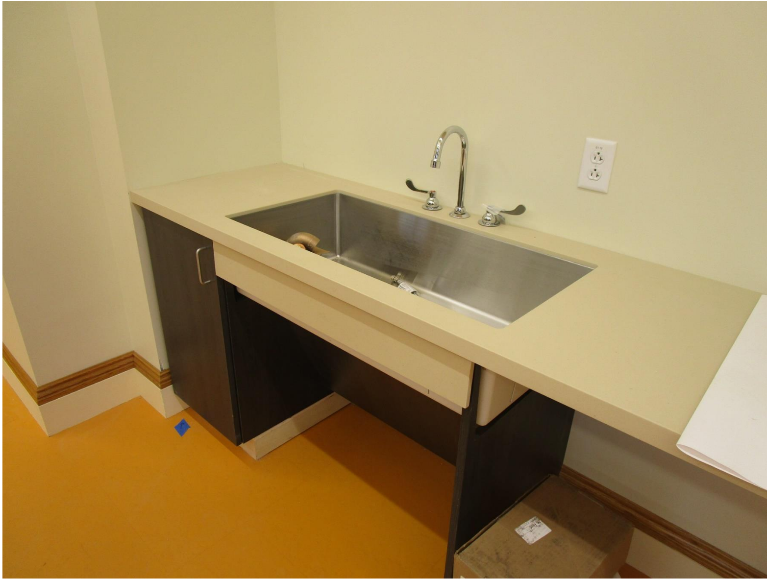
Casework and sink in Art Room