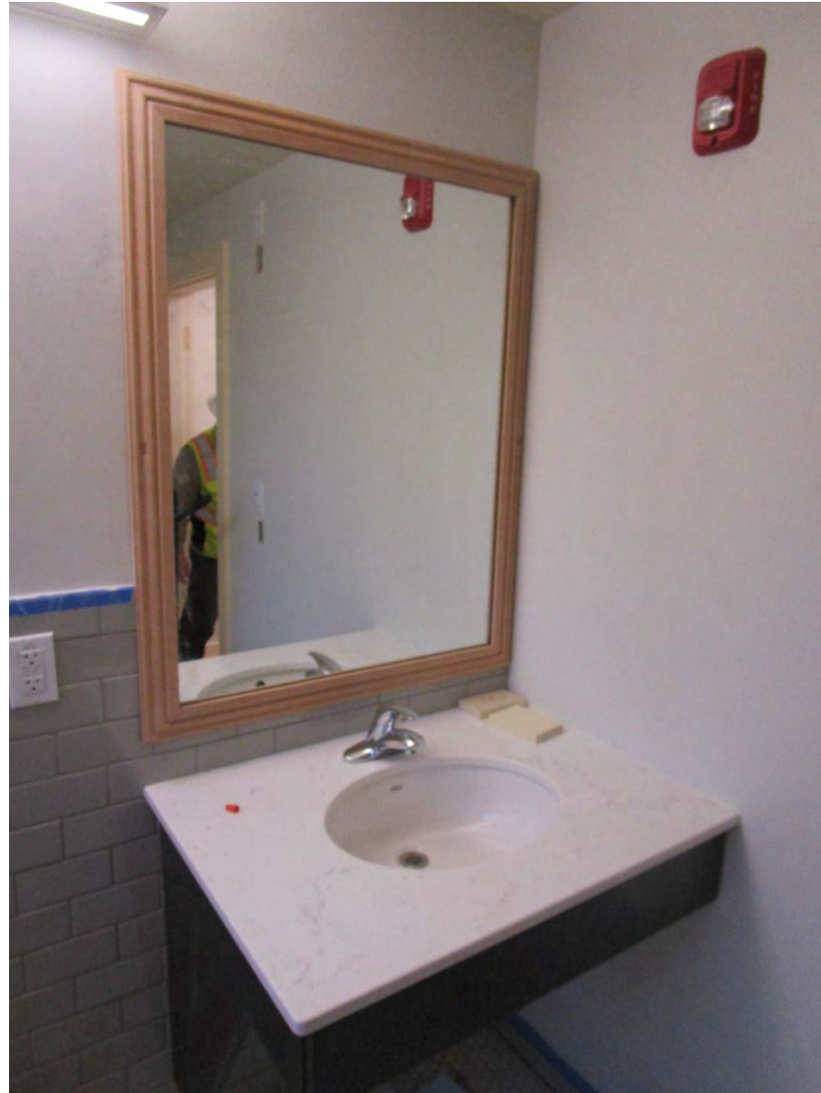
Oak framed mirror in toilet room