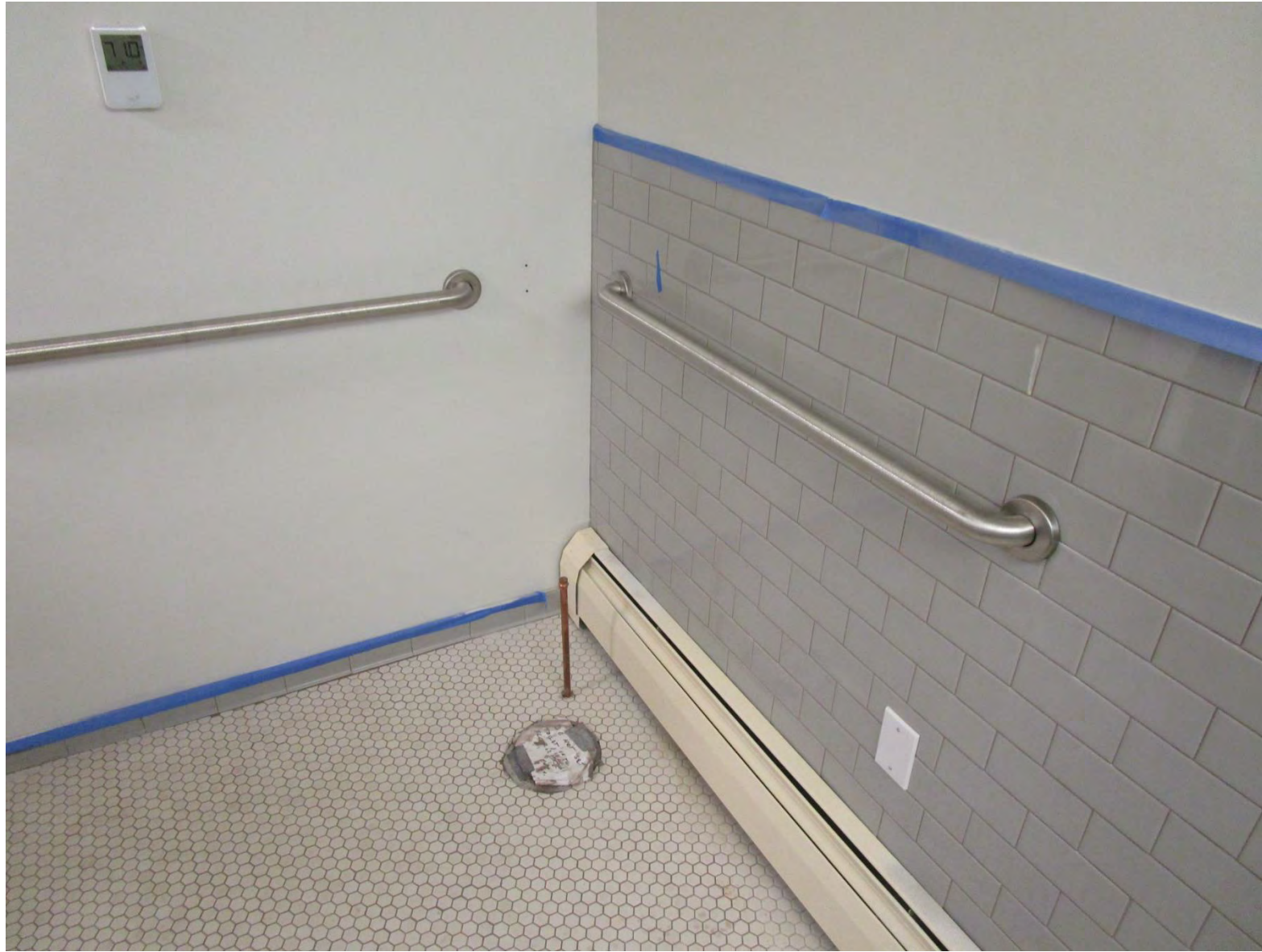
Grab bar installation in toilet room