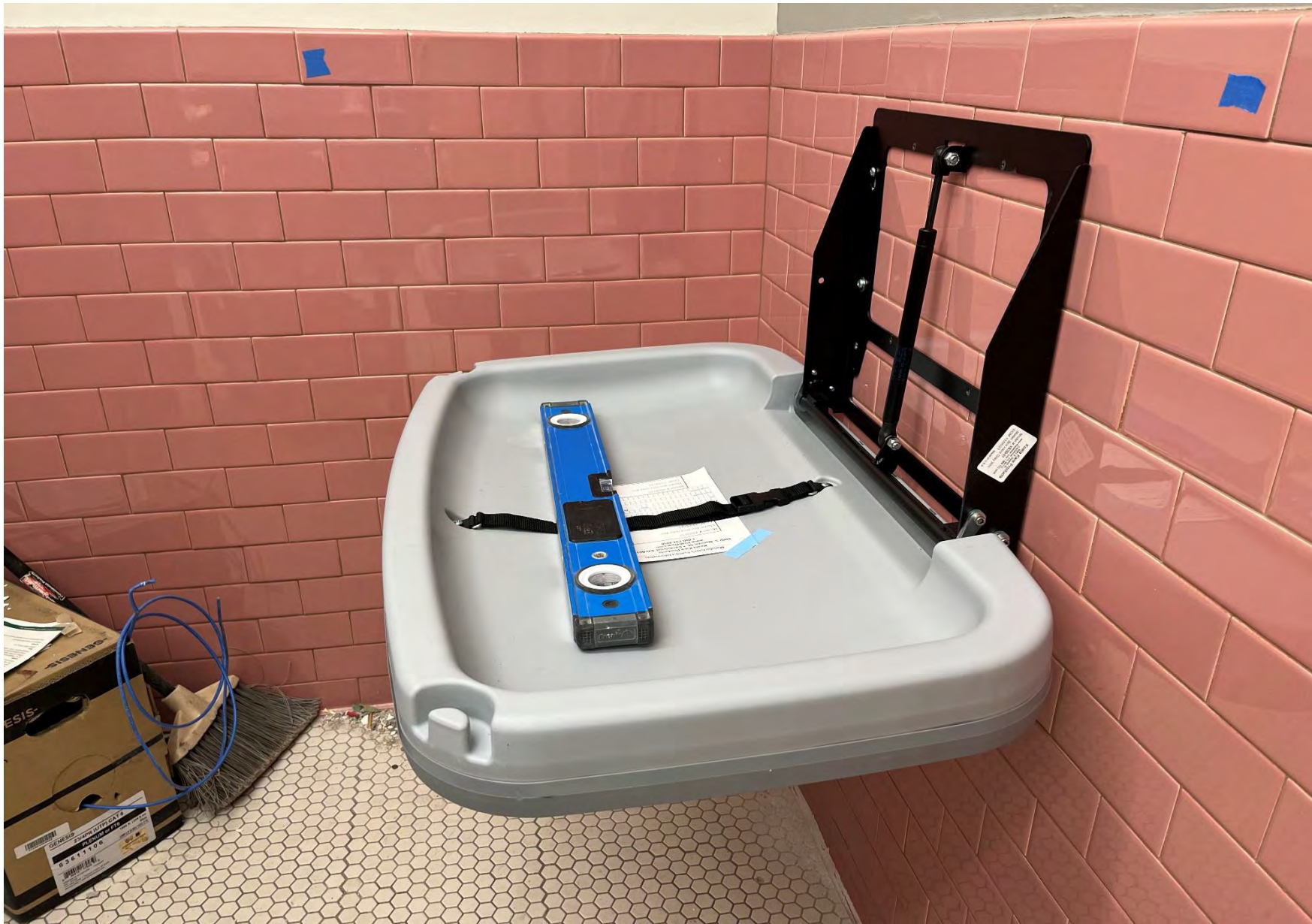
Baby changing table in Toilet Room 114