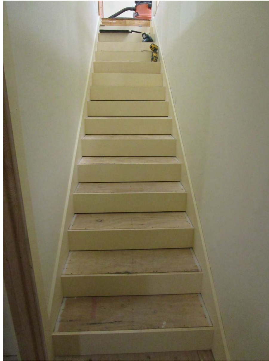
Stair #3 from ground floor to Main Hall