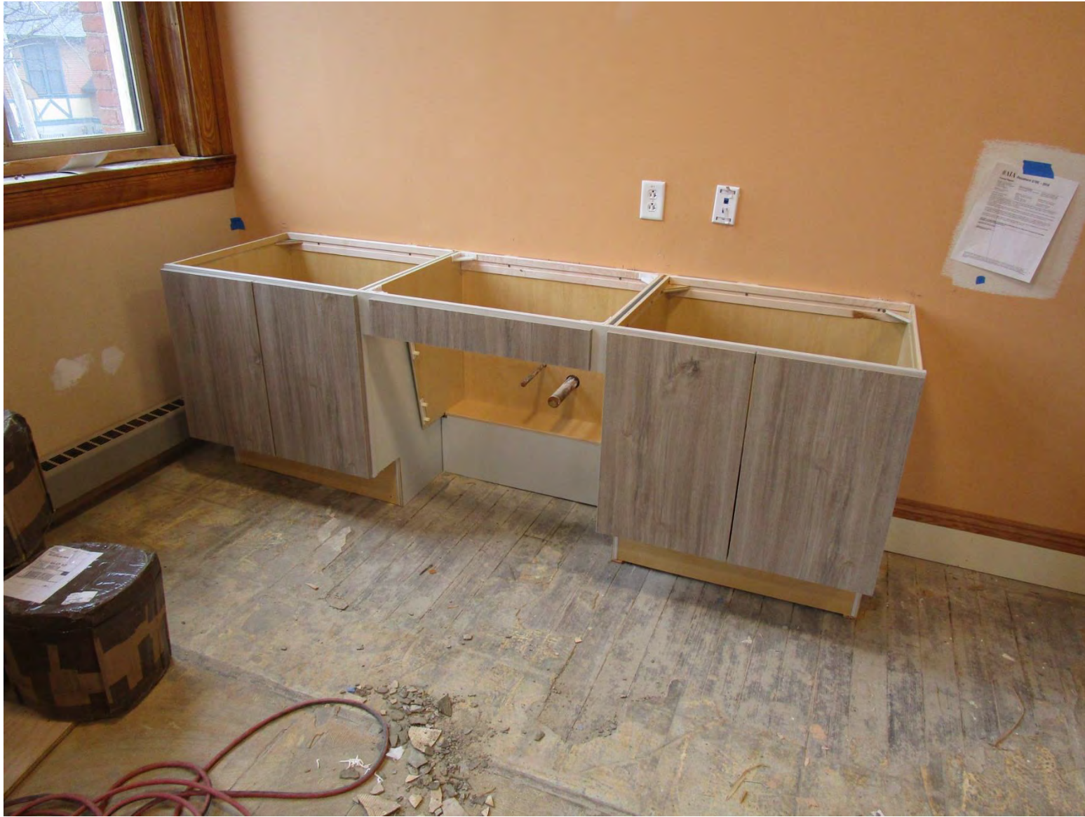
Owner furnished casework in Drop-in room 130