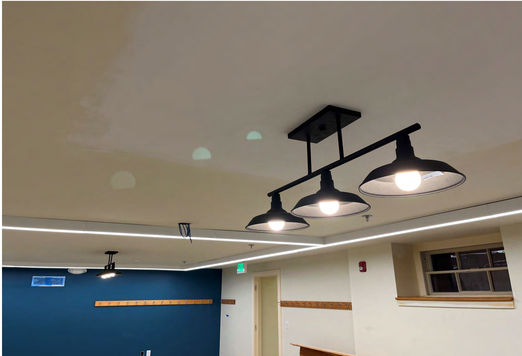
Pool table light fixtures