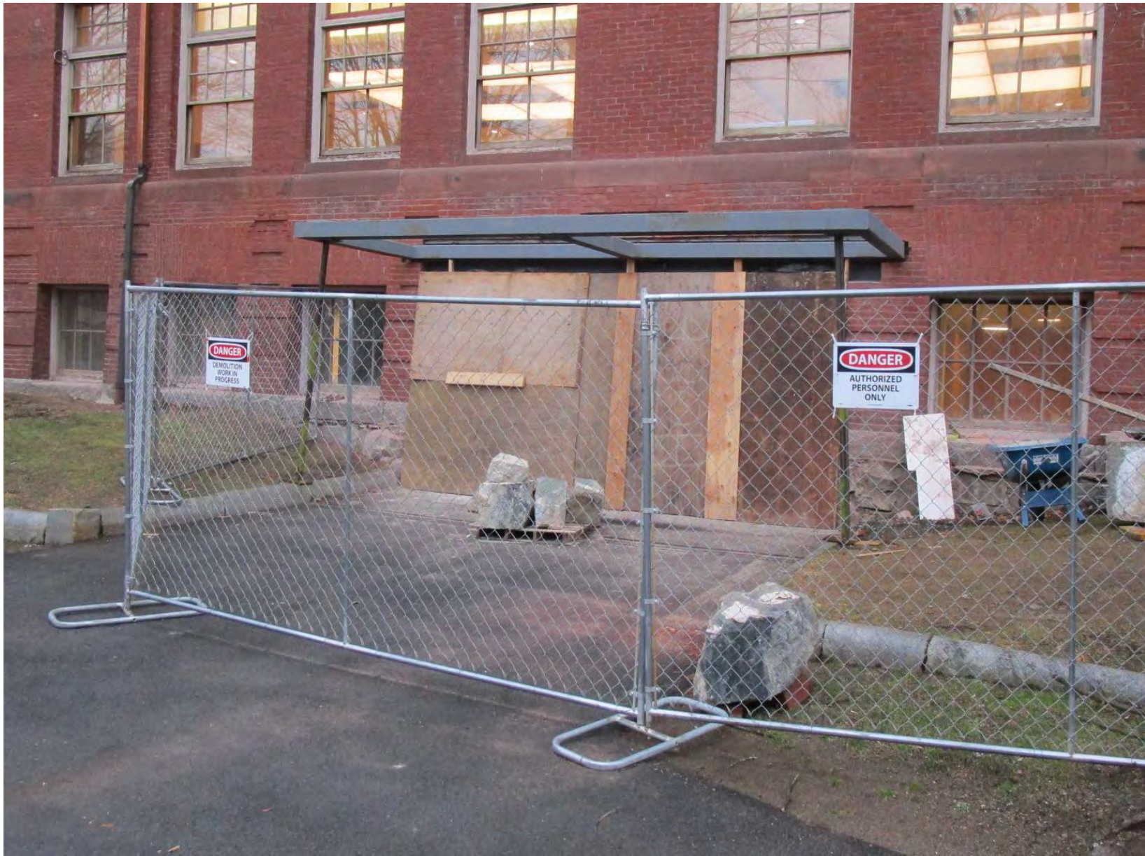
South entry canopy steel