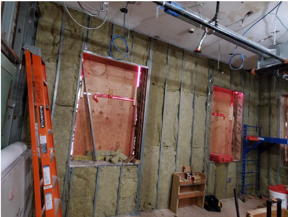
Photo # 4 – Building A Framing and Insulation in Progress (12/15/2021).