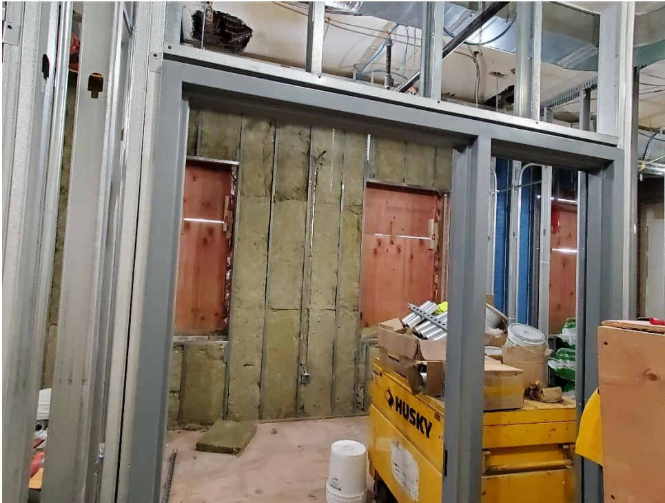
Photo # 3 – Building A Framing and Insulation in Progress (12/15/2021).