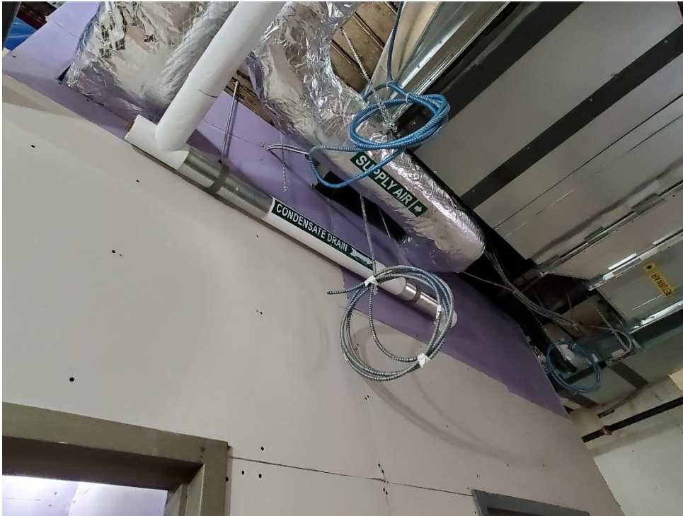
Photo #5 – HVAC Ductwork, Piping and GWB in Progress (12/15/2021).