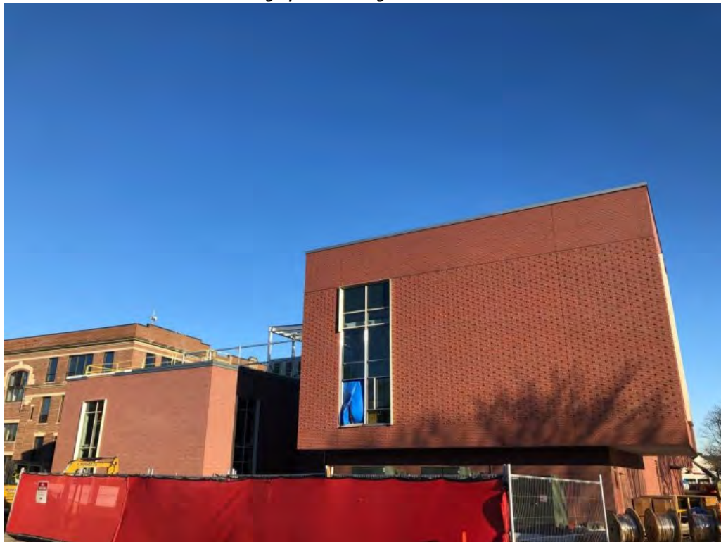
Photograph 6: Building E West Elevation