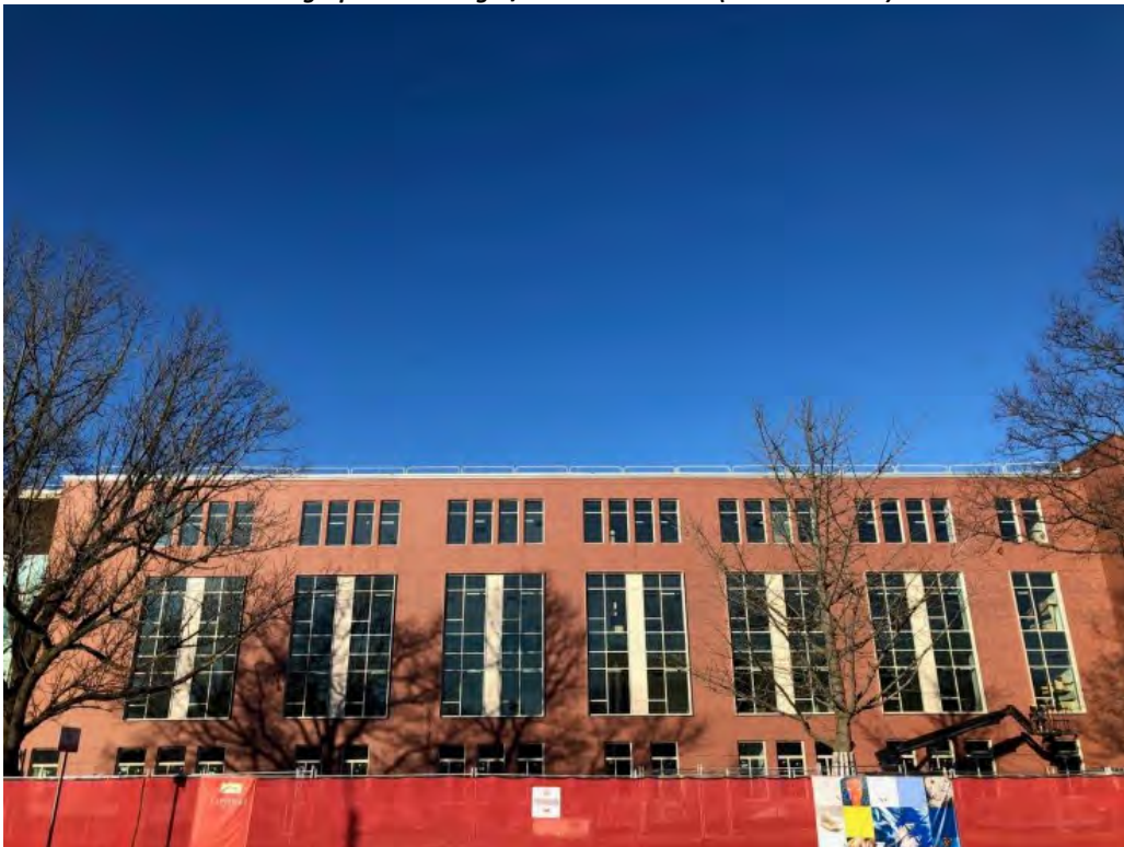
Photograph 4: Building D South Elevation