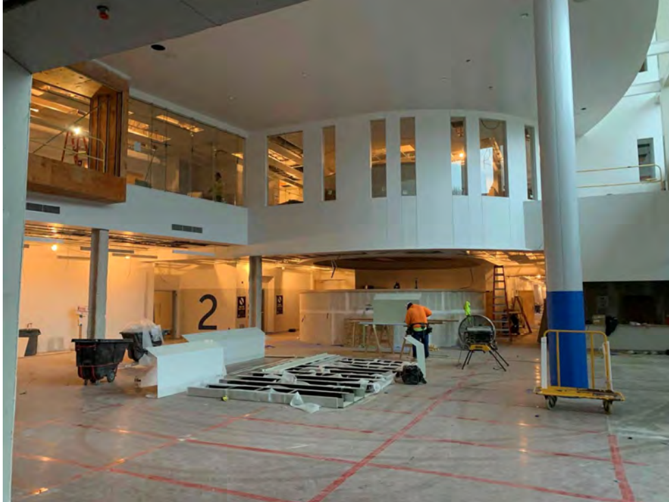
Photograph 1: Mass Ave Lobby Progress