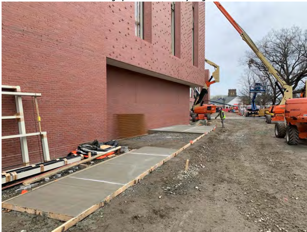
Photograph 2: Exterior Walkway Paving