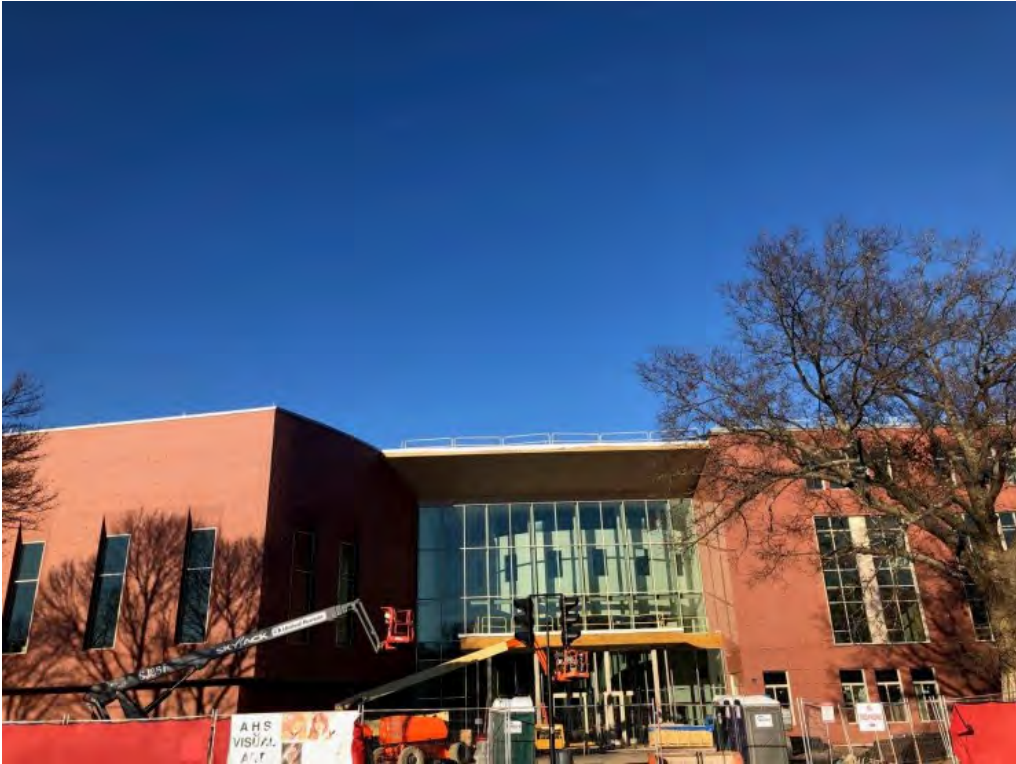
Photograph 3: Building D/E South Elevation (Main Entrance)