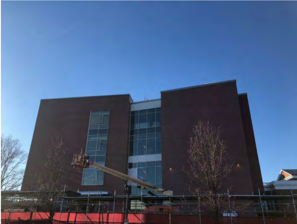
Photograph 5: Building D East Elevation