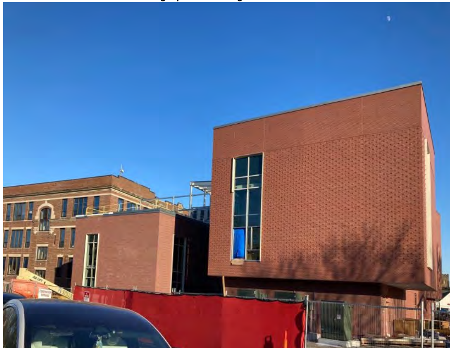
Photograph 6: Building E West Elevation (Schouler Court)