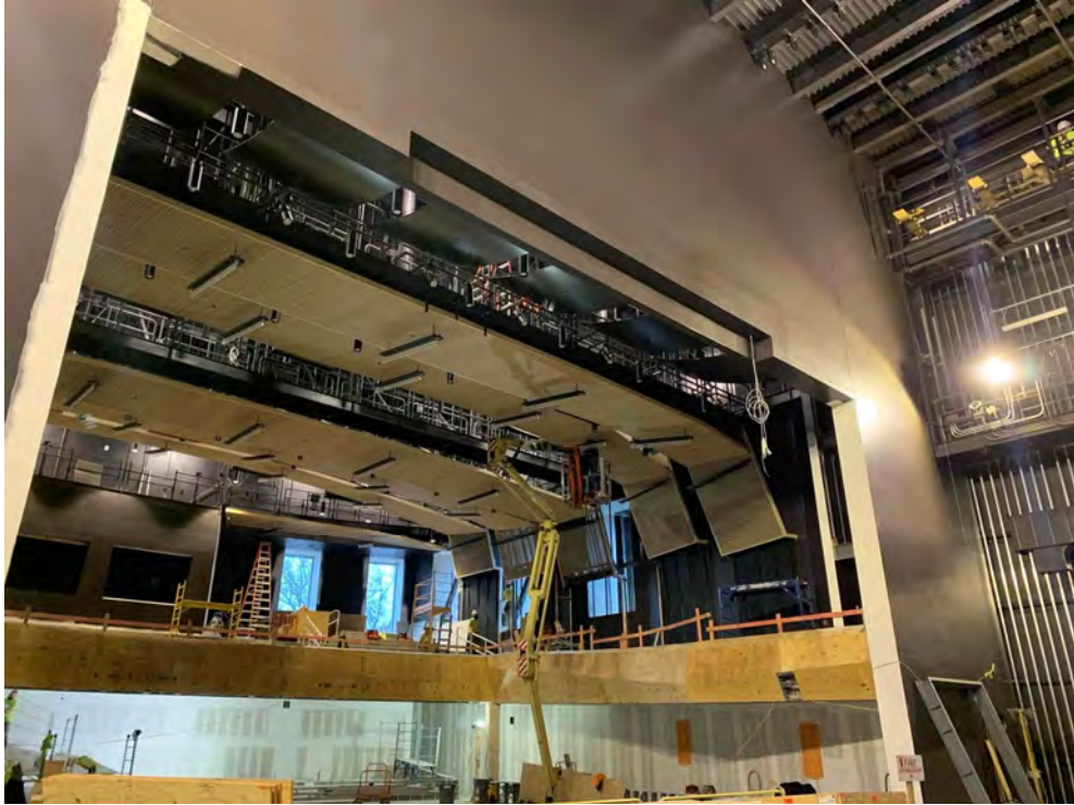
Photograph 1: Auditorium Progress (view from stage)