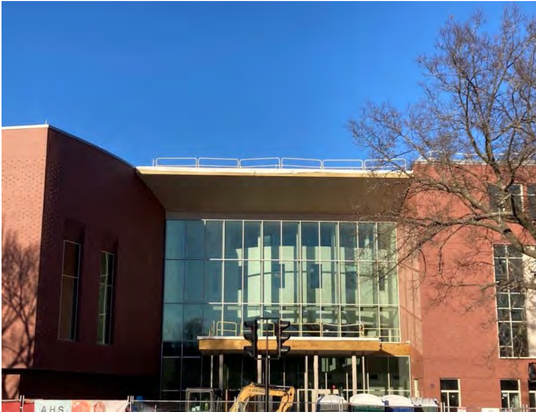
Photograph 3: Building D/E South Elevation (Mass Ave)