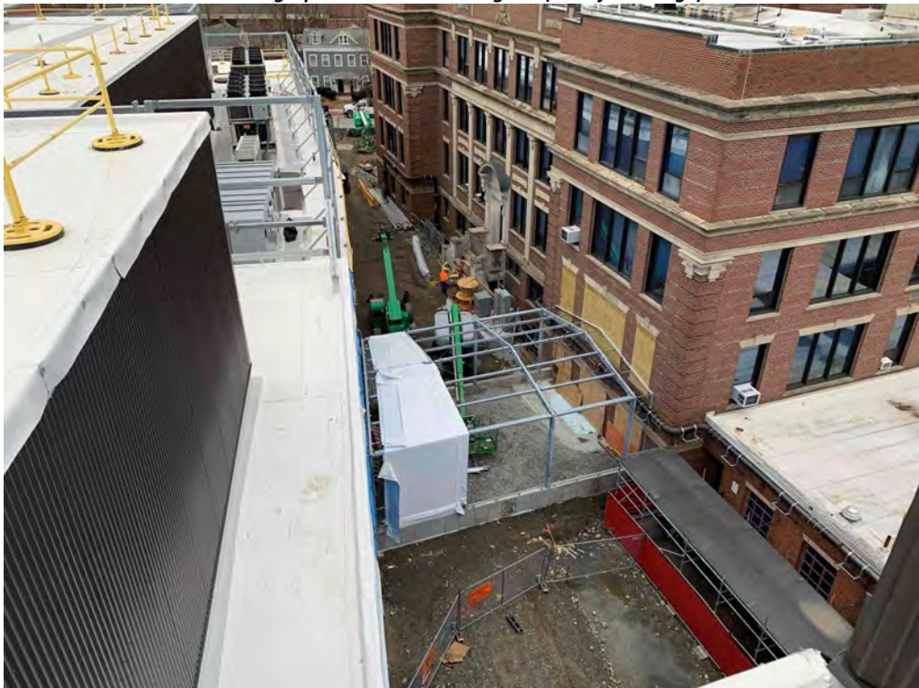
Photograph 2: Temporary Connector Progress