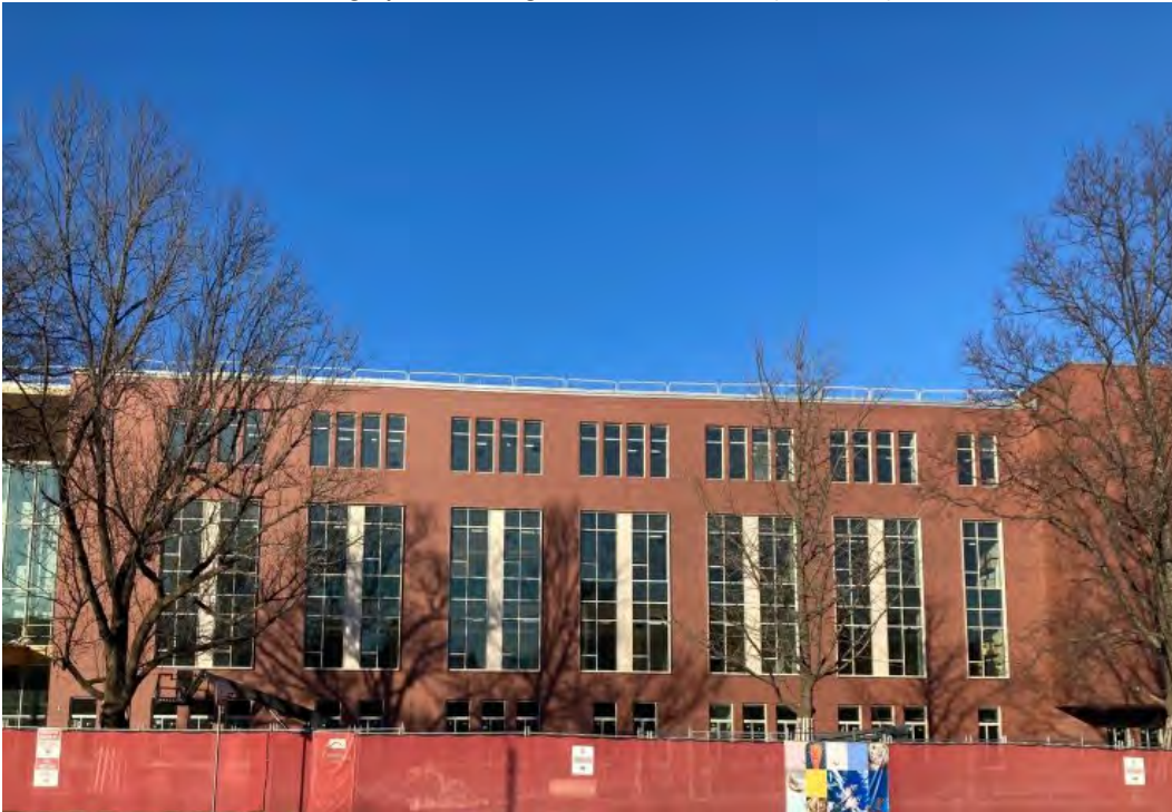
Photograph 4: Building D South Elevation (Mass Ave)