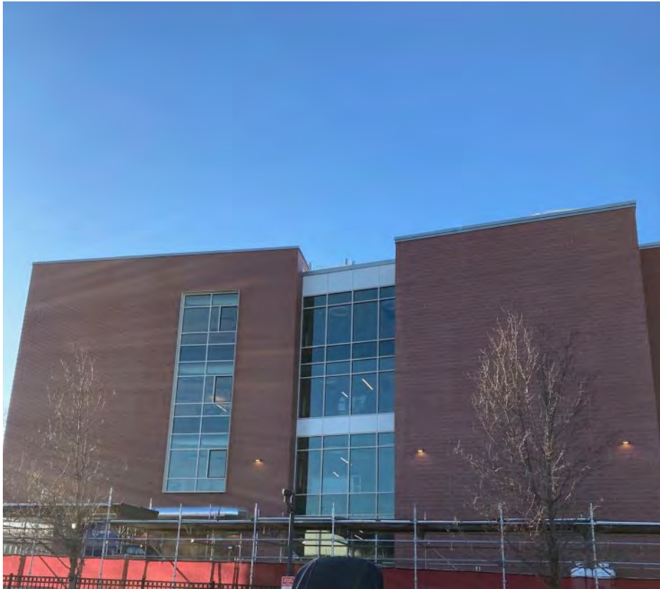
Photograph 5: Building D East Elevation