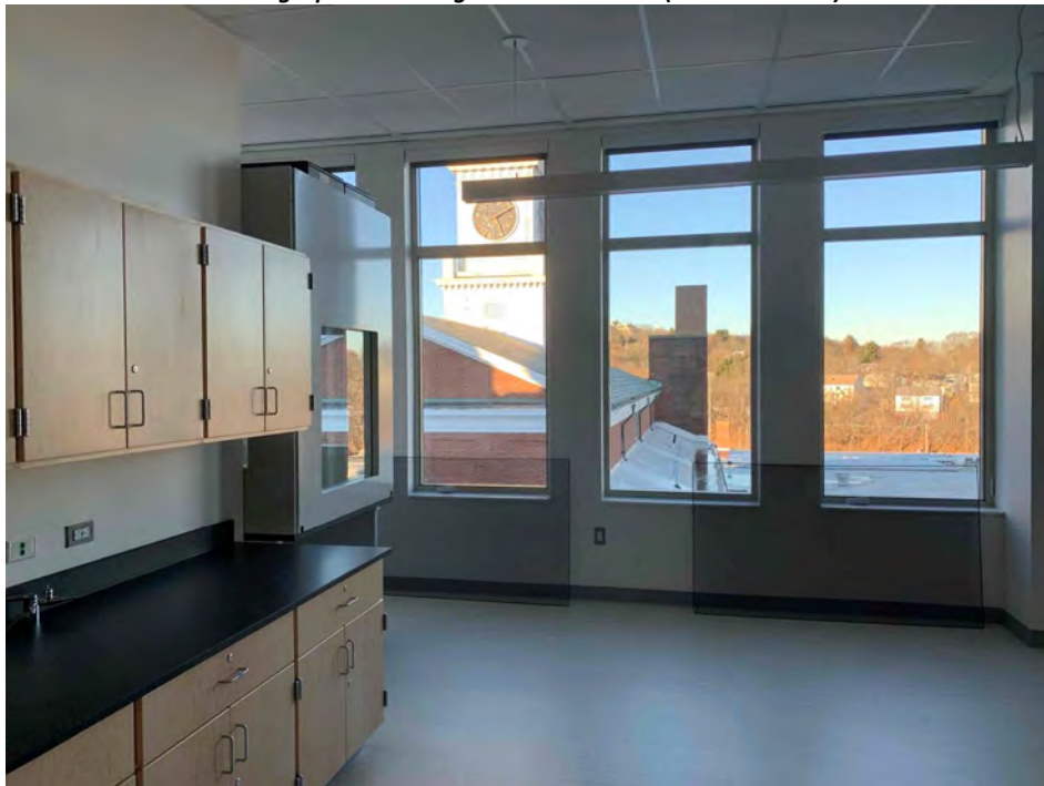
Photograph 4: Science Classroom Progress