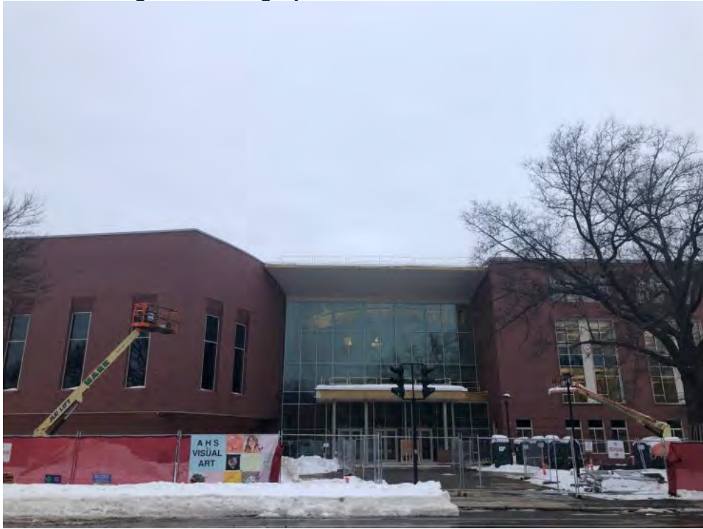
Photograph 1: Building D/E South Elevation (Mass Ave)