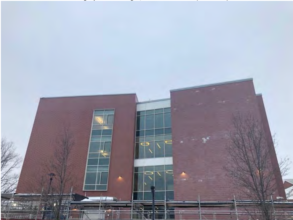
Photograph 2: Building D East Elevation