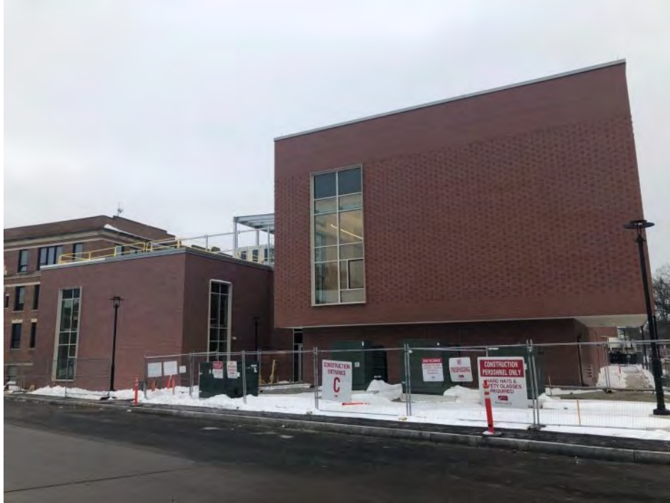
Photograph 3: Building E West Elevation (Schouler Court)