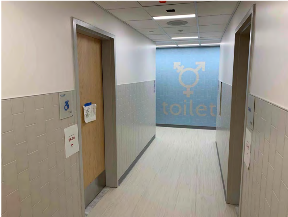
Photograph 4: Classroom Wing Bathroom Progress