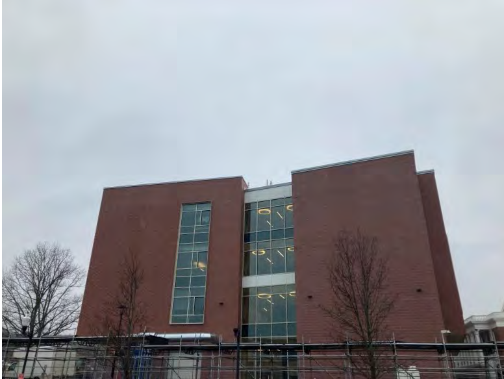
Photograph 5: Building D East Elevation