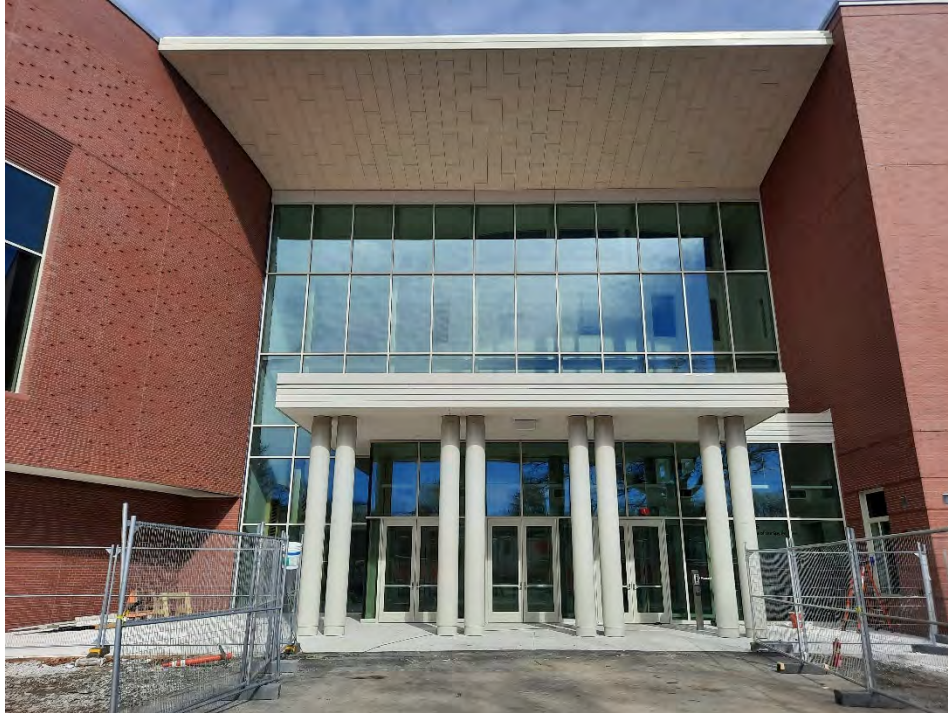
Photograph 1: Main Entrance #1