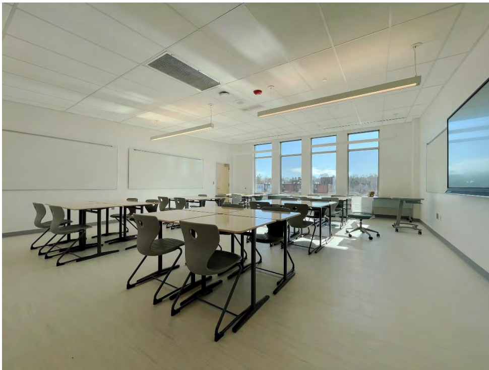
Photograph 2: Final Typical Classroom