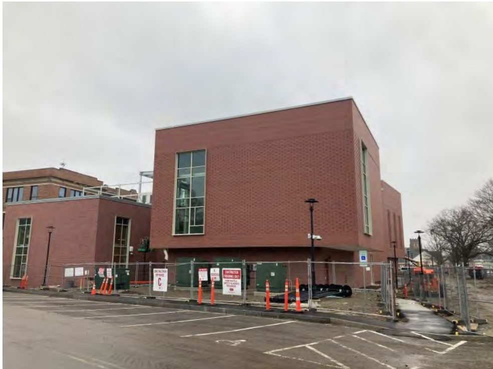
Photograph 6: Building E West Elevation (Schouler Court)