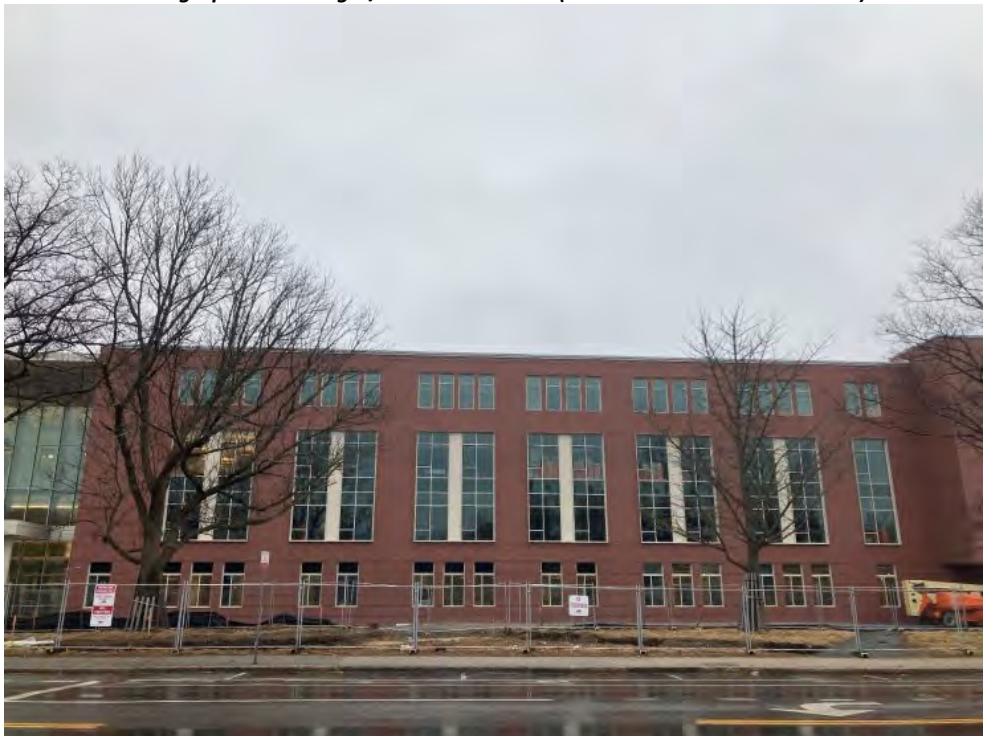
Photograph 4: Building D South Elevation (Mass Ave)