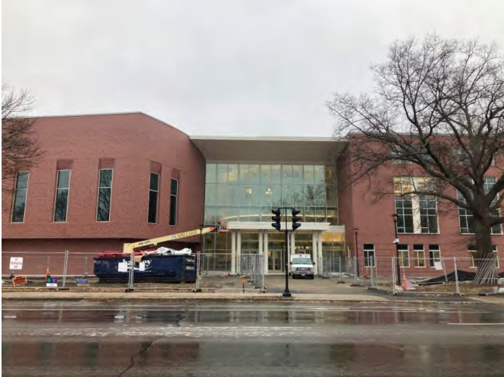
Photograph 3: Building D/E South Elevation (Mass Ave – Main Entrance #1)