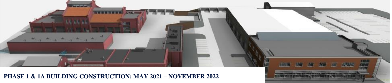
PHASE 1 & 1A BUILDING CONSTRUCTION: MAY 2021 – NOVEMBER 2022