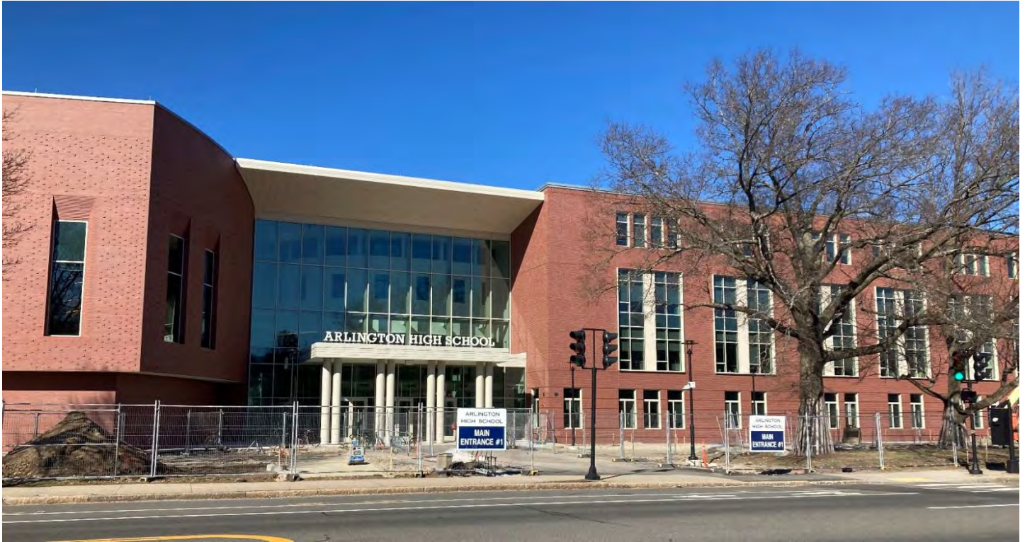
Photograph 3: Building D/E South Elevation (Main Entrance #1)