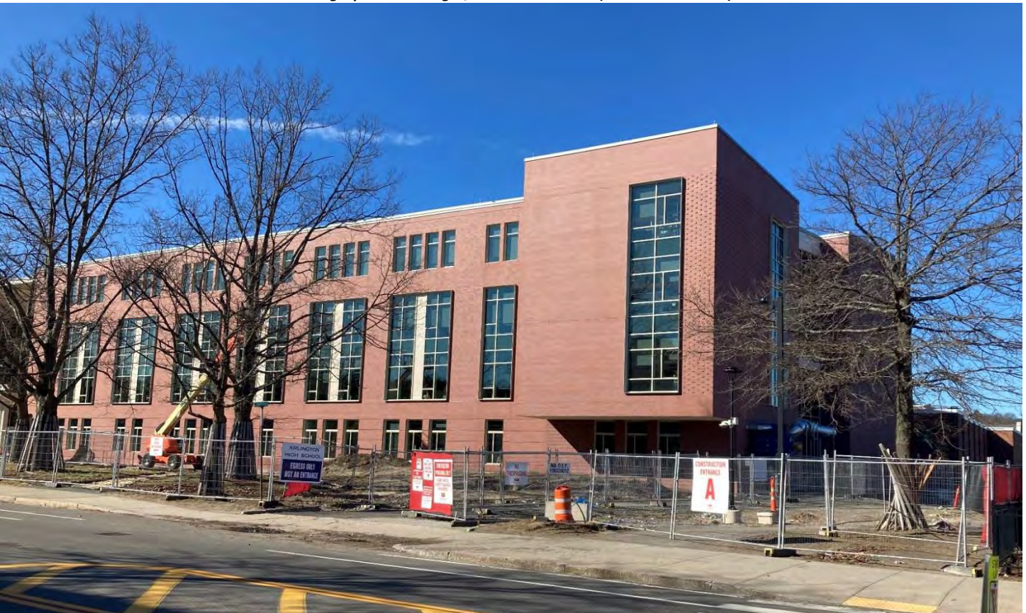
Photograph 4: Building D South Elevation (Mass Ave)