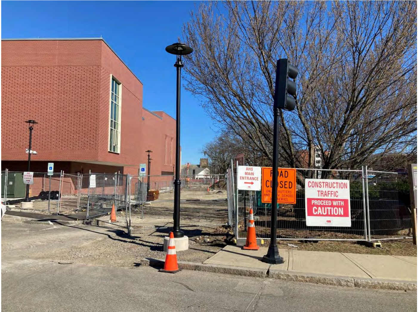
Photograph 5: Building E West Elevation (Schouler Court)