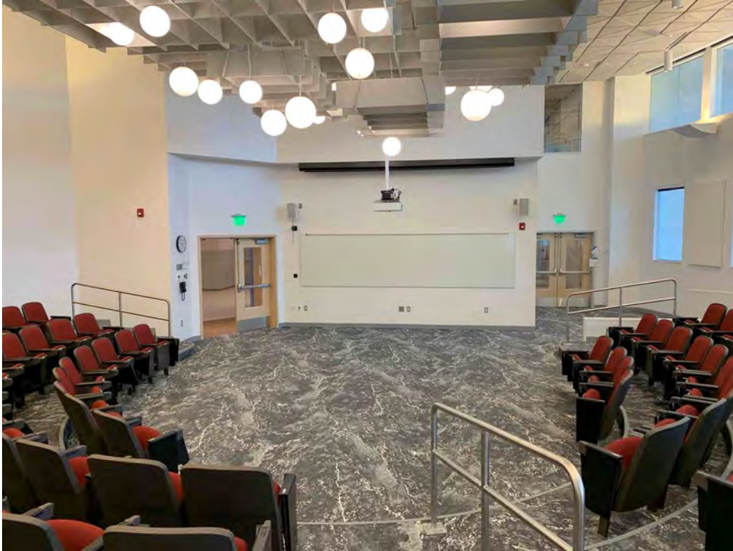
Photograph 1: Discourse Lab