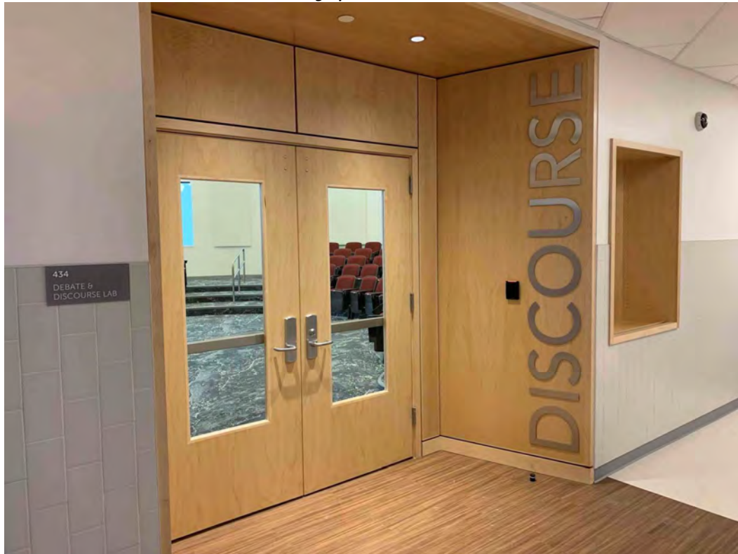
Photograph 2: Discourse Lab Entrance