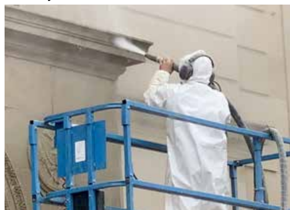
Recycled glass is used to clean the front entrance of Town Hall.