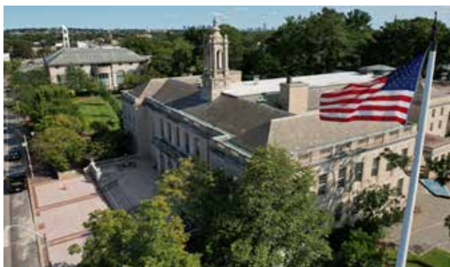
Restored Town Hall Plaza.

We would like to offer our appreciation to the custodial and maintenance teams for their continued service and dedication to providing the Town and School District with safe, clean, and well-maintained facilities.