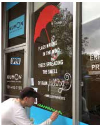
Volunteers painted community-authored haiku poems on storefront windows in Arlington Heights.

In Spring ACAC retained coordinators to expand public art programs including Live Arts Arlington outdoors performances, APS Youth Banners on Mass Ave, and others. Projects from Painted Utility Boxes to the 10-town Go Out Doors-Neighbors collaborative exhibition received wide regional media coverage.