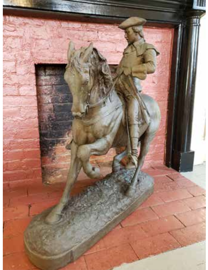
The Unum Insurance Company (successor of the Paul Revere Life Insurance Co.) donated a bronze cast of Dallin's Paul Revere No. 5 to the museum.