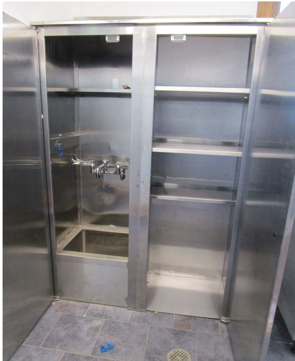
Kitchen mop sink cabinet