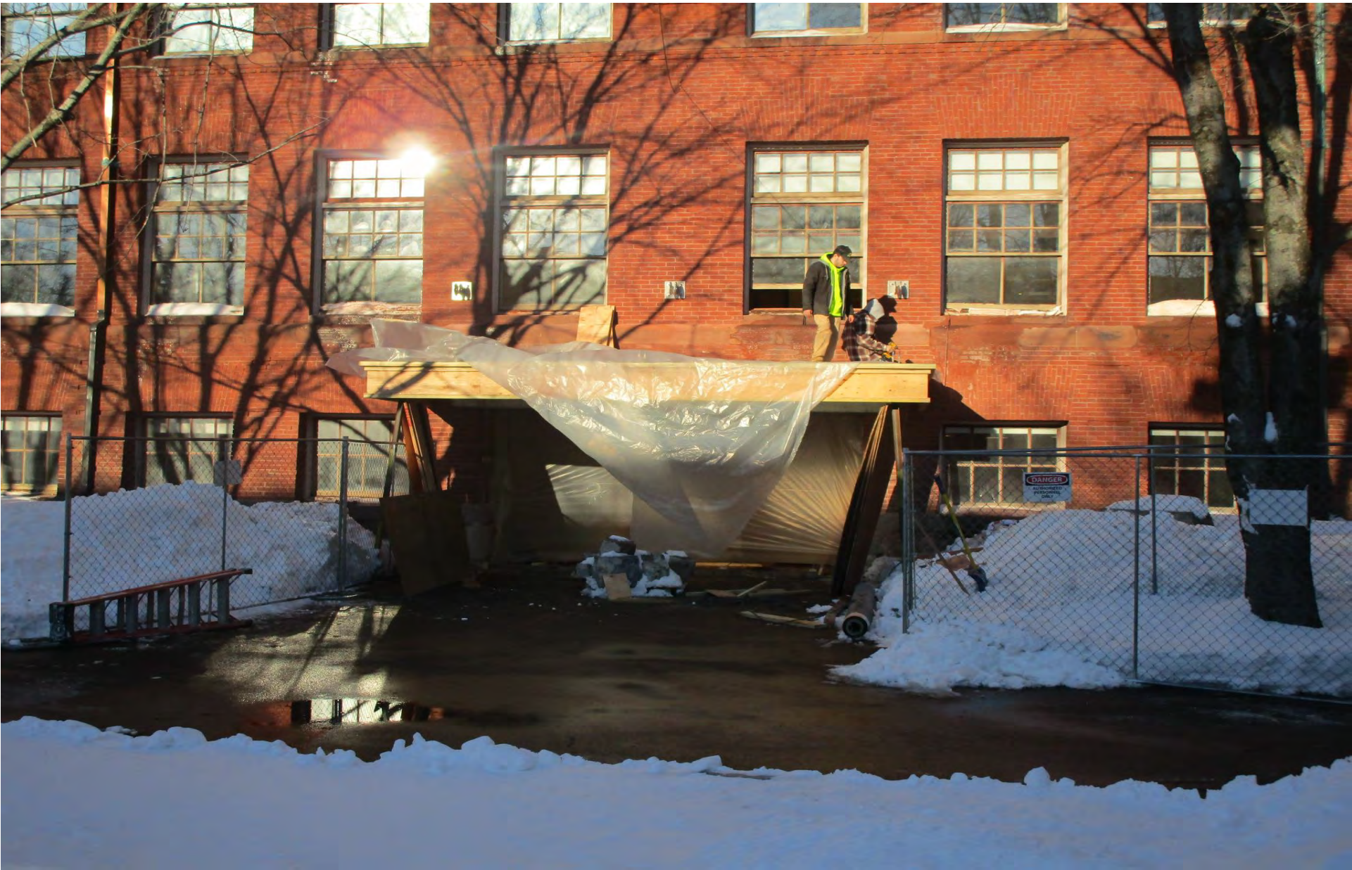
View of south entry canopy