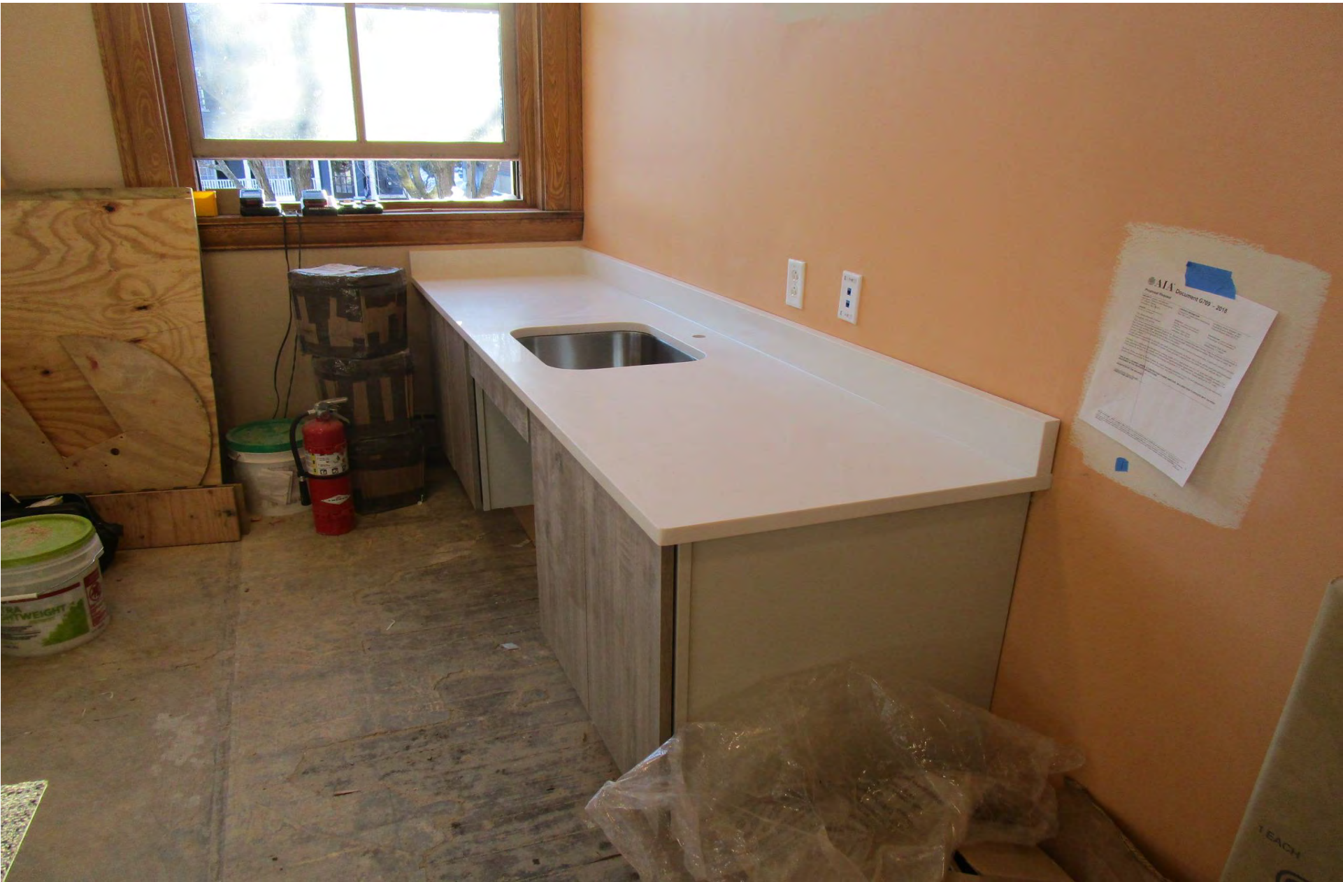
Countertop installed by Town in Drop-in Room