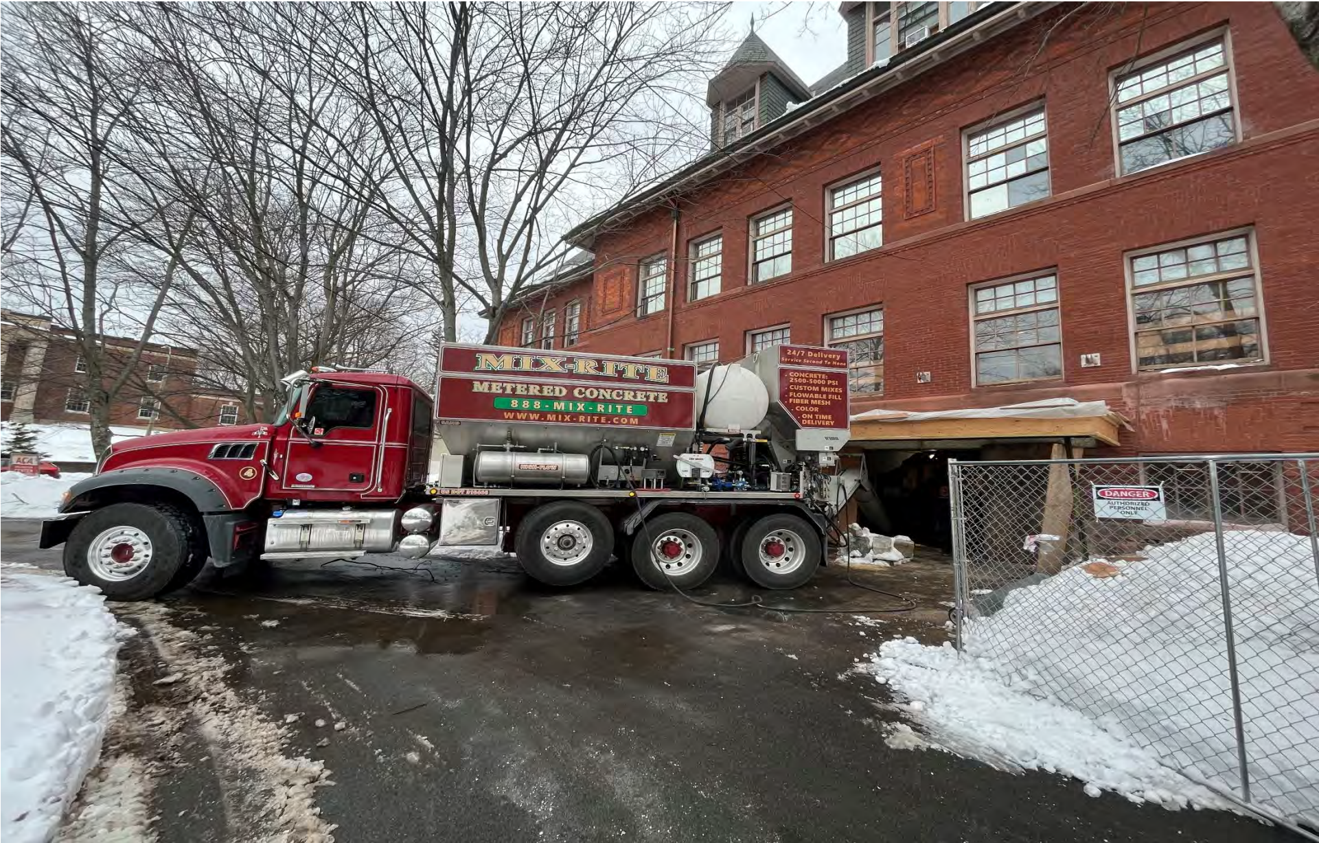
Concrete pour at south entry