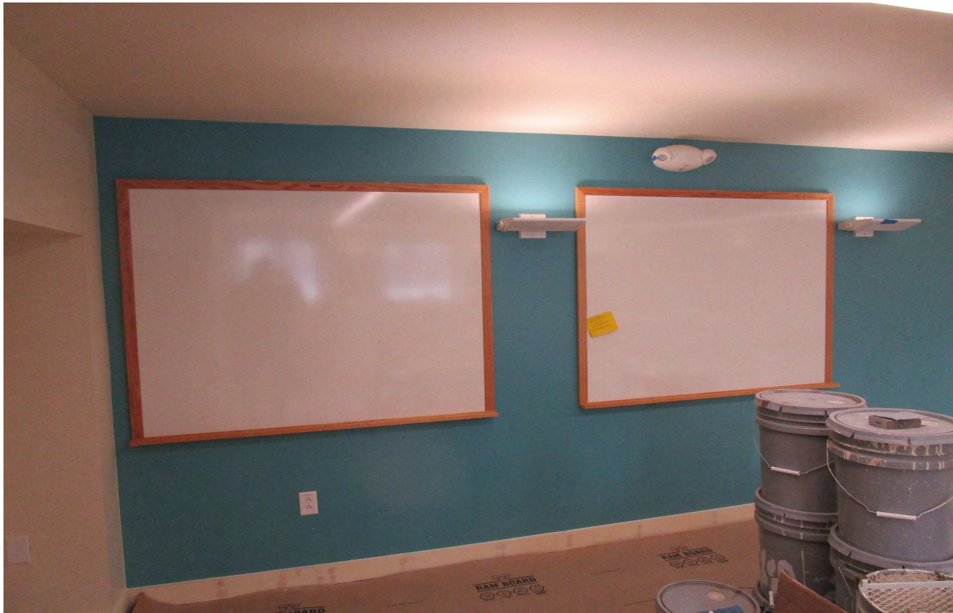
Whiteboards at Exercise Room