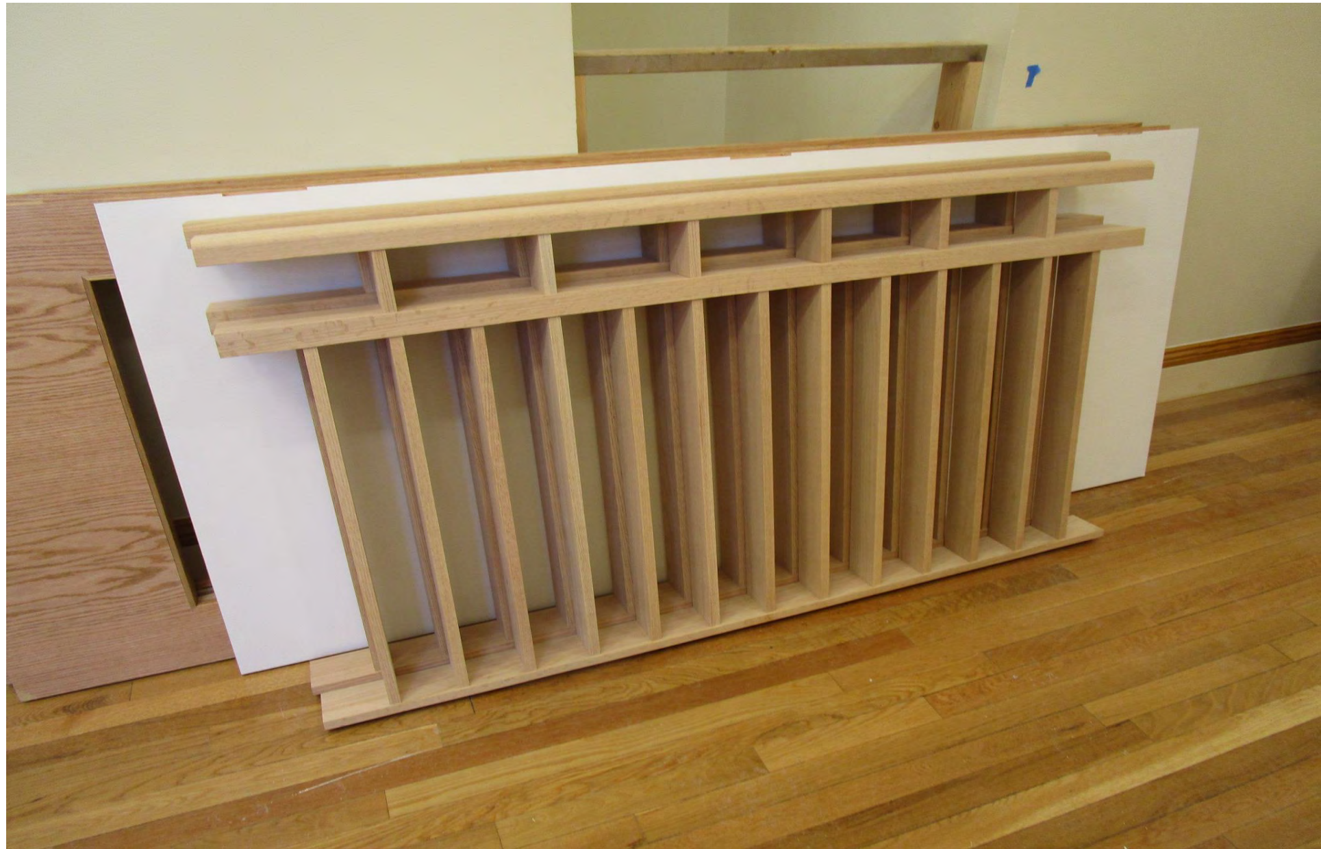
Oak railing delivered for Main Hall wall openings at Stairs #3