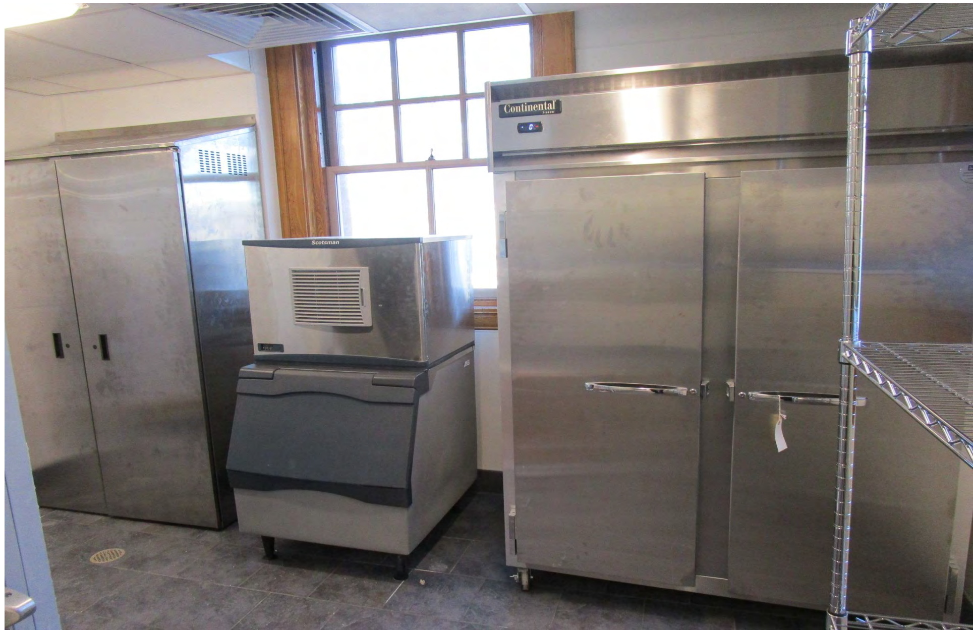
View of Kitchen back room with mop sink cabinet, ice maker and refrigerator