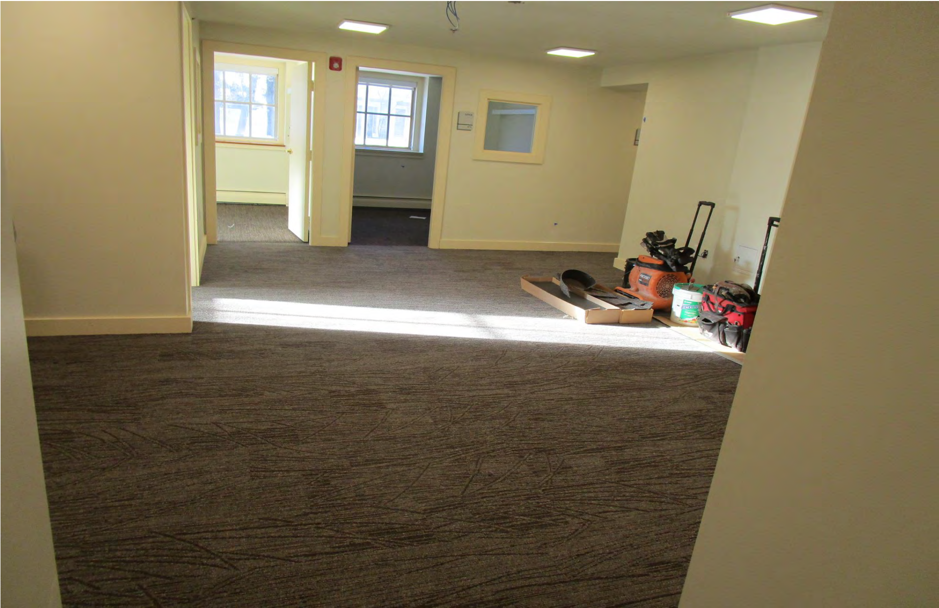
COA reception carpet