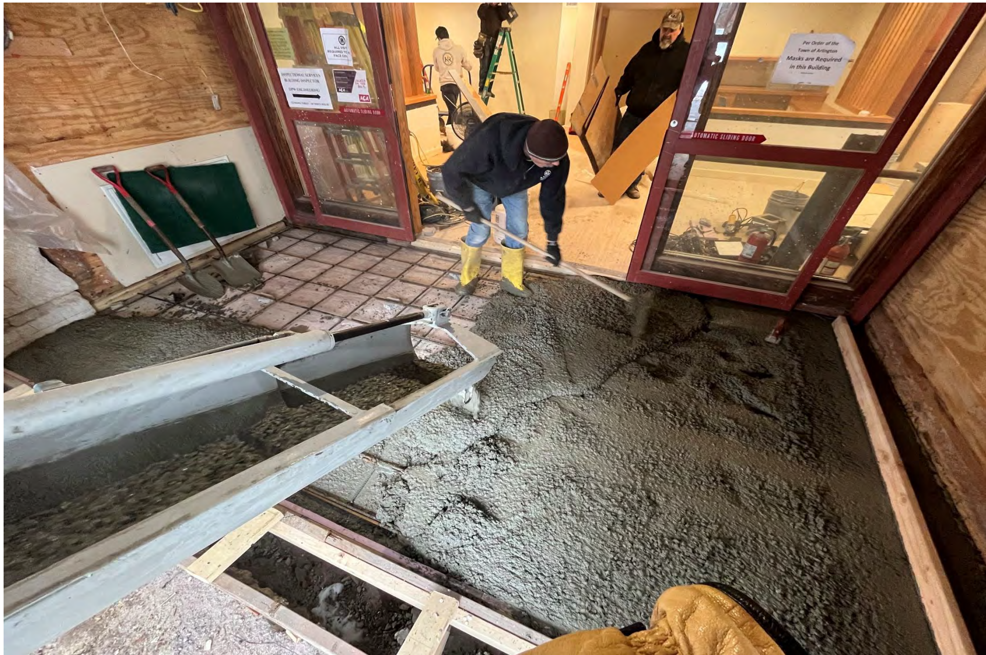
Pouring concrete overlay in south entry vestibule