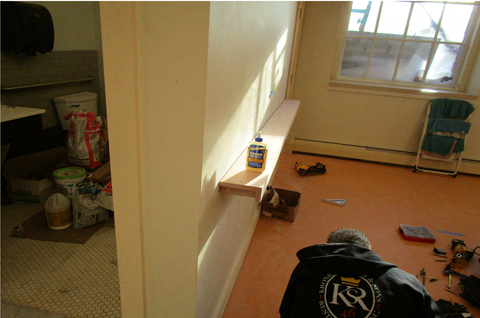
Charging station installation in Cafe