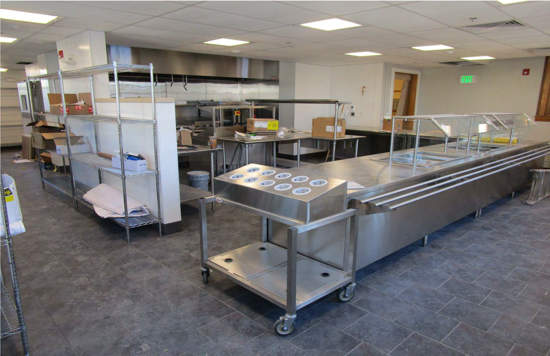
View of Kitchen