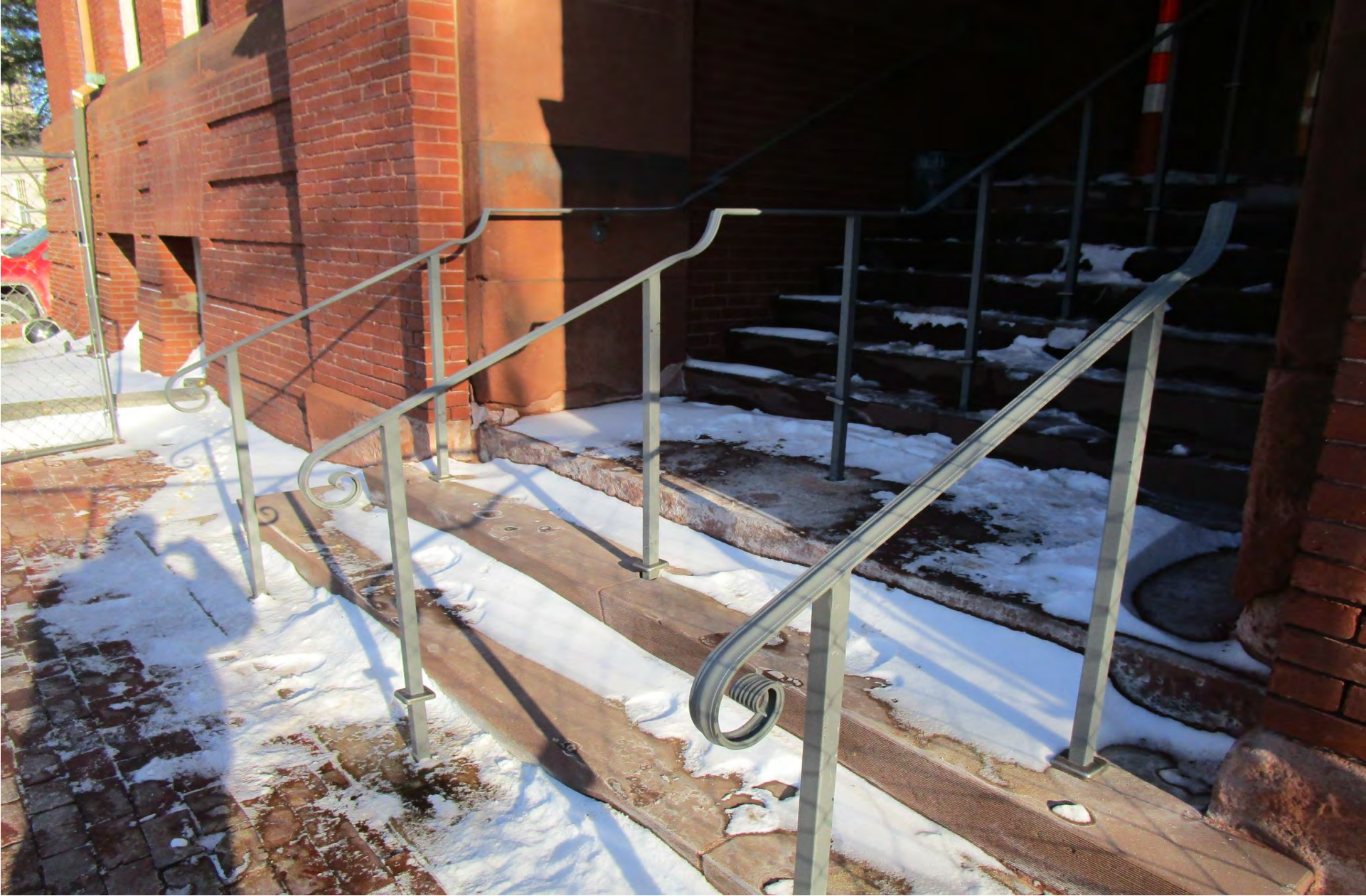
New railings at west entry