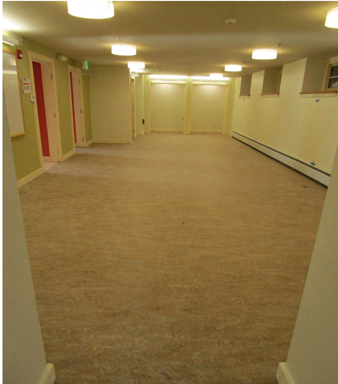
View of Game Room from Pool Room