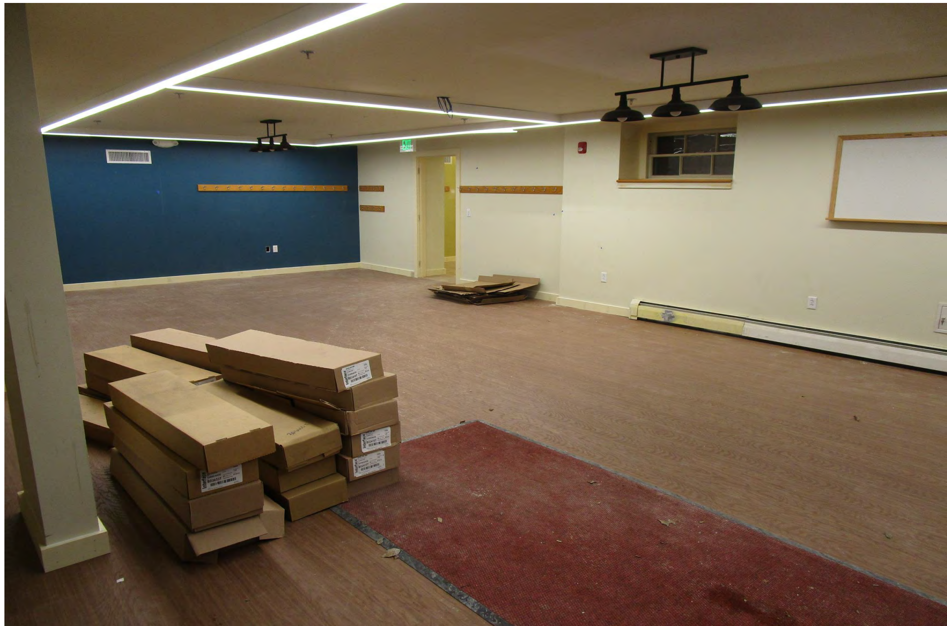
View of Pool Room