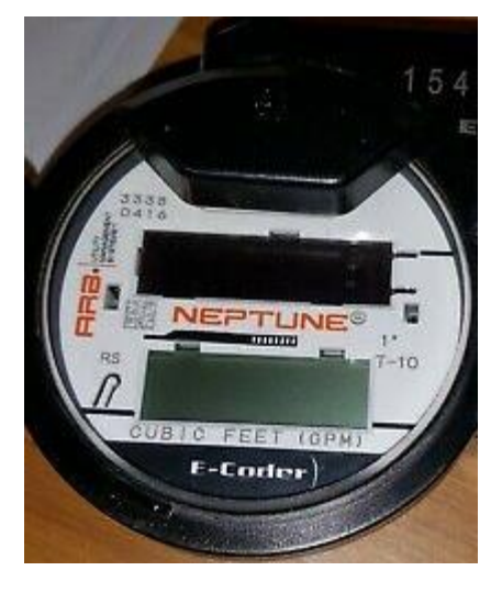
Meter head prior to activation with bright light

Reading Screen - Shows the current read with comma separators and decimal place, after initial activation this screen displays for 20 seconds before toggling to Rate Screen.