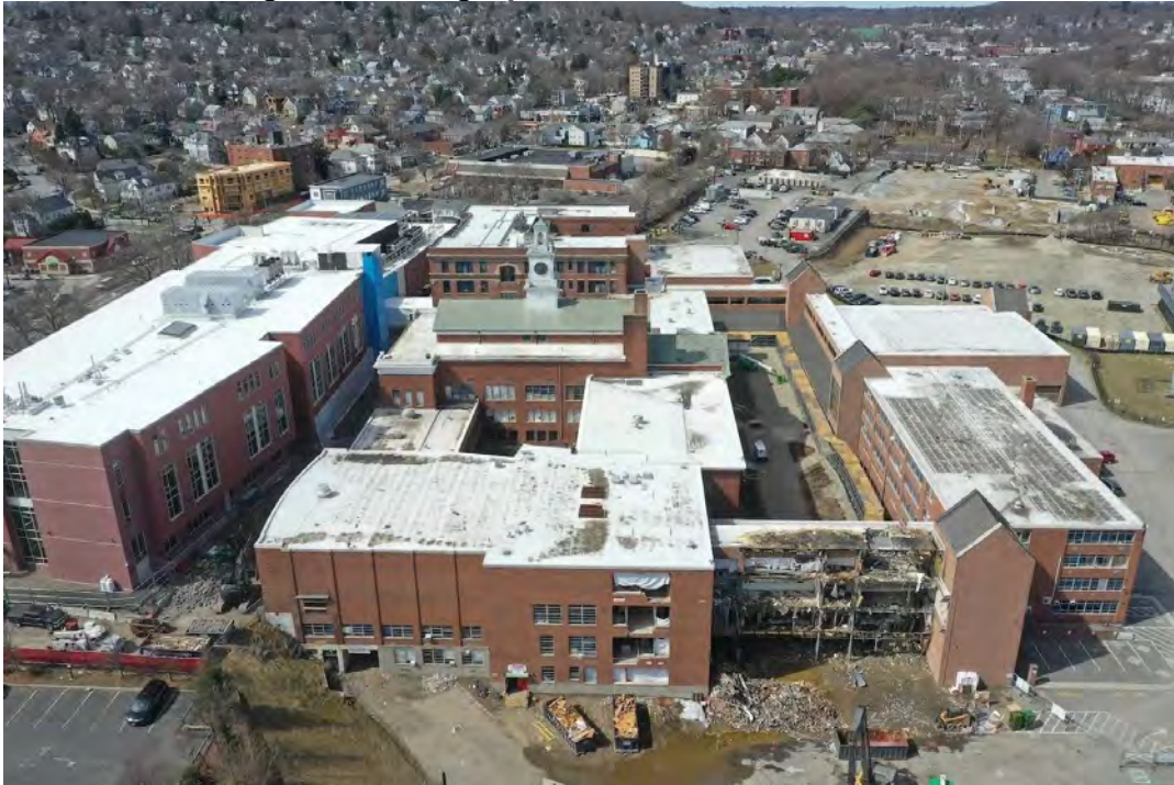
Photograph 1: Demolition Progress