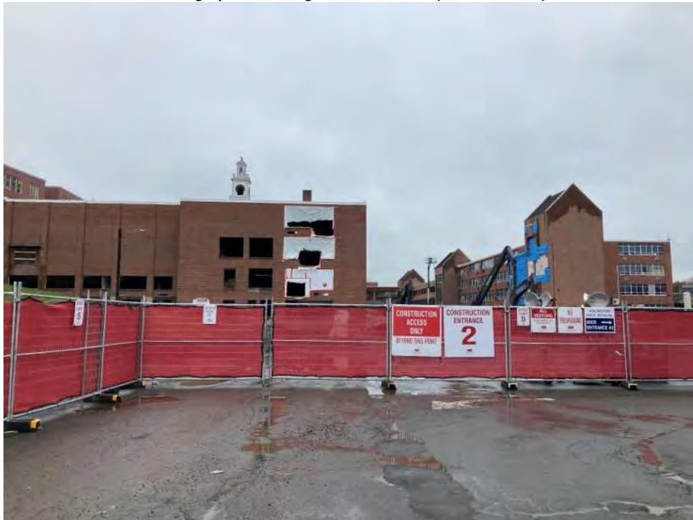
Photograph 6: Collomb Building East Elevation (Mill Brook Drive)