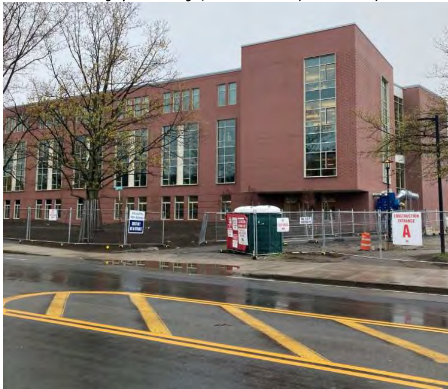
Photograph 4: D Building South Elevation (Mass Ave)