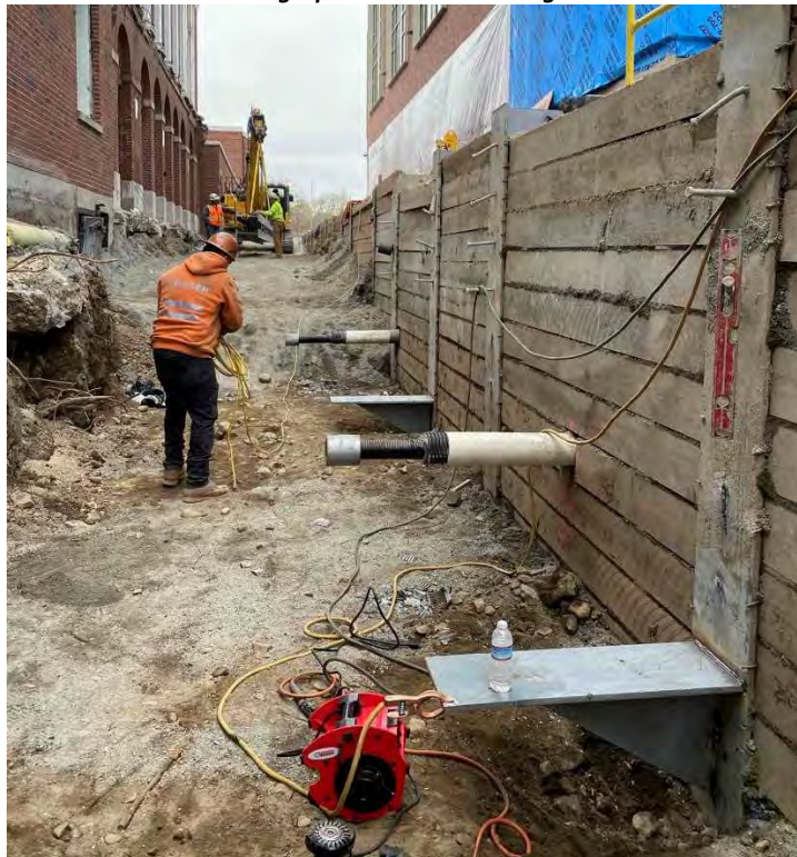
Photograph 2: Support of Excavation (SOE) wall between the Phase 1 Building & Collomb House