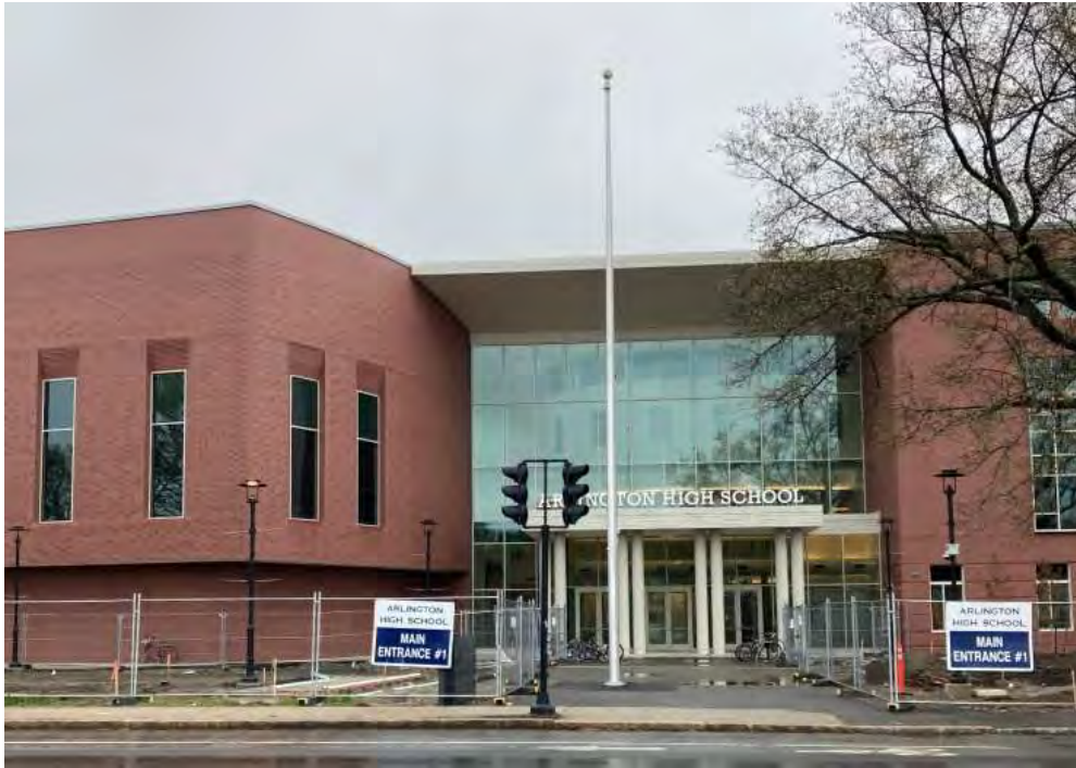
Photograph 3: Building D/E South Elevation (Main Entrance)