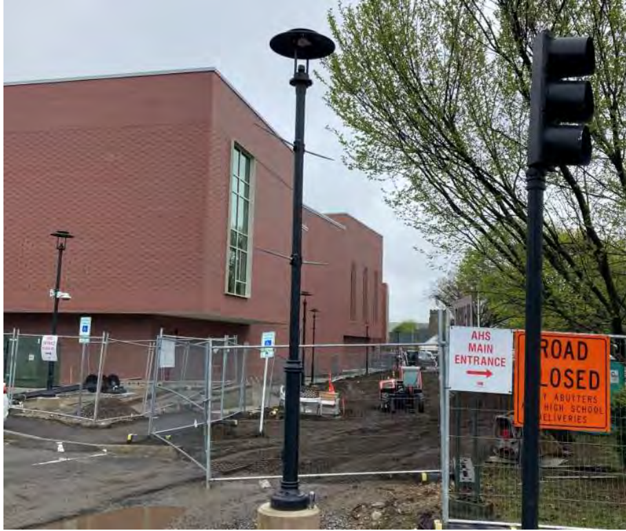
Photograph 5: Building E West Elevation (Schouler Court)