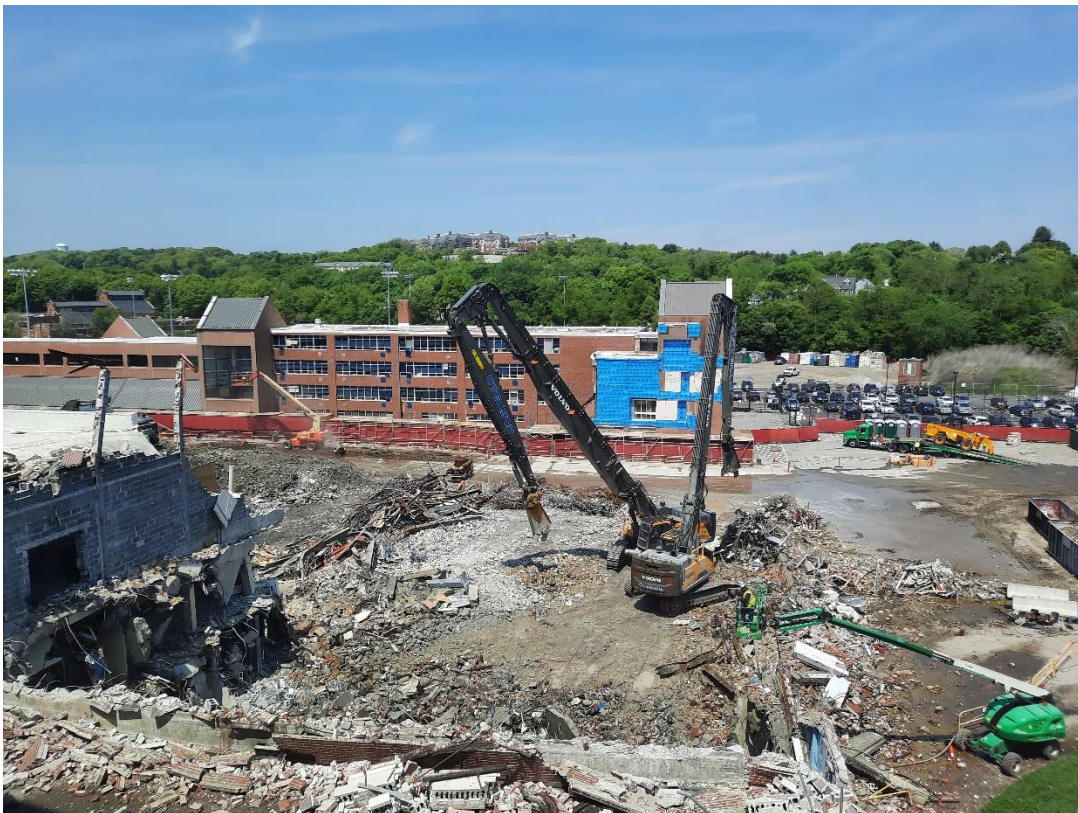
Photograph 4: Collomb Building North Elevation