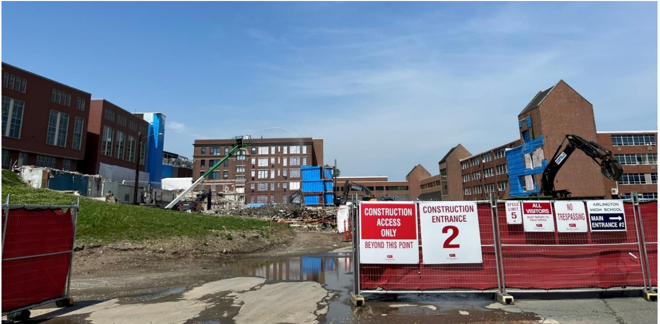
Photograph 3: Collomb Building East Elevation

WEEKLY UPDATE – WEEK OF JUNE 6 TH , 2022