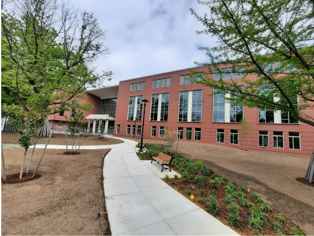
Photograph 1: Mass Ave. sidewalk and landscaping progress