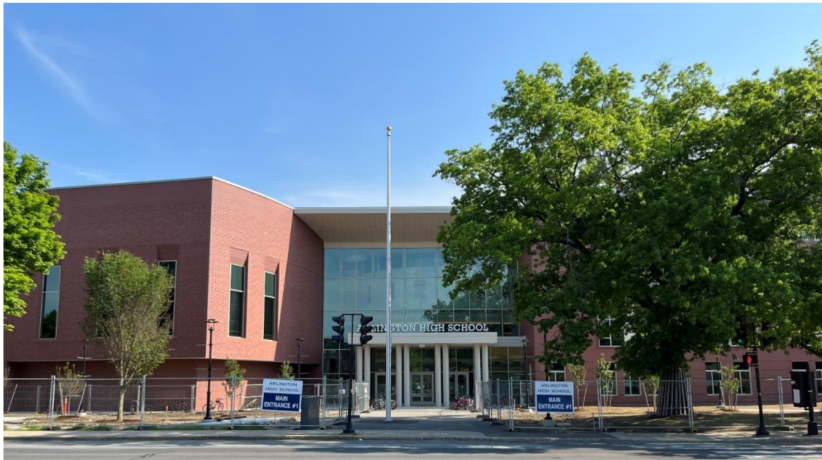
Photograph 2: Building D/E South Elevation (Main Entrance)