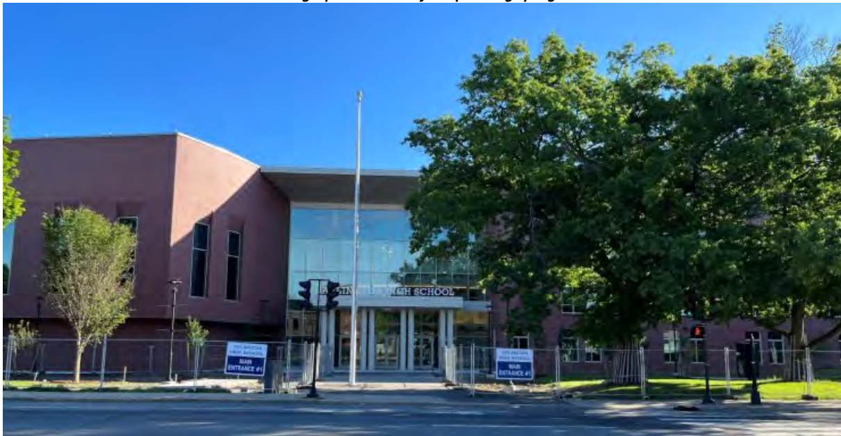
Photograph 2: Building D/E South Elevation (Main Entrance #1)