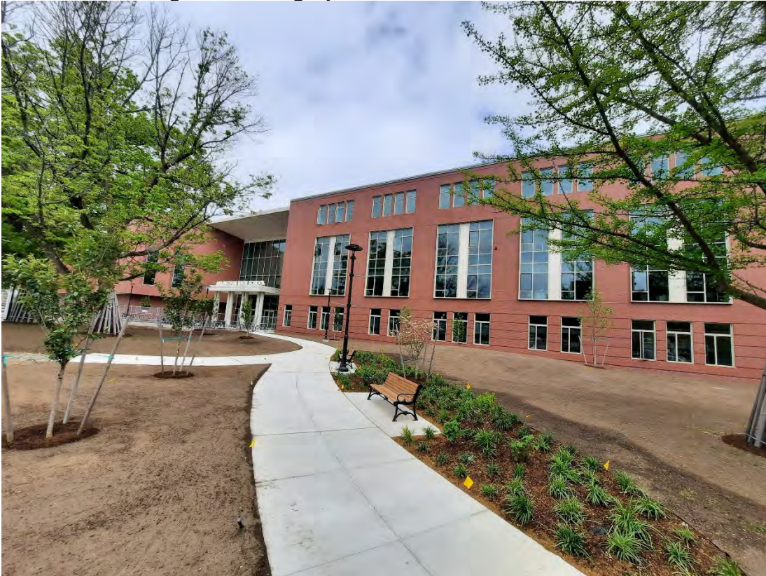
Photograph 1: Phase 1 final plantings progress