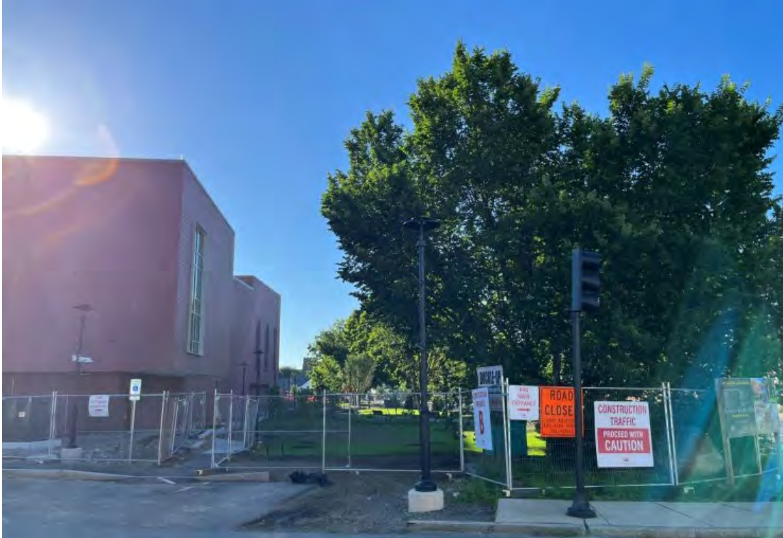
Photograph 3: Building E West Elevation (Schouler Court)