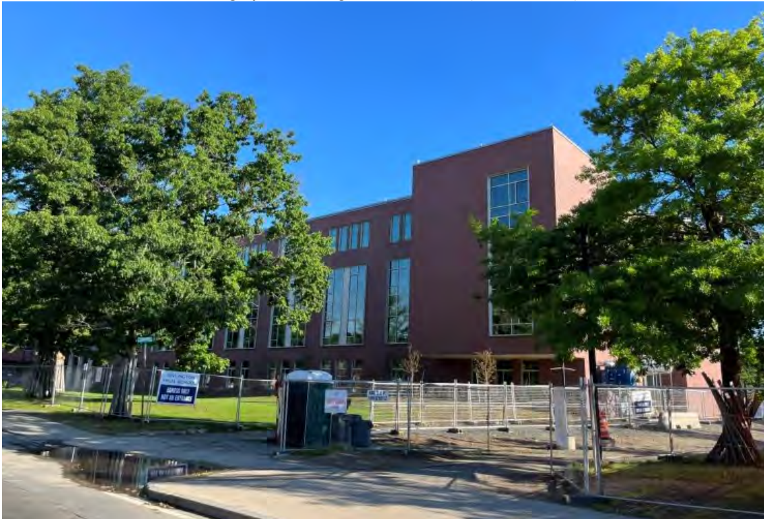
Photograph 4: D Building South Elevation (Mass Ave)