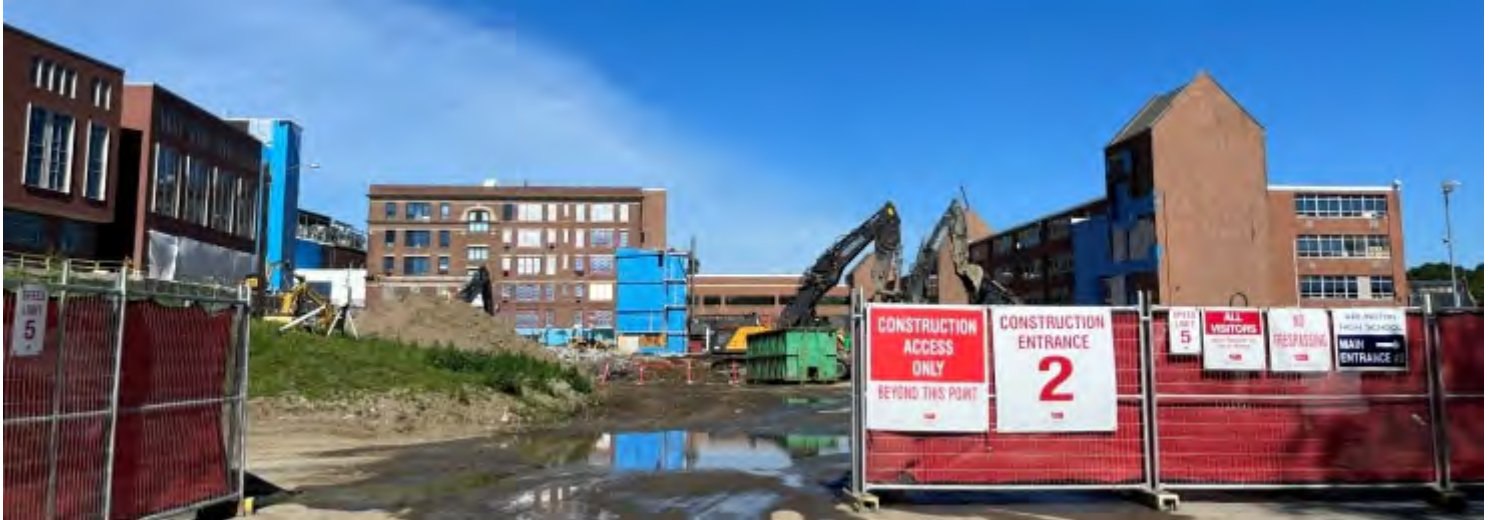
Photograph 5: Collomb Building East Elevation (Mill Brook Drive)