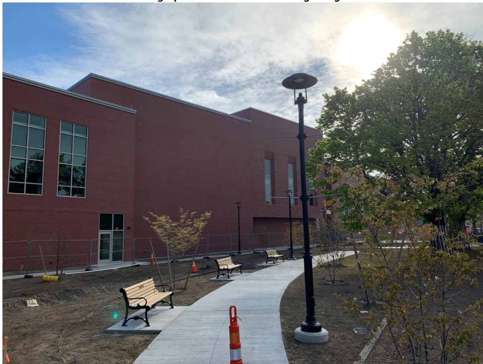
Photograph 2: Phase 1 Sidewalk Progress