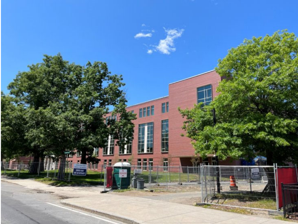
Photograph 5: D Building South Elevation (Mass Ave)

WEEKLY UPDATE – WEEK OF JUNE 27 TH , 2022