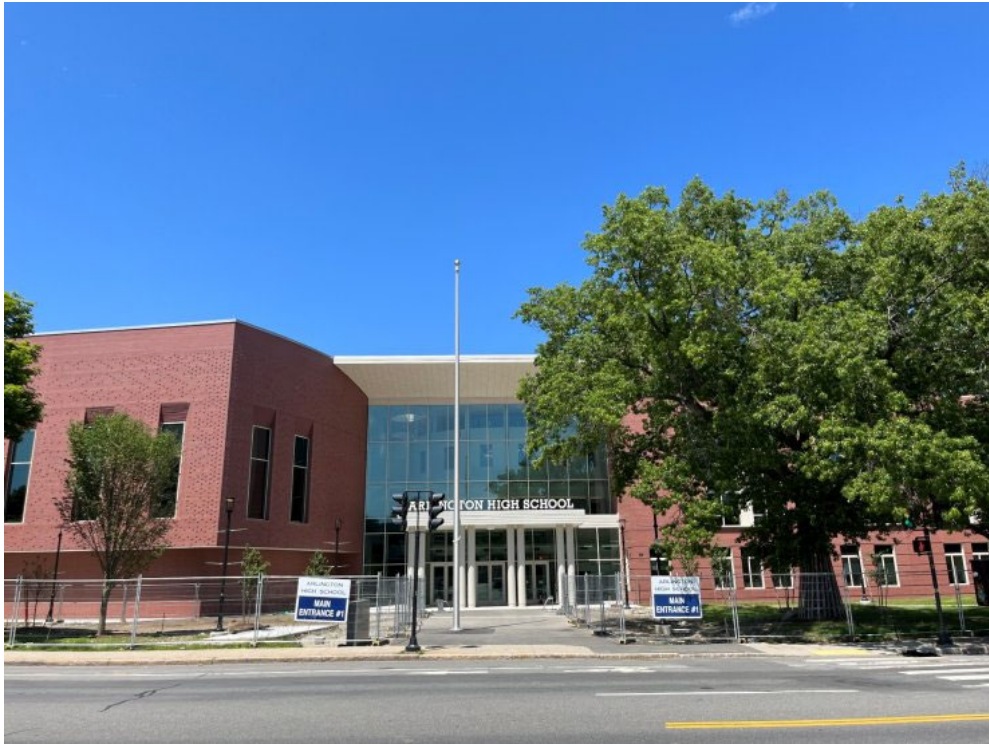
Photograph 3: Building D/E South Elevation (Main Entrance #1)