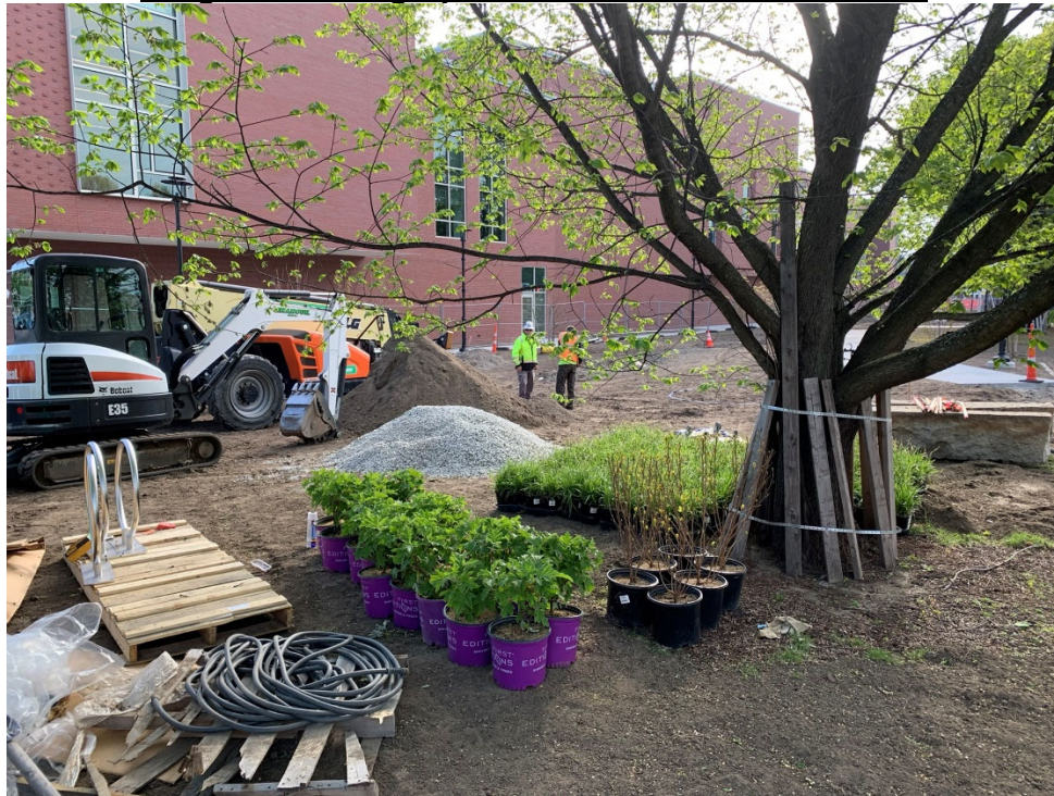
Photograph 1: Phase 1 Final Plantings Progress