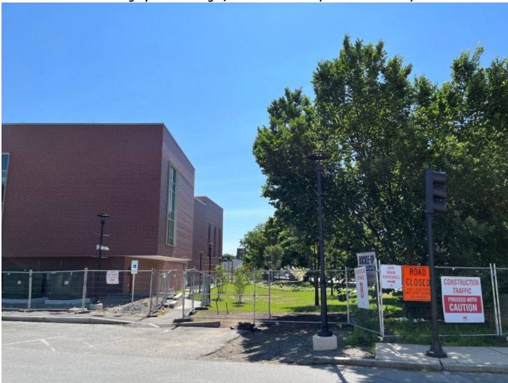
Photograph 4: Building E West Elevation (Schouler Court)