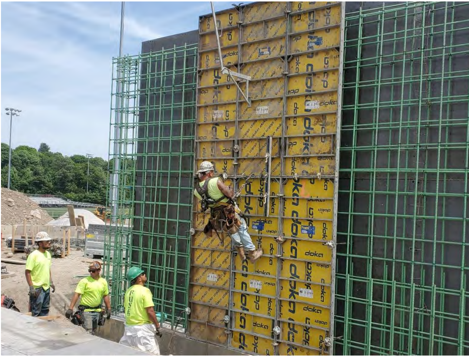
Photo # 1 – Rebar and Formwork at Salt Shed Walls in Progress (6/7/2022)