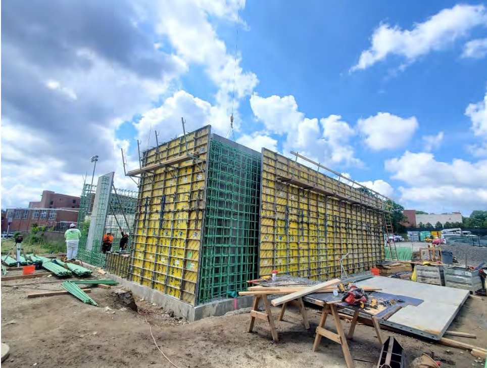
Photo # 3 – Rebar and Formwork at Salt Shed Walls in Progress (6/13/2022)