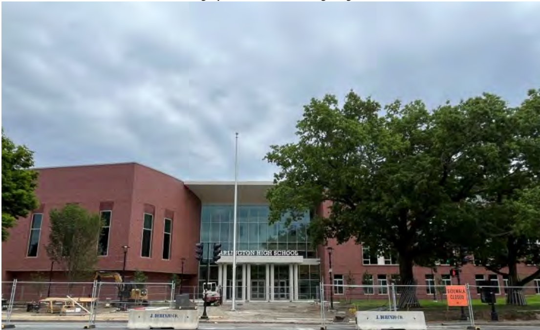
Photograph 2: Building D/E South Elevation (Main Entrance #1)