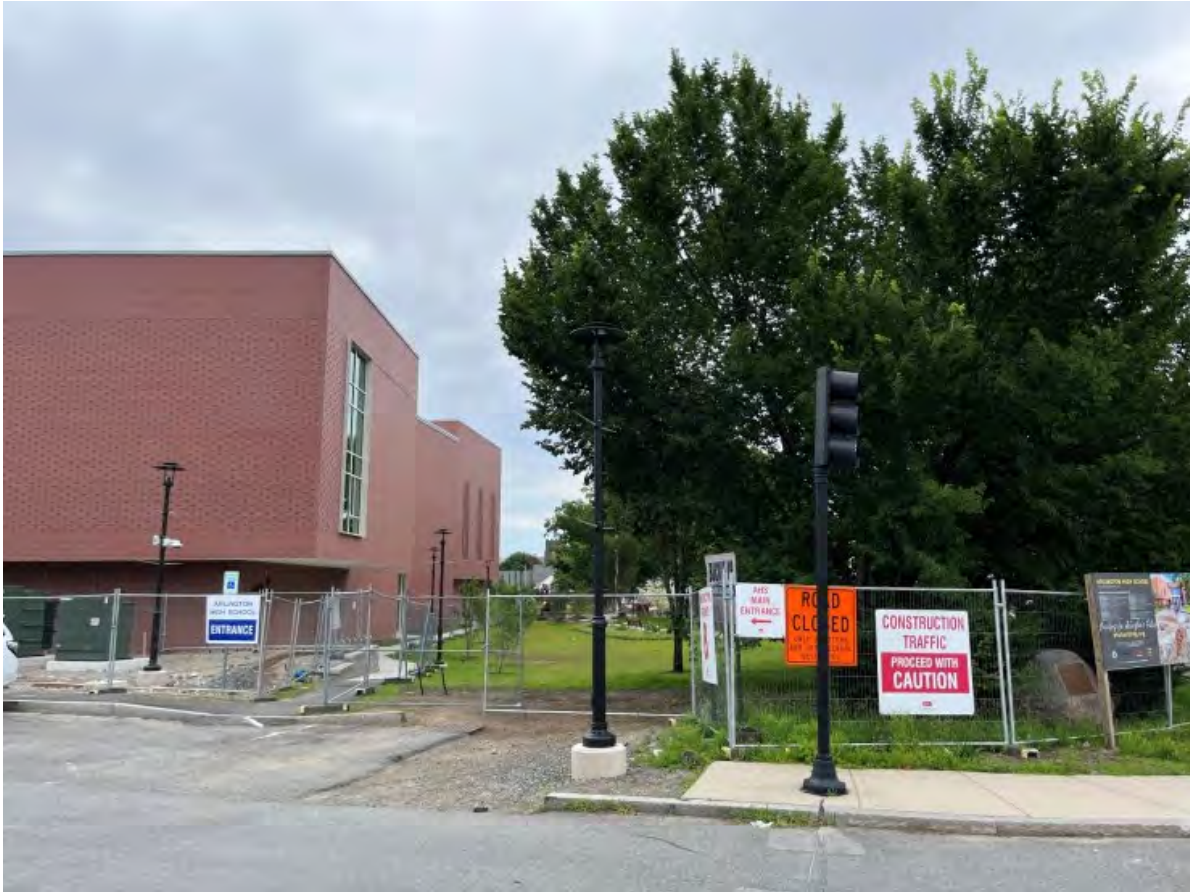
Photograph 3: Building E West Elevation (Schouler Court)