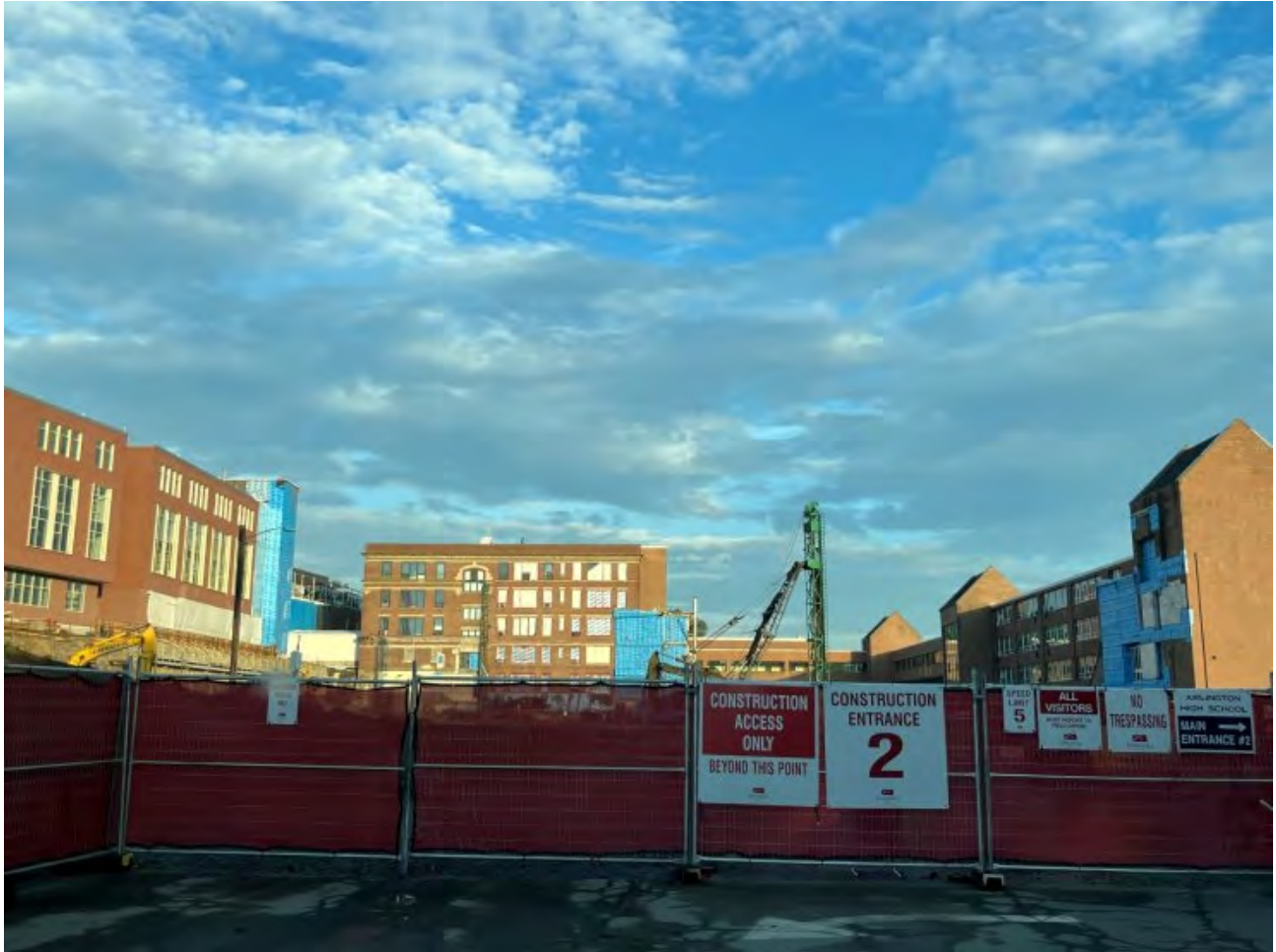
Photograph 5: Collomb Building East Elevation (Mill Brook Drive)