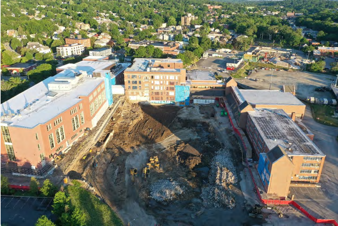
Photograph 1: Phase 2 Enabling Progress