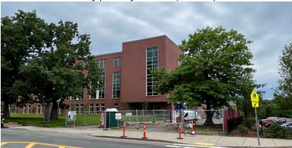
Photograph 4: D Building South Elevation (Mass Ave)