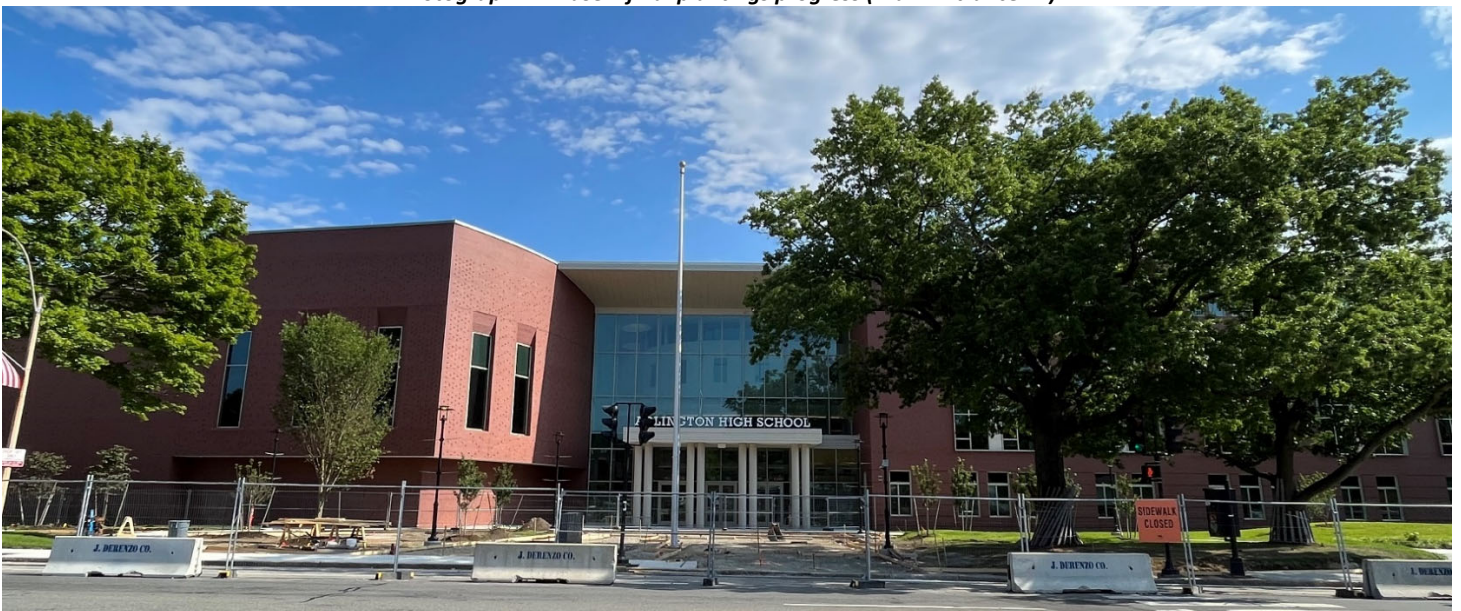
Photograph 2: Building D/E South Elevation (Main Entrance)