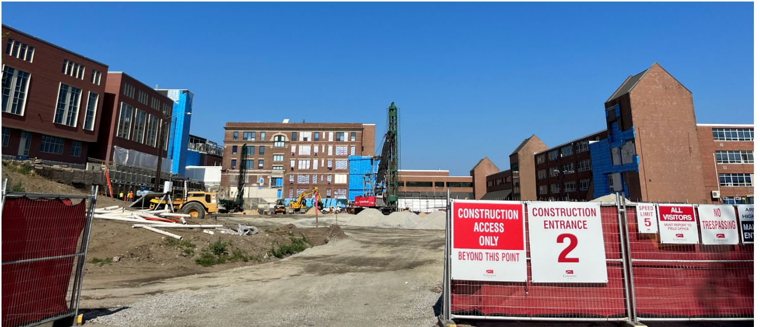
Photograph 5: Collomb Building East Elevation (Mill Brook Drive)