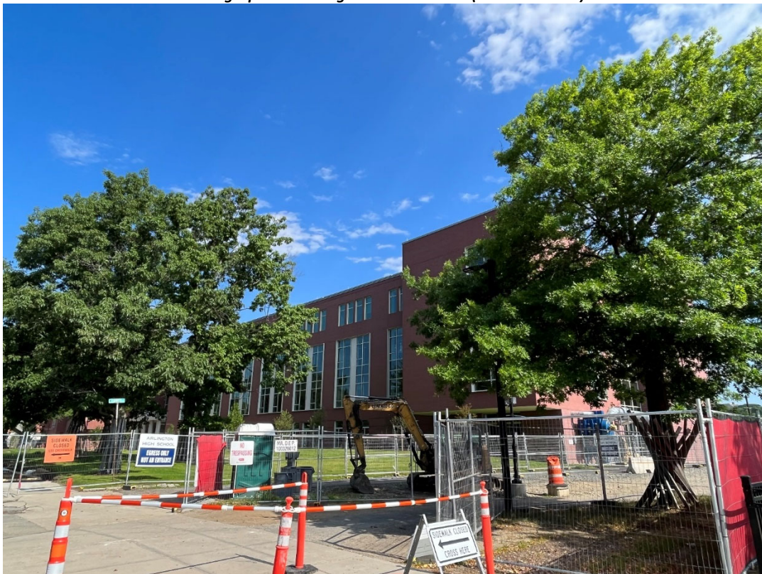
Photograph 4: D Building South Elevation (Mass Ave)