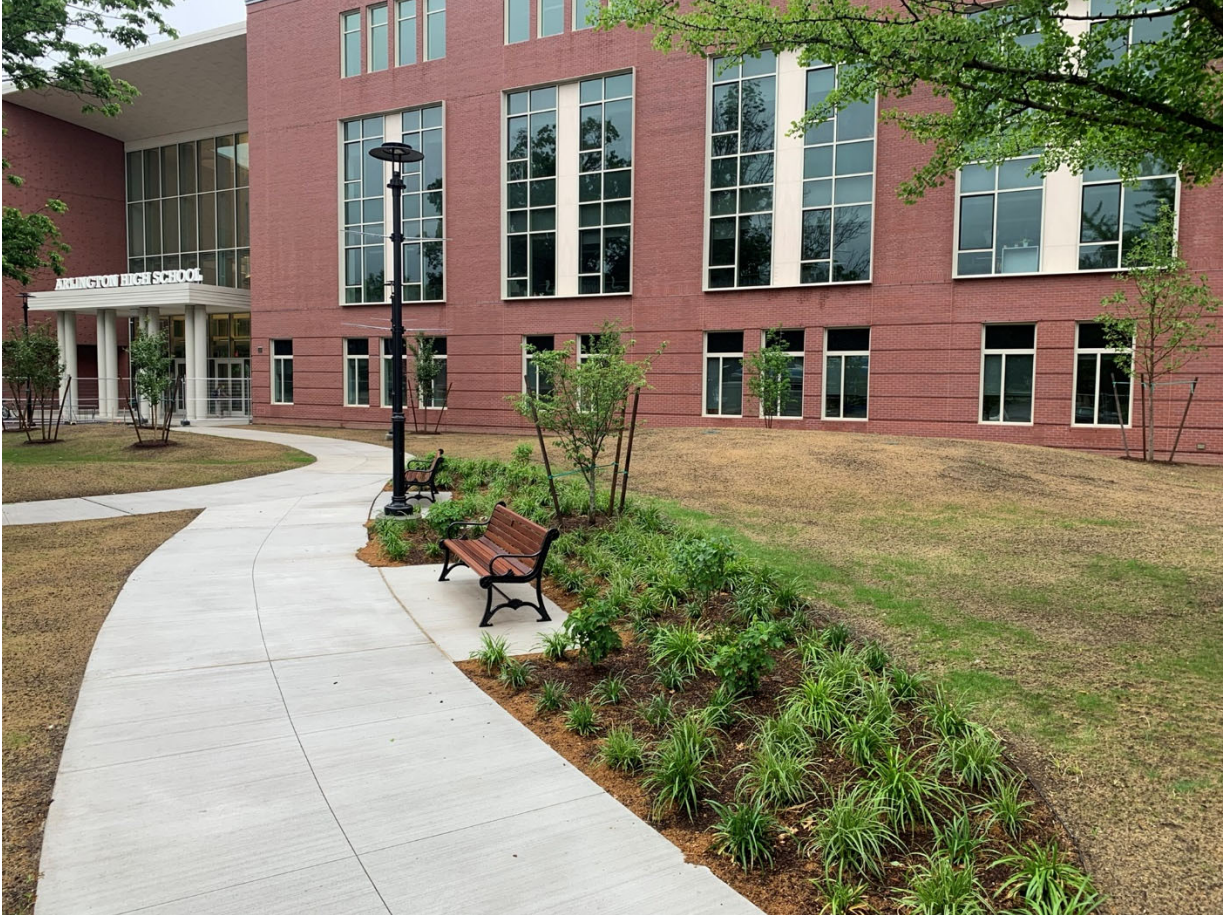
Photograph 1: Phase 1 final plantings progress (Main Entrance #1)