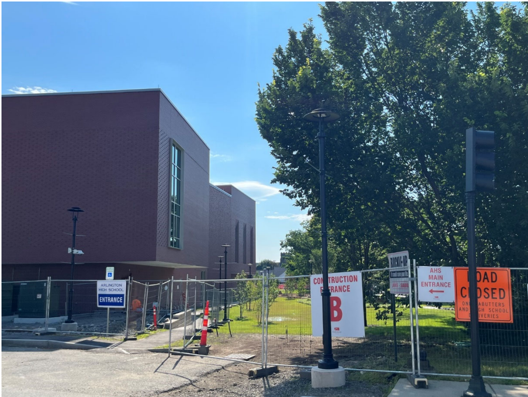
Photograph 3: Building E West Elevation (Schouler Court)