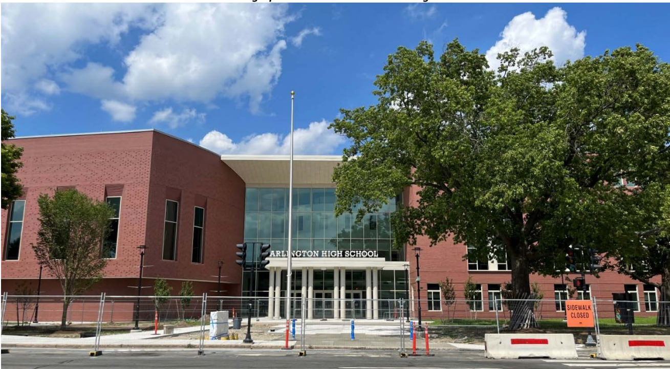
Photograph 2: Building D/E South Elevation (Main Entrance #1)