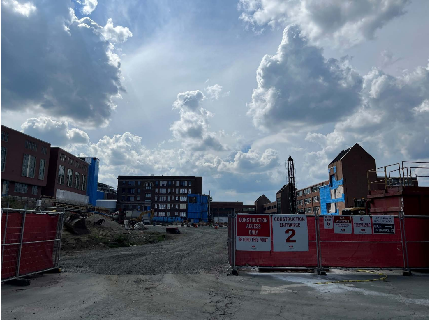
Photograph 5: View from Mill Brook Drive