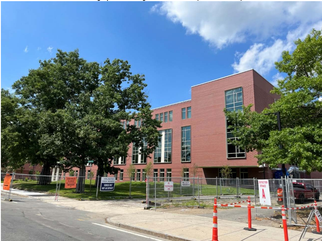
Photograph 4: D Building South Elevation (Mass Ave)