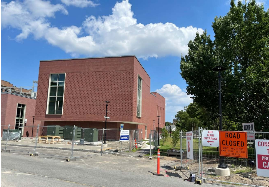
Photograph 3: Building E West Elevation (Schouler Court)