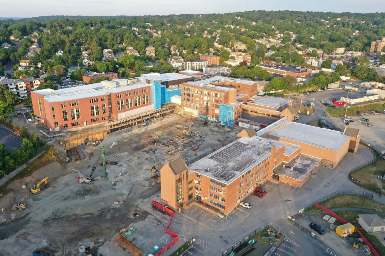
Photograph 1: Phase 2 Foundations Progress