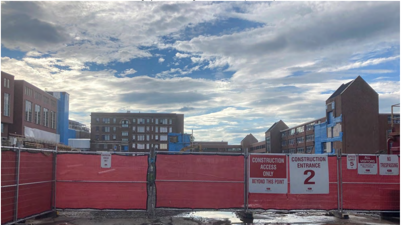
Photograph 5: East Elevation (Mill Brook Drive)