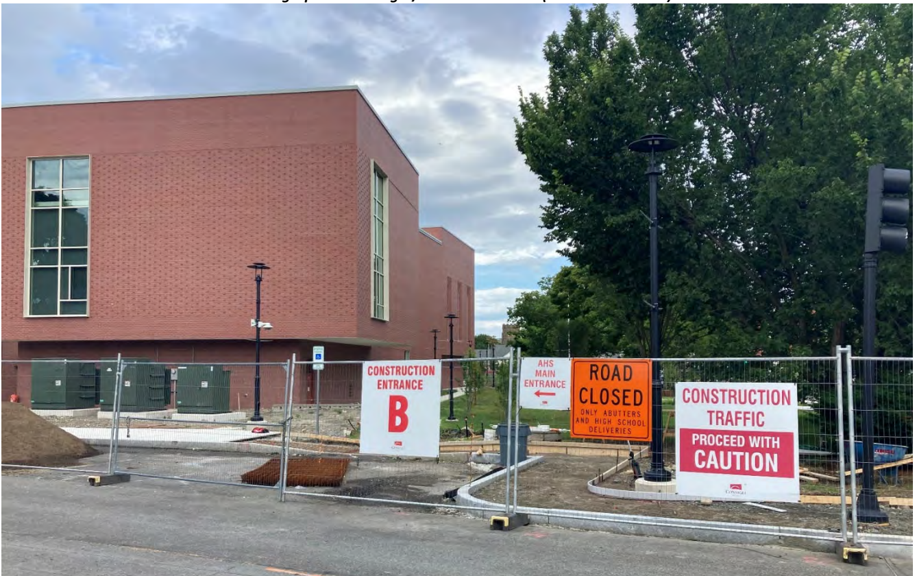
Photograph 3: Building E West Elevation (Schouler Court)