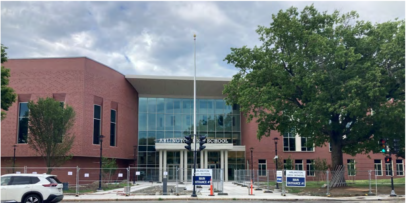
Photograph 2: Building D/E South Elevation (Main Entrance #1)