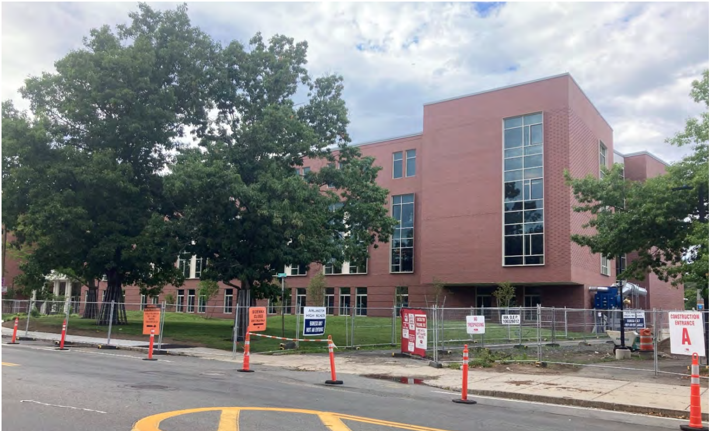
Photograph 4: D Building South Elevation (Mass Ave)