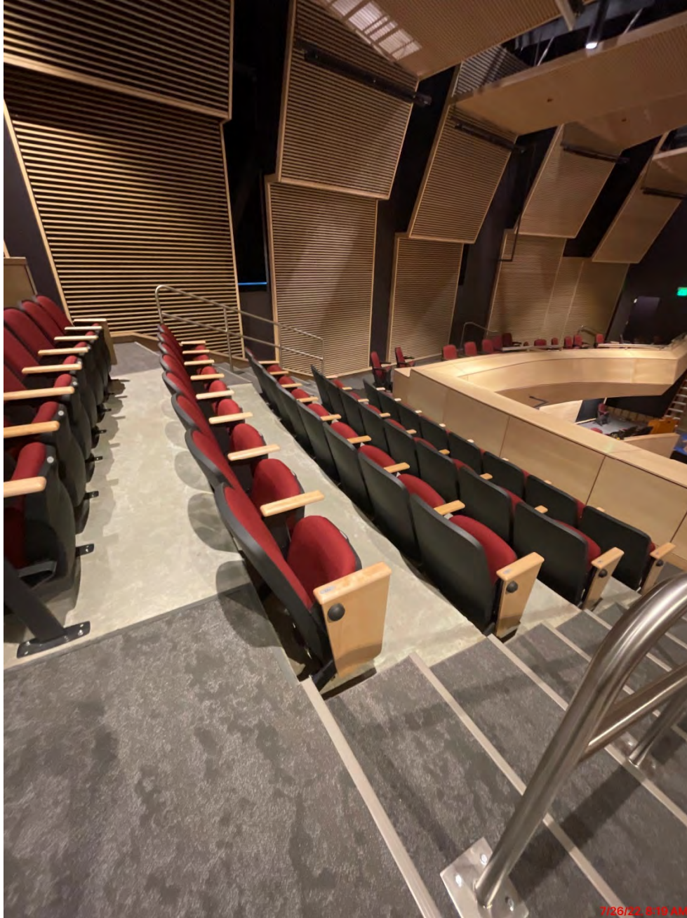
Photograph 1: Auditorium Millwork Progress

Progress Photographs – Taken Week of 8/8/2022