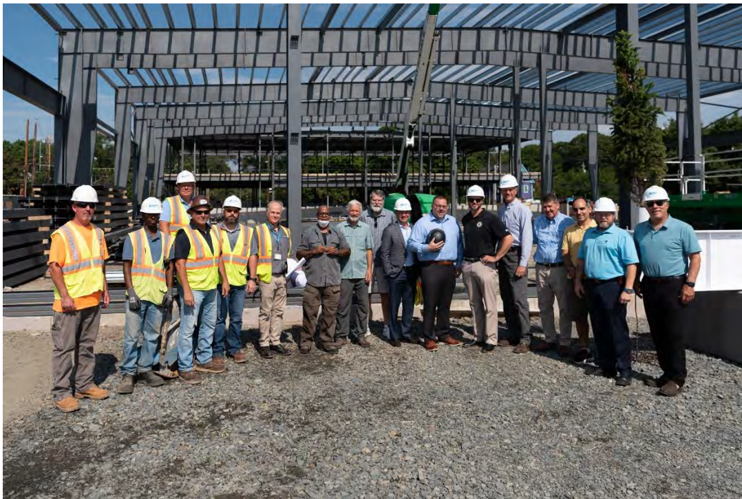
Photo # 4 – Project Team and Town Officials at Topping-Off (8/9/22)