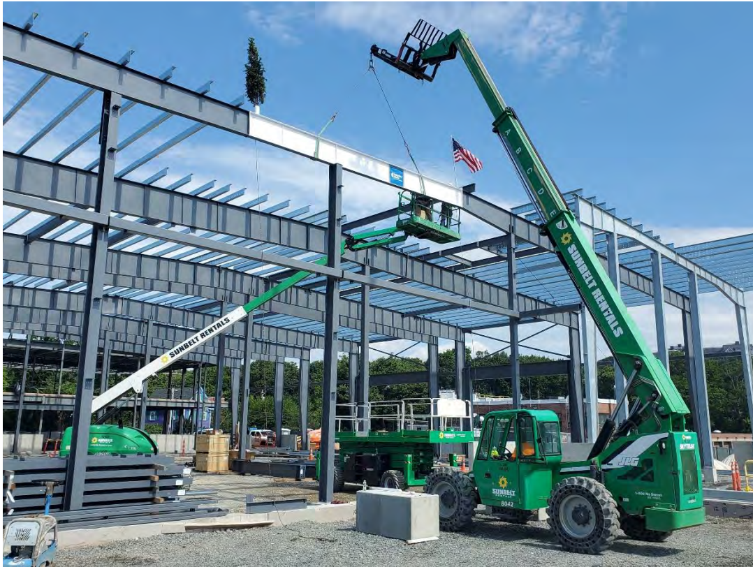
Photo # 3 – Final Beam in Place at the Topping-Off Ceremony (8/9/22)