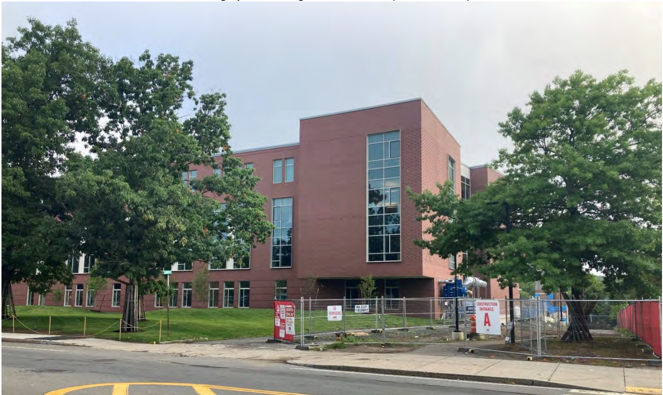
Photograph 4: D Building Southeast Elevation (Mass Ave)