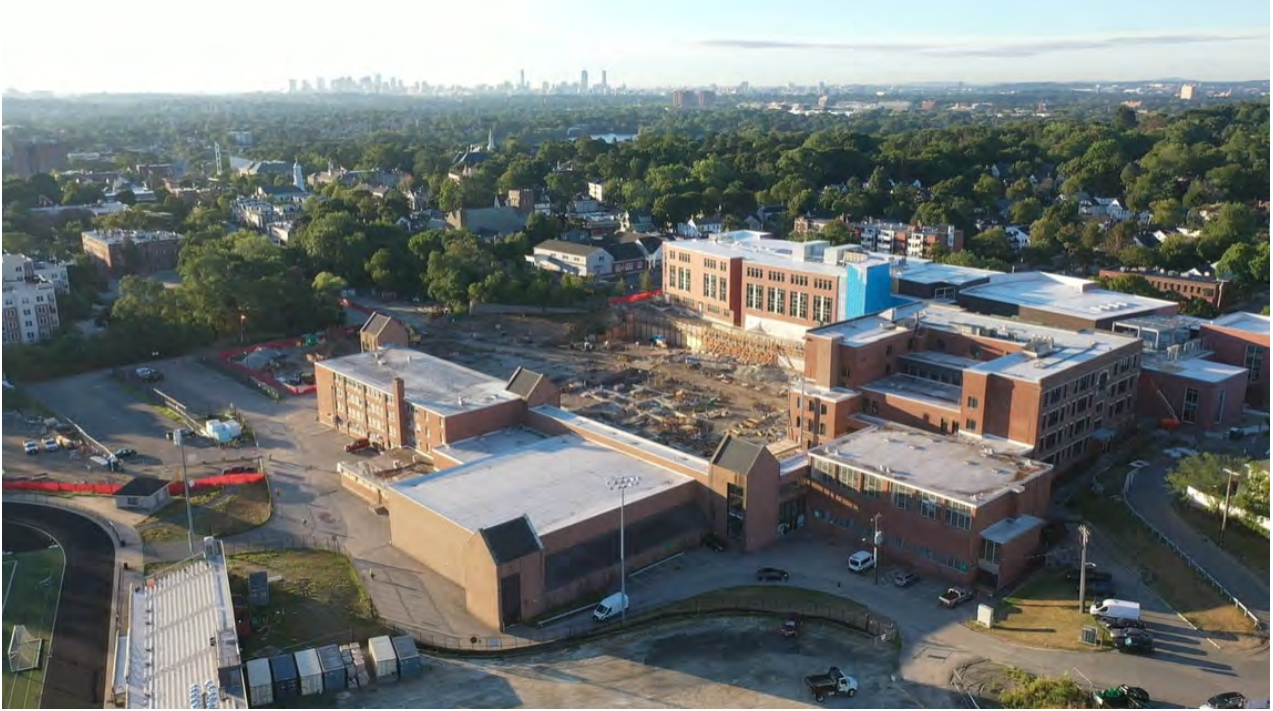
Photograph 1: Phase 2 Progress (Drone)