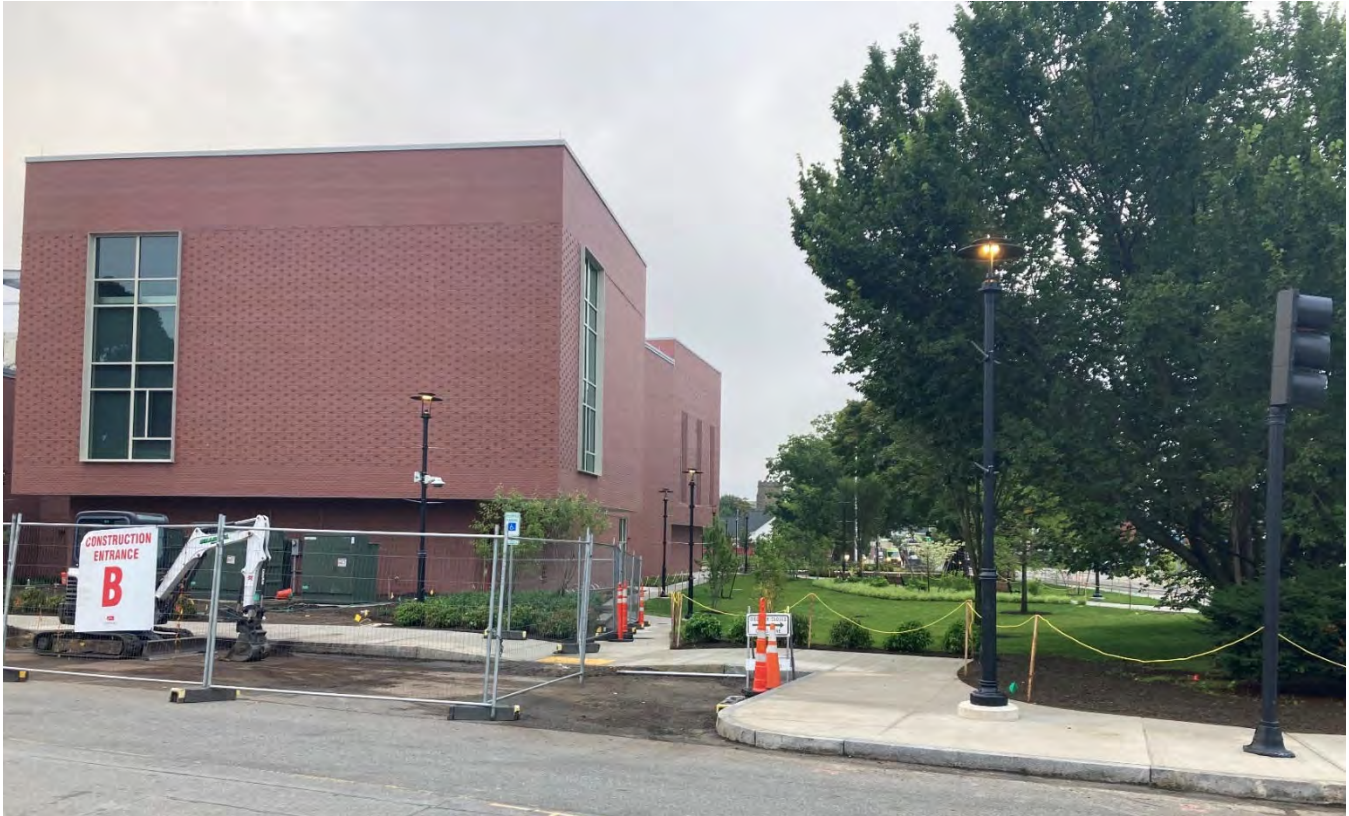
Photograph 3: Building E West Elevation (Schouler Court)