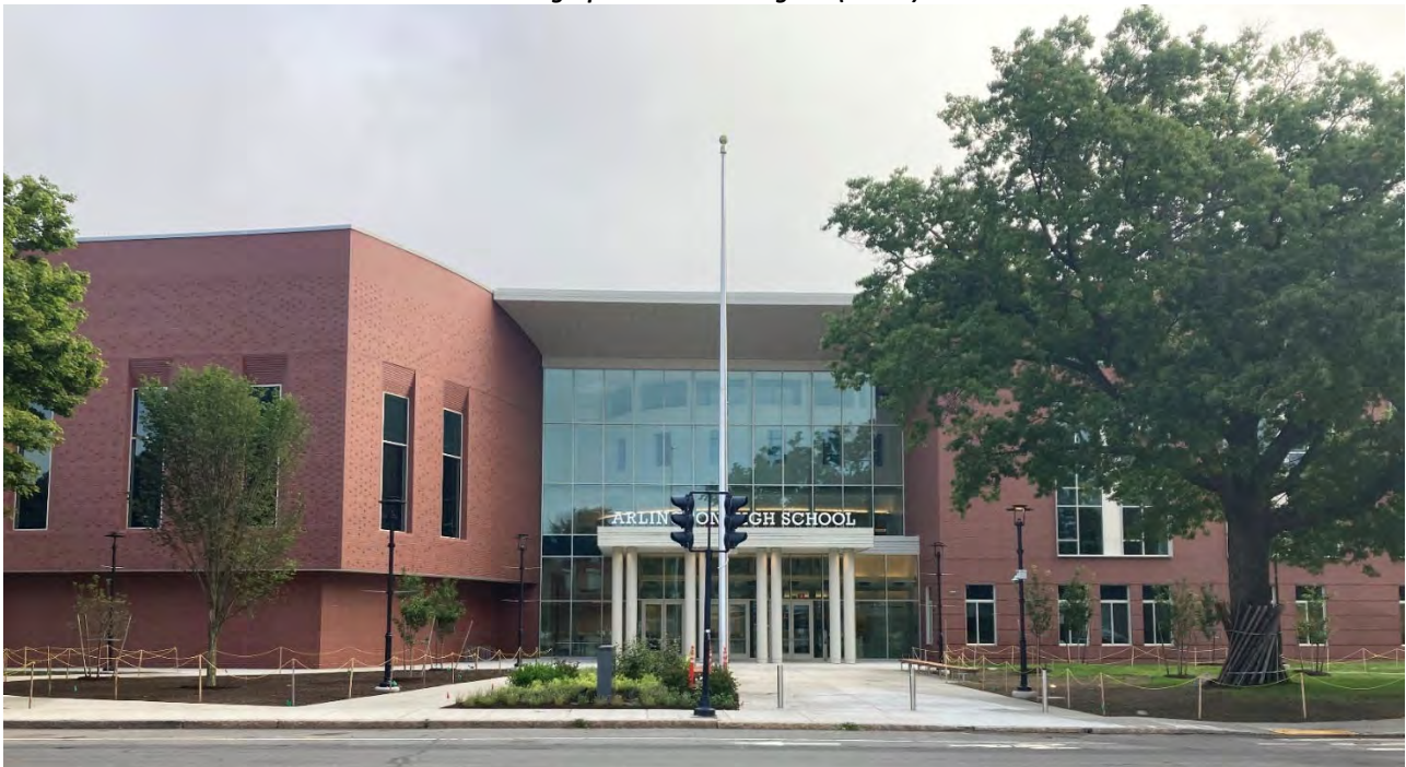
Photograph 2: Building D/E South Elevation (Main Entrance #1)