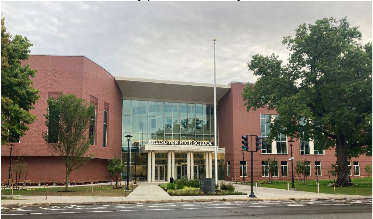
Photograph 2: Building D/E South Elevation (Main Entrance #1)