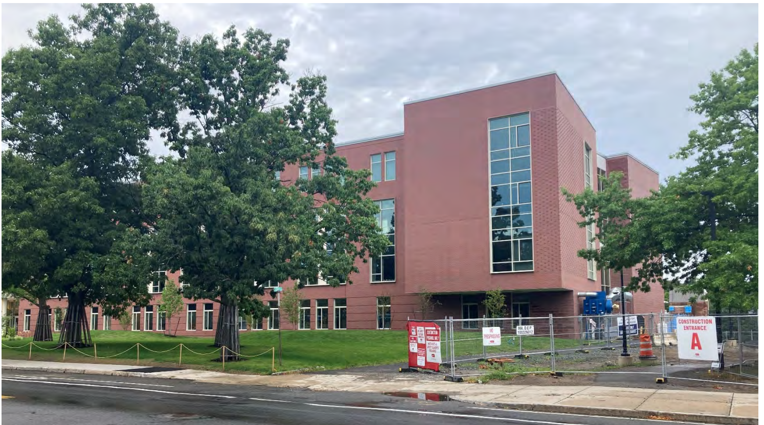
Photograph 4: D Building Southeast Elevation (Mass Ave)