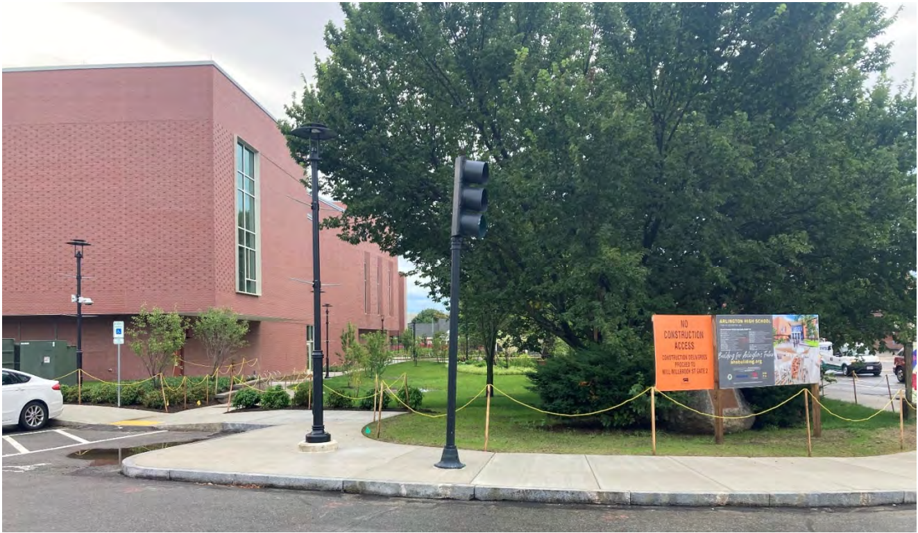
Photograph 3: Building E West Elevation (Schouler Court)