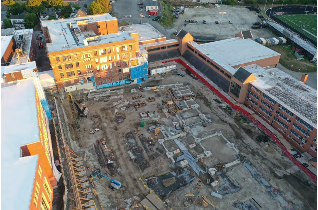
Photograph 1: Phase 2 Foundations Progress