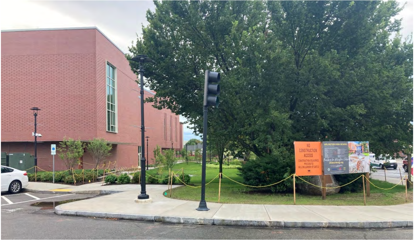
Photograph 3: Building E West Elevation (Schouler Court)