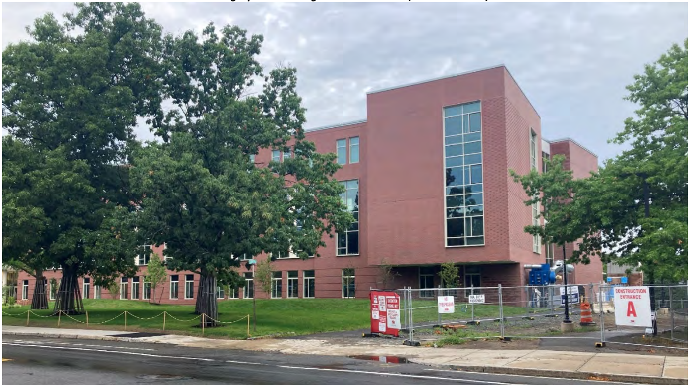
Photograph 4: D Building Southeast Elevation (Mass Ave)