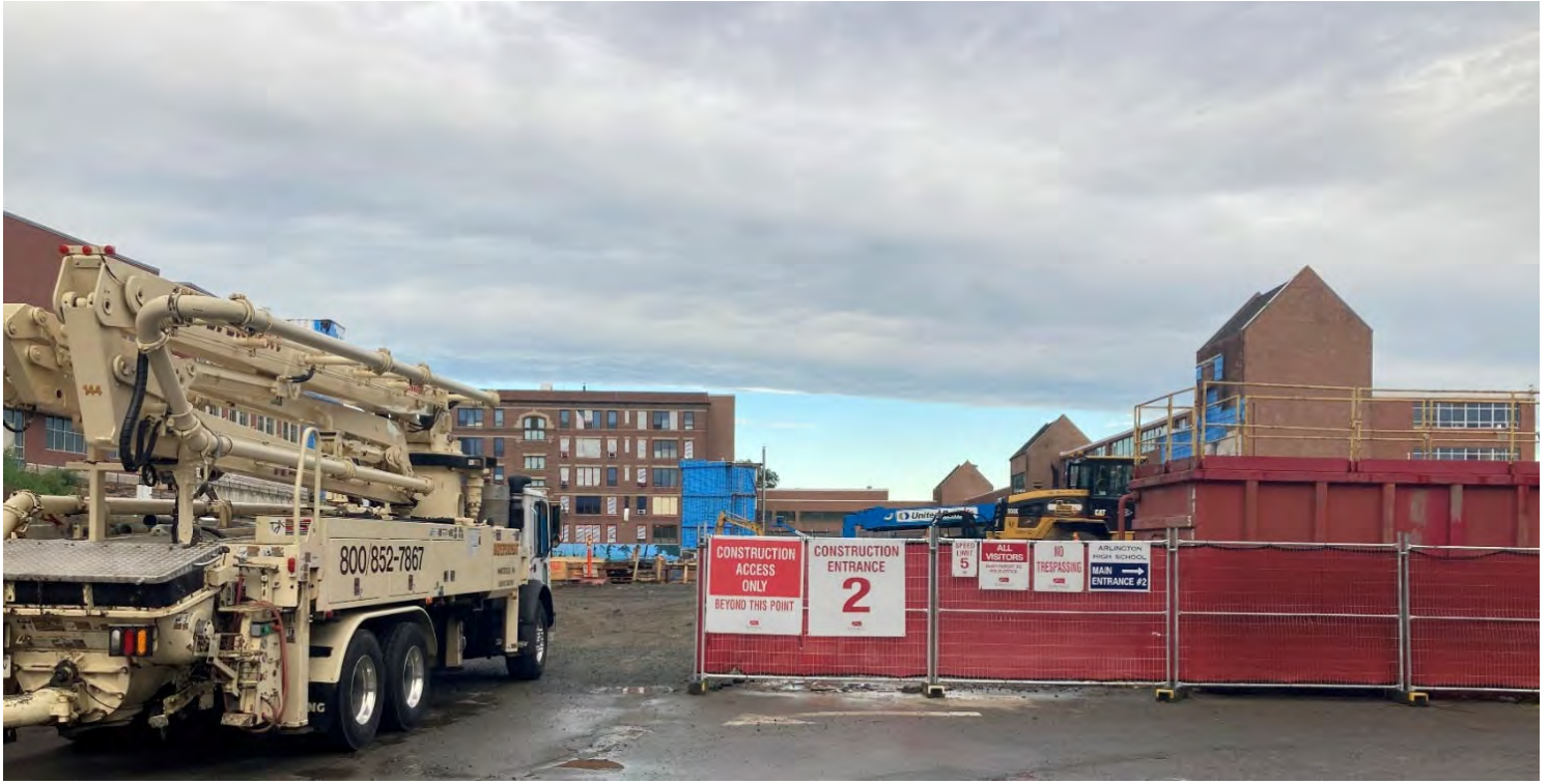
Photograph 5: Phase 2 East Elevation (Millbrook Drive)