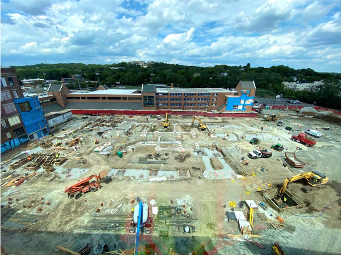
Photograph 1: Phase 2 Foundations Progress