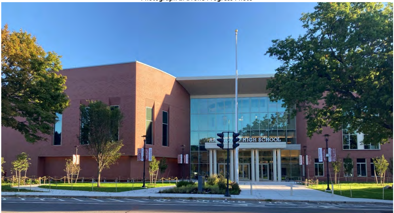
Photograph 2: Building D/E South Elevation (Main Entrance #1)