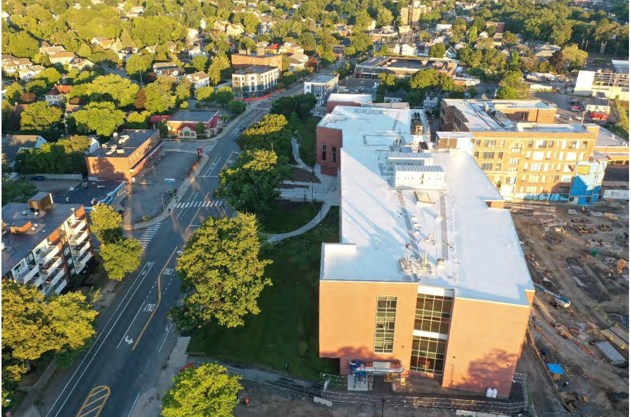
Photograph 2: Drone Progress Photo