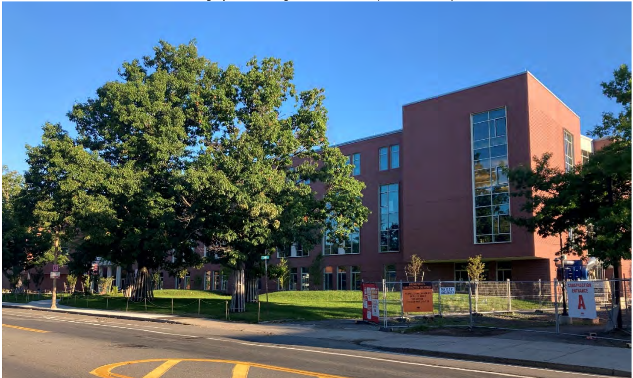
Photograph 4: D Building Southeast Elevation (Mass Ave)