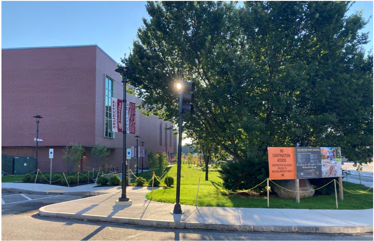
Photograph 3: Building E West Elevation (Schouler Court)