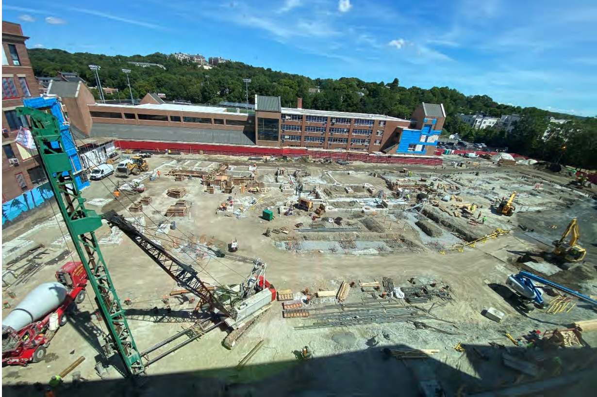
Photograph 1: Phase 2 Foundations Progress