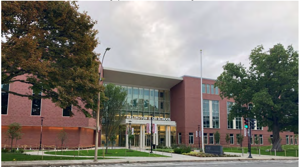
Photograph 1: Building D/E South Elevation (Main Entrance #1)