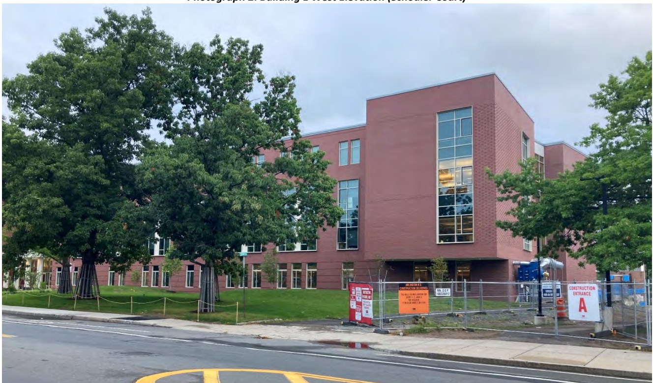
Photograph 3: D Building Southeast Elevation (Mass Ave)