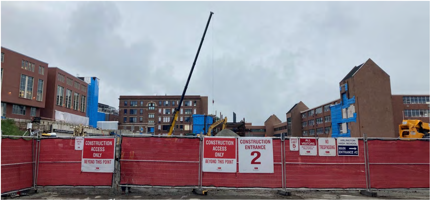
Photograph 4: Phase 2 East Elevation (Millbrook Drive)