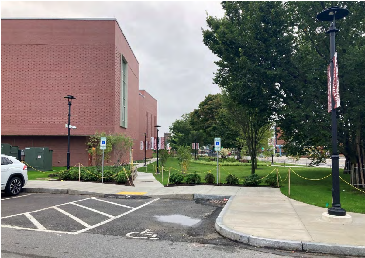
Photograph 2: Building E West Elevation (Schouler Court)