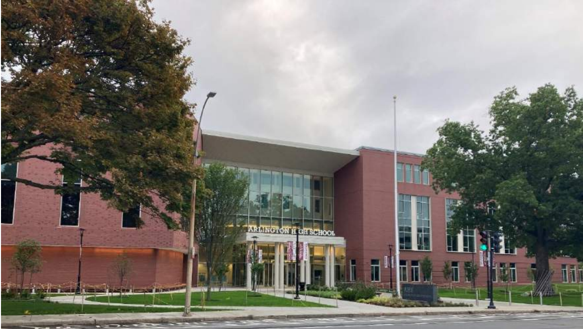
Photograph 1: Building D/E South Elevation (Main Entrance)