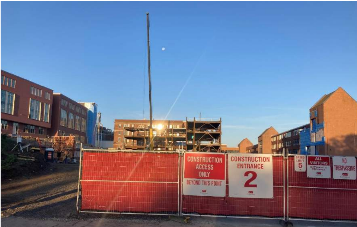
Photograph 2: Phase 2 East Elevation (View from Mill Brook Drive)