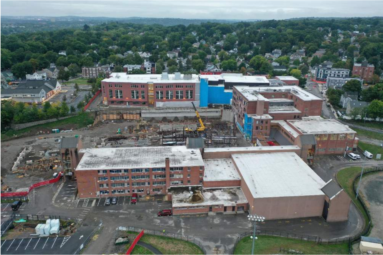
Photograph 3: Aerial Photo (Photo taken 9/21/22)