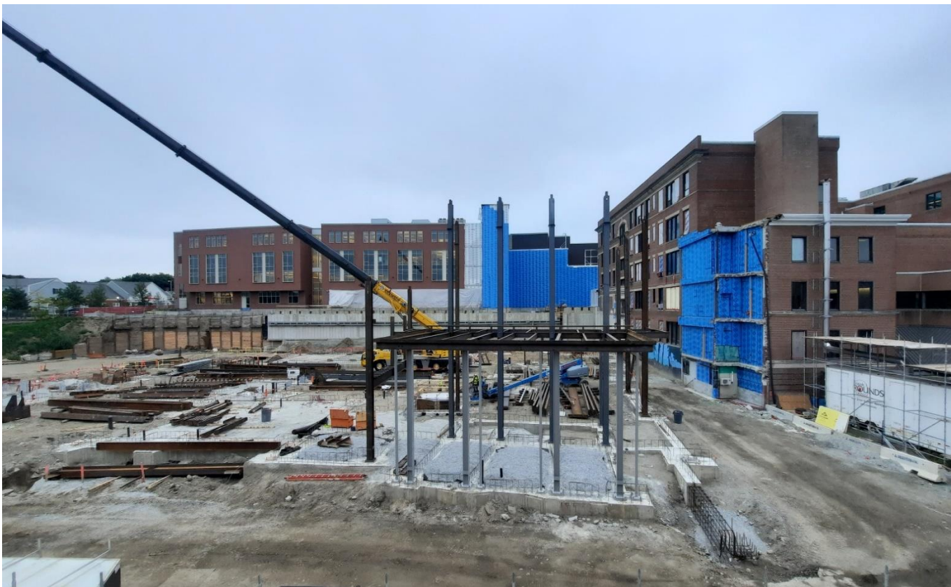
Photograph 2: Phase 2 North Elevation (View from Downs House). Photo taken 9/30/22