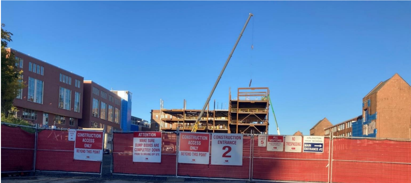
Photograph 1: Phase 2 East Elevation (View from Mill Brook Drive)