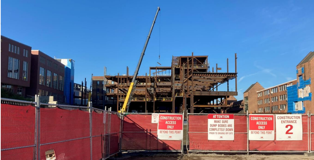
Photograph 1: Phase 2 East Elevation (View from Mill Brook Drive) Taken Week of 10/31/2022