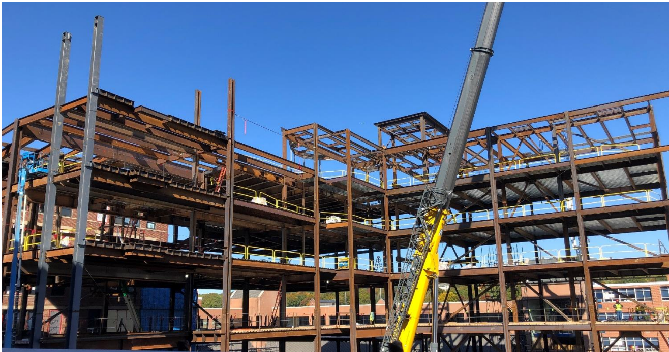
Photograph 2: Steel Install Progress