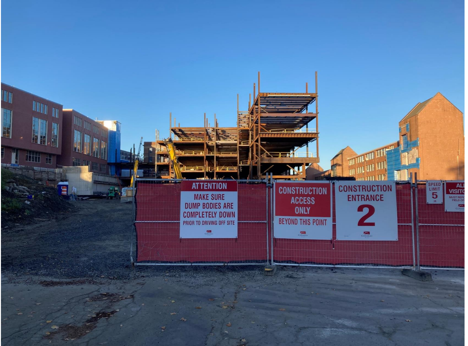
Photograph 1: Phase 2 East Elevation (View from Mill Brook Drive) Taken Week of 11/7/2022