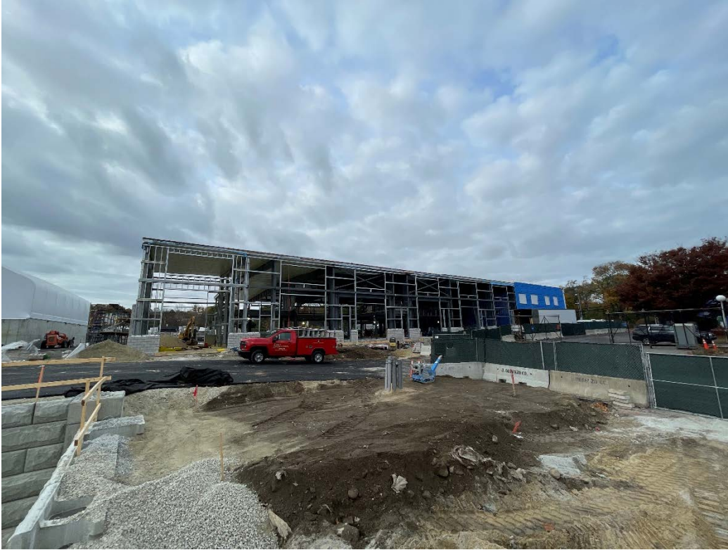
Photo #5 – Building E Admin. & Maintenance – East Elevation (11/8/22)