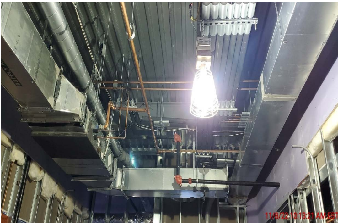
Photo #2 – Building E Admin. MEP & FP Rough, Insulation/Drywall Tops of Walls (11/8/22)