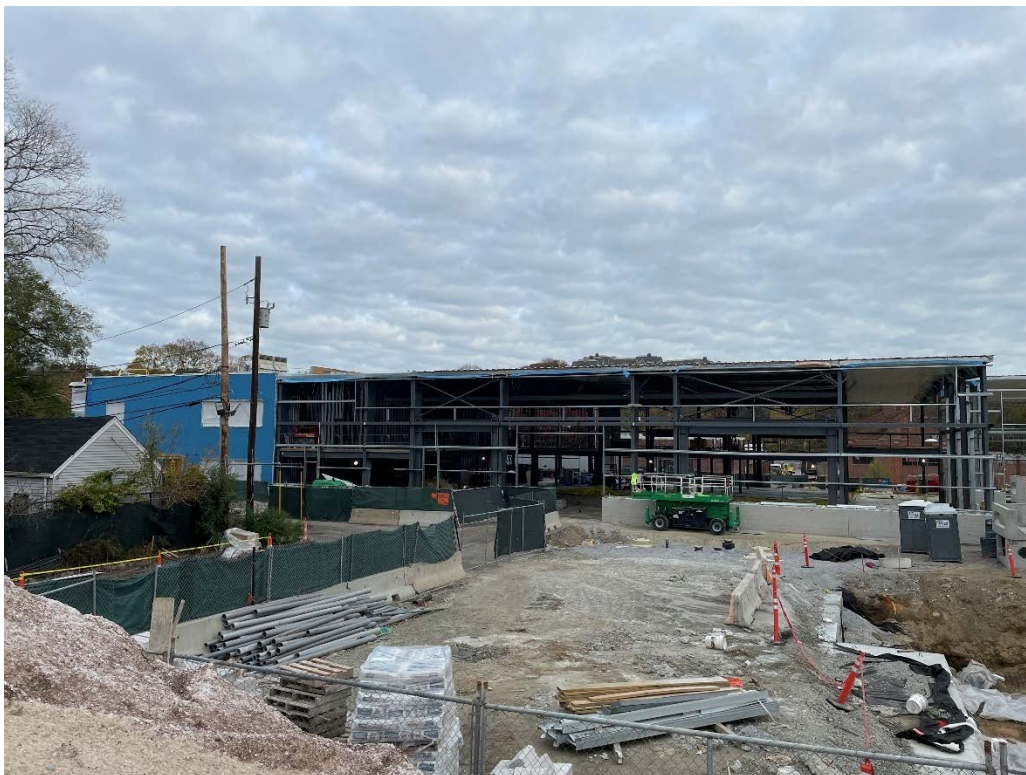
Photo #4 – Building E Admin. & Maintenance – West Elevation (11/8/22)