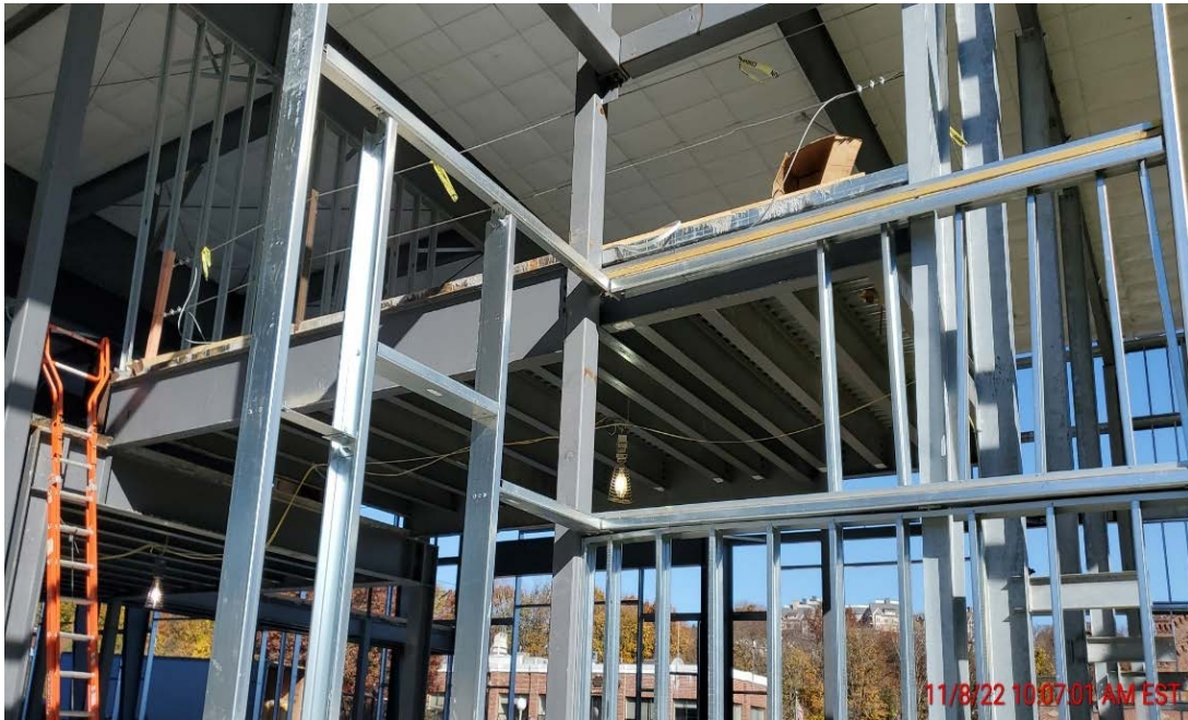
Photo #7 – Building E Maintenance Roof Insulation at Installed Standing Seam Metal Roof, Mezzanine (11/8/22)