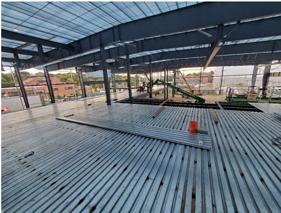
Photo # 4 – Building E Maintenance: Mezzanine decking in preparation of Slab on Deck (10/3/2022)