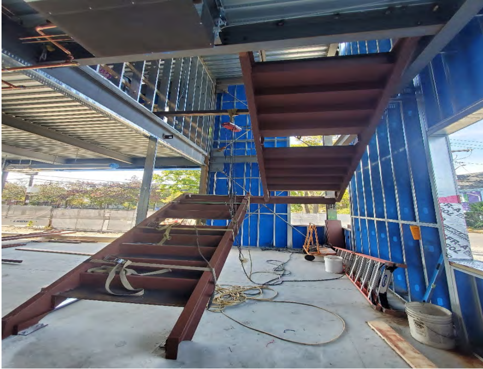
Photo # 3 – Building E Administration: Stair #2 installation (10/12/2022)