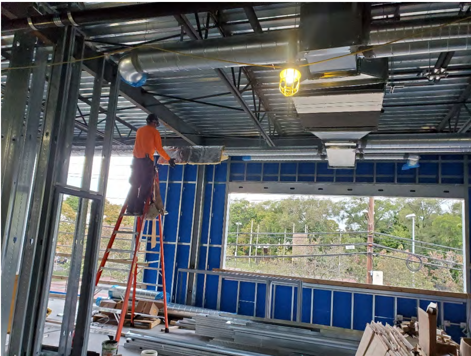
Photo # 2 – Building E Administration: MEP Rough-in/insulating pipe (10/3/2022)