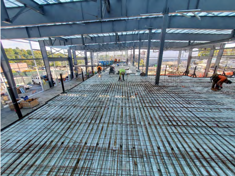
Photo #5 – Building E Maintenance: Rebar at Mezzanine prior to Slab on deck pour (10/7/2022)