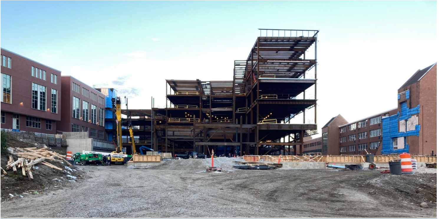
Photograph 1: Phase 2 East Elevation (View from Mill Brook Drive)